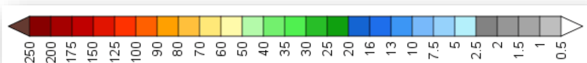
Figure:2. Precipitation forecast for 07 to 15 October 2020.

Disclaimer: The predictability of weather depends on many dynamic factors. The success of Agromet advisories provided here depends on the accuracy of the forecasts. In no event will India Meteorological Department (IMD) and Indian Council of Agricultural Research (ICAR) be liable to the user or any third party for any direct, indirect, incidental, consequential, special or exemplary damages or lost profit resulting from any use or misuse of the information on this bulletin.