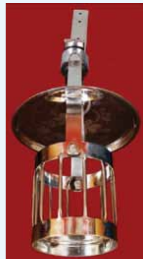
Licking of a mineral block by mithun and mineral dispenser