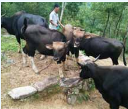
Mithun provided to Gidemi Village Council