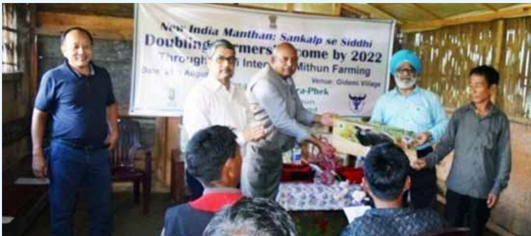
MOU between VCC, Gidemi and ICAR-NRC on Mithun, Medziphema

Two mithun sheds were constructed at Gidemi village with the help of inputs provided by the Institute under the TSP program. Following the completion of the shed, Travis and fencing area 6 mithun (1 bull and 6 heifers) were supplied from the Institute side to the village.