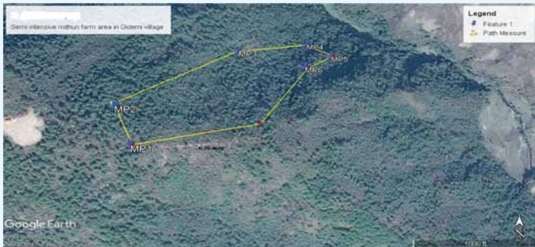
GPS mapping forest land at Gidemi village allotted for semi-intensive mithun raising

Semi-intensive farming was successfully introduced and adopted as a viable and sustainable economic activity in Gidemi Village adopted under Doubling Farmers Income by 2022. Two herdsmen were employed by the village development board to oversee the enterprise with initial financial assistance from ICAR-NRC on Mithun for 6 months. The initial investment on mithun heifers and bull was Rs2,40,000/- @ Rs 40,000/- Rearing the mithun for 20 months the market value of the stock is at Rs4,20,000/- @Rs 70,000/-. Four mithun calved (3 male and 1 female) following synchronization of oestrus. The rest of one mithun heifer is at an advanced stage of pregnancy. The stock at present has therefore increased to 10 animals and the market value shall be at Rs5,00,000/- approximately considering Rs 20000/- as market price per calf.