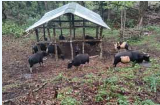
Village: Mai State: Arunachal Pradesh