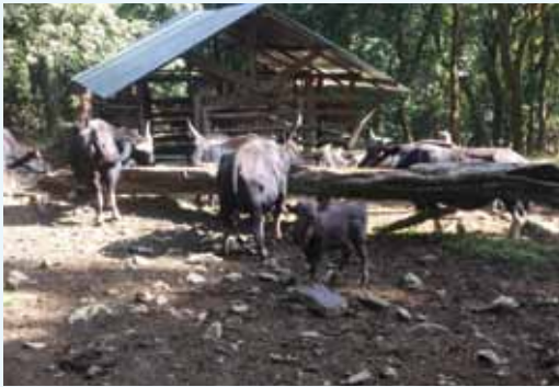
Village: Yangkhullen State: Manipur