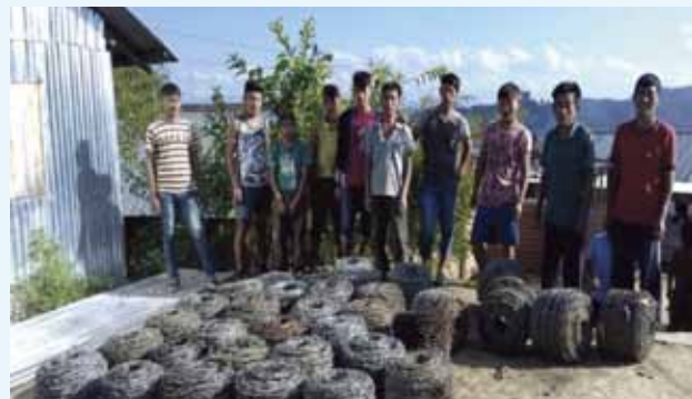
Village council members and youth receiving the inputs for semi-intensive mithun farming.