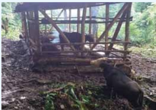
Village: Tobu State: Nagaland