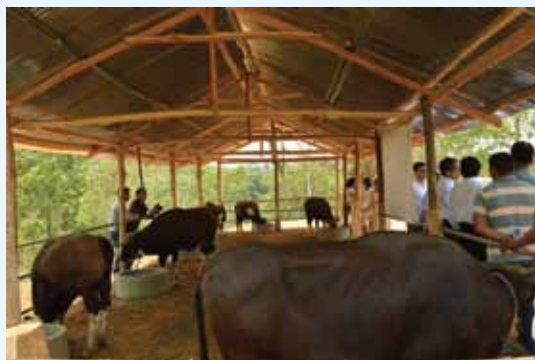
Village: Molvom State: Nagaland