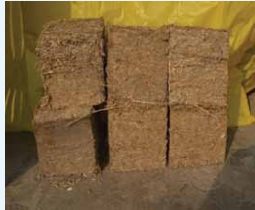
Feed block preparing machine and feed blocks prepared

incorporated into feed blocks. These feed ingredients are deficient in nutrients. Preparation of compressed complete feed block reduces wastage of feeds in the form of residues. It also opens an avenue for improvement of the ration by incorporating deficient nutrients and increases in production.