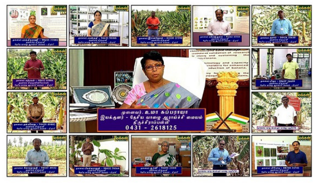
The Director and Scientists of NRCB delivering lectures and demonstrating technologies on Makkal TV

During the lockdown, a comprehensive program comprising eleven episodes on banana technologies for technological backstopping for banana farmers and other stakeholders was telecast through "Malarum Boomi", a popular agriculture-based program of Makkal TV, a regional TV channel. The program covered improvement, production, post-harvest and protection aspects of banana cultivation.