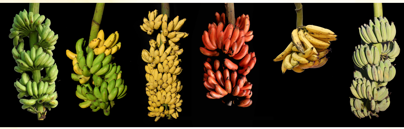
Traditional Bananas with Export Potential