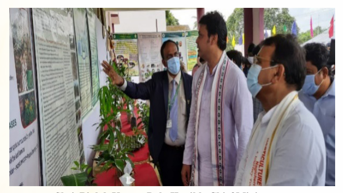
Shri. Biplab Kumar Deb, Hon'ble Chief Minister, Tripura Visiting ICAR-NRCB Stall

ICAR-NRCB initiated collaboration with Government of Tripura during "Progressive Farmers' Meet on Horticulture Development with Special Reference to Banana" which was held during 17-18 August, 2021. The meet was inaugurated and graced by Shri Biplab Kumar Deb, Hon'ble Chief Minister, Tripura. Around 600 farmers participated.