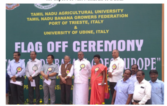
Flagging off ceremony at TNAU, Coimbatore for export of var. Grand Nain to Italy