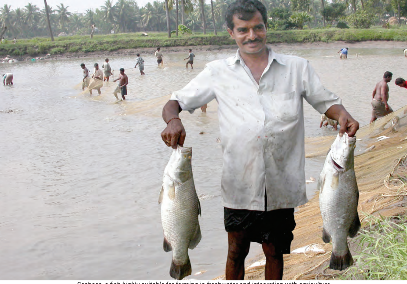
Seabass, a fish highly suitable for farming in freshwater and integration with agriculture

Seabass that are harvested 1.0 kg and above can fetch better price, since it is the most preferred size by the consumers in domestic market.