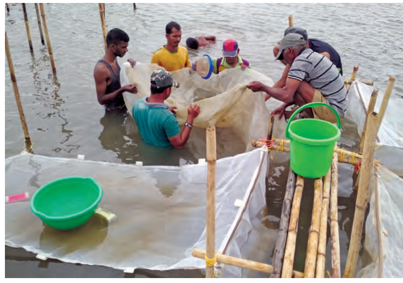
Grading of seabass fry in nursery rearing

Coastal fishers can practice seabass nursery rearing in net hapas fixed in open water bodies or in ponds. Hapas can be fabricated using nylon or High Density Polyethylene net material of sizes such as 2mx1mx1m or 2mx2mx1m and can be fixed in water top layer at a required depth (1.0 to 1.5 m). Hatchery produced seeds of 1.5 to 2.0 cm size can be stocked in hapas @ 500 - 750 nos/ m<sup>2</sup>. The fry