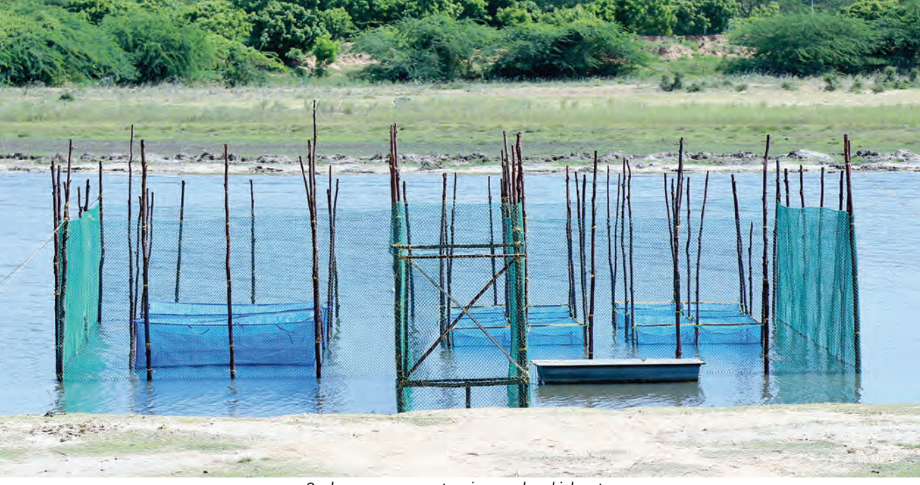
Seabass nursery system in open brackishwater