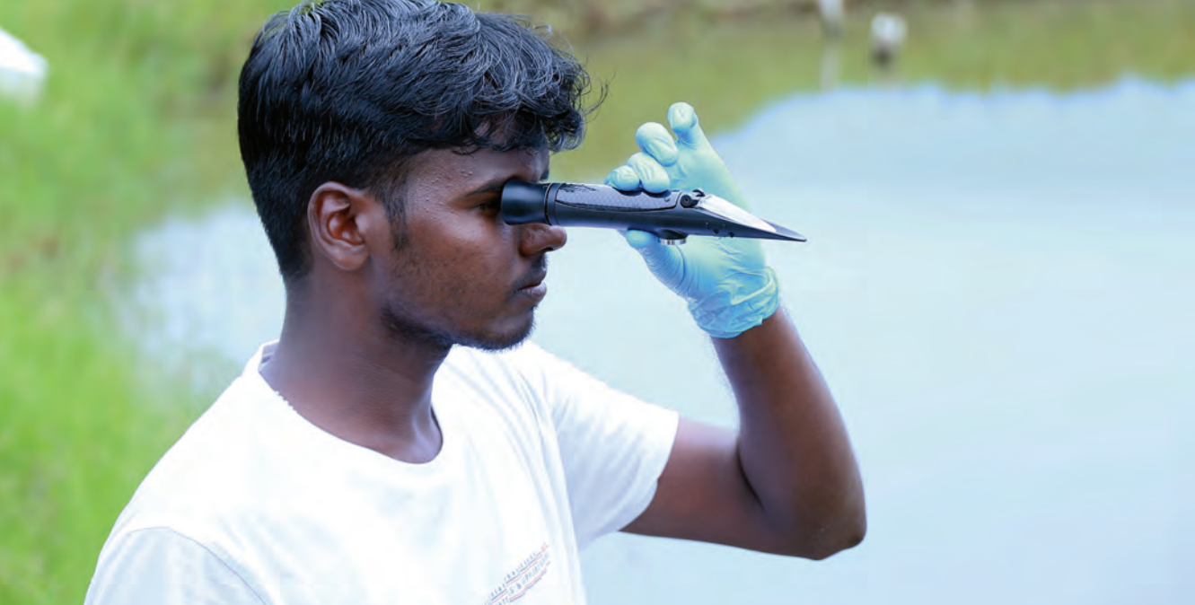
Regular monitoring of water parametres using kits