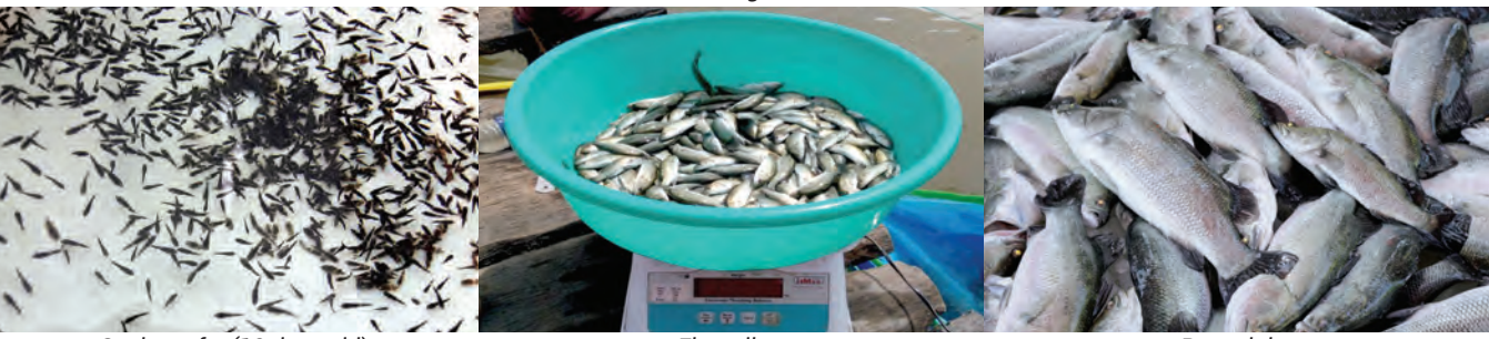
Seabass fry (18 days old)