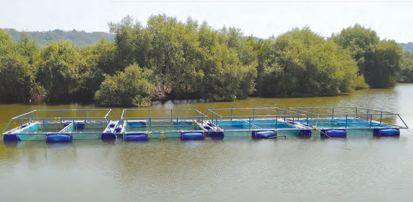
Customized cost-effective cages fabricated using steel frames and plastic barrels