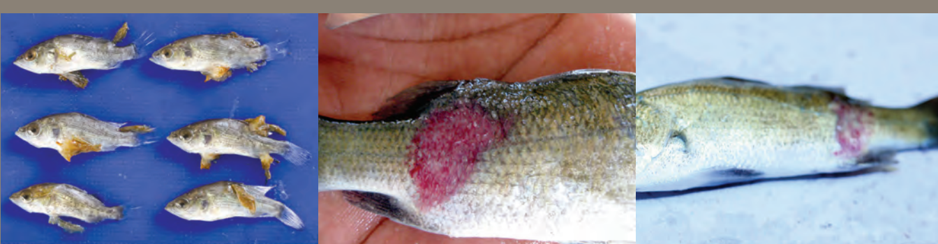
Occasionally, young seabass will get infested with external parasites and microbial pathogen