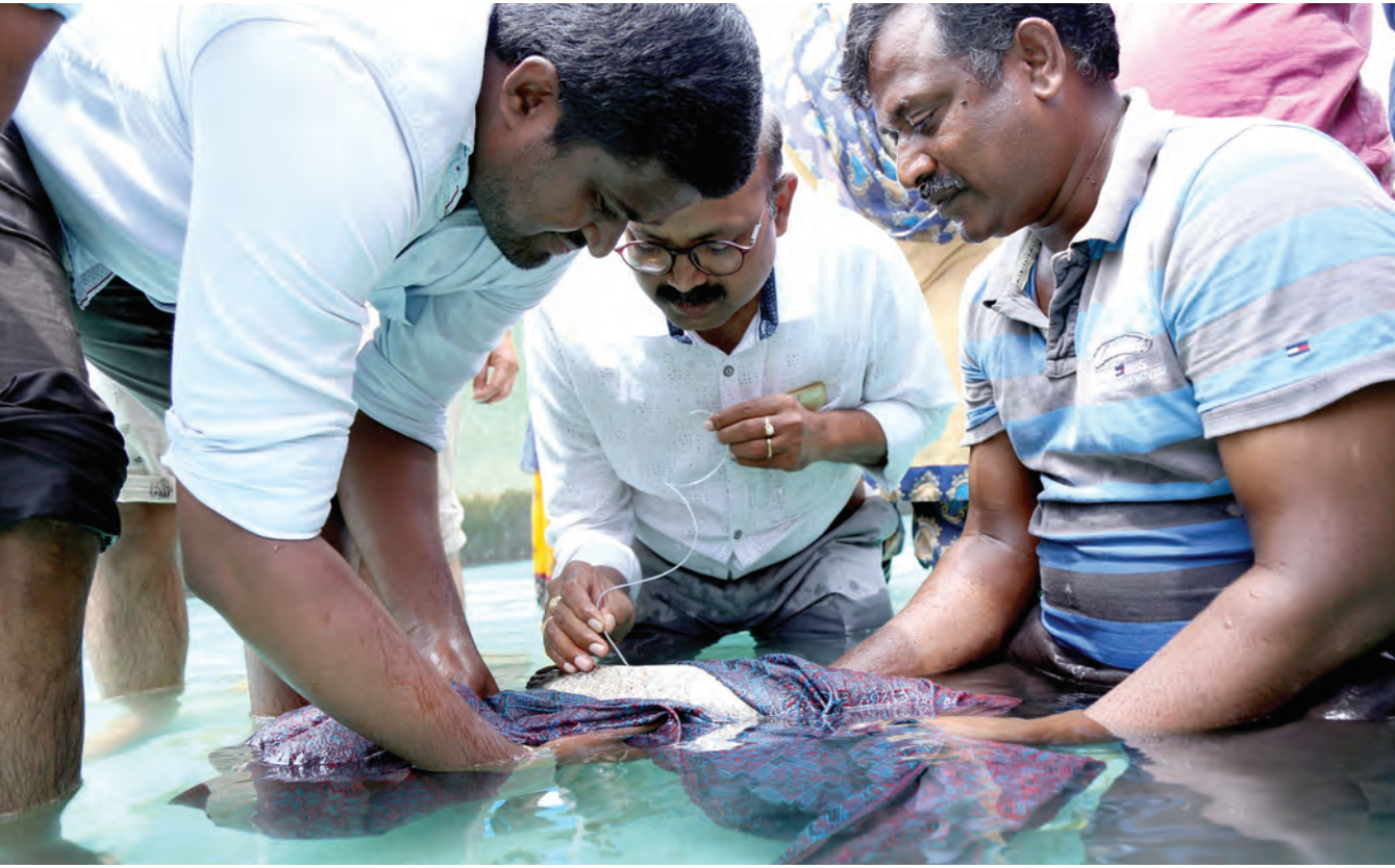
Analysis of maturation stage in captive broodstock maintained in CIBA fish hatchery

There is no sexual dimorphism in seabass. However, small size fishes with a size range from (2-3.5kg) can be males which can be confirmed by observing oozing milt when gentle pressure is applied on the abdomen. In the case of matured females, the fish can be noticed with an enlarged V- shaped belly and genital opening can be seen.