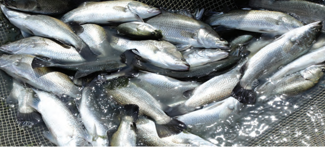
Seabass from pre-grow out system

Seabass can be farmed in ponds and cages. In the pond system, seabass advanced fingerlings can be stocked @ 4,000-5,000 nos/ha to get the production around 4.0 tons/ha. Seabass can be farmed both in freshwater and brackishwater ponds. The preferred pond size can be 0.5 to 1.0 ha. The size can be either rectangular or circular and the dimension can be decided based on the production plan. Seabass advanced fingerlings can be stocked @ 25-30 nos/m<sup>2</sup> in the cage culture system and the productivity can be @ 20-25/nos/ m<sup>2</sup>. Recently, farming of seabass in land-based tanks with RAS facility has been gaining popularity, where the productivity can be increased. For cage culture in open water, parameters such as water depth, water flow rate, etc., need to be considered by selecting the site.