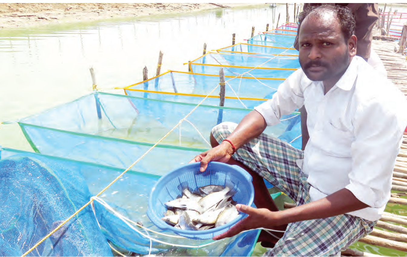
Organised seabass nursery rearing in pond based system

The juvenile fish (80-100 g) stocked will grow into the average size of 1 kg in 6-8 months. They can also be reared further for another 4-5 months to get a size of 2 kg which can fetch premium price in market.