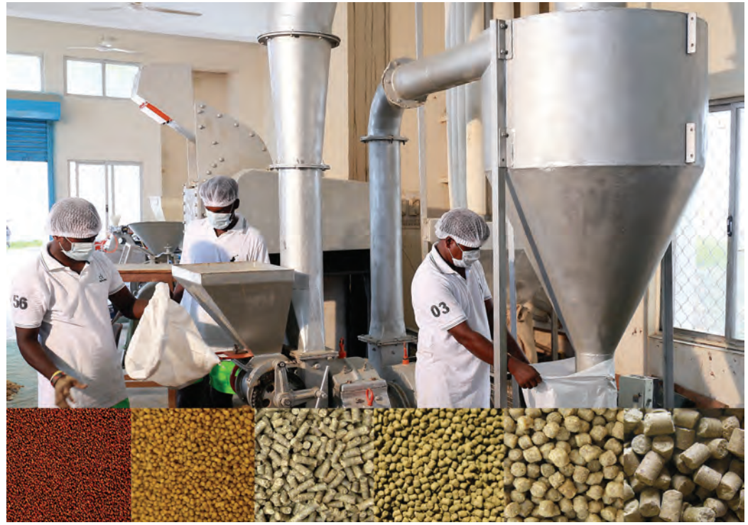
Pilot scale feed mill at Muttukadu Experimental Station of CIBA

Quality feed must be provided in right quantity to get maximum growth and to reduce the feed wastage besides reducing the cost of production. The size of feed particle should be suitable for mouth of fish and they should be trained to take feeds at certain time daily. Feed ration is calculated based on body size. The percent quantity of feed required is higher at the initial stages and as the fish grows, it decreases. But the absolute quantity of feed offered increases as