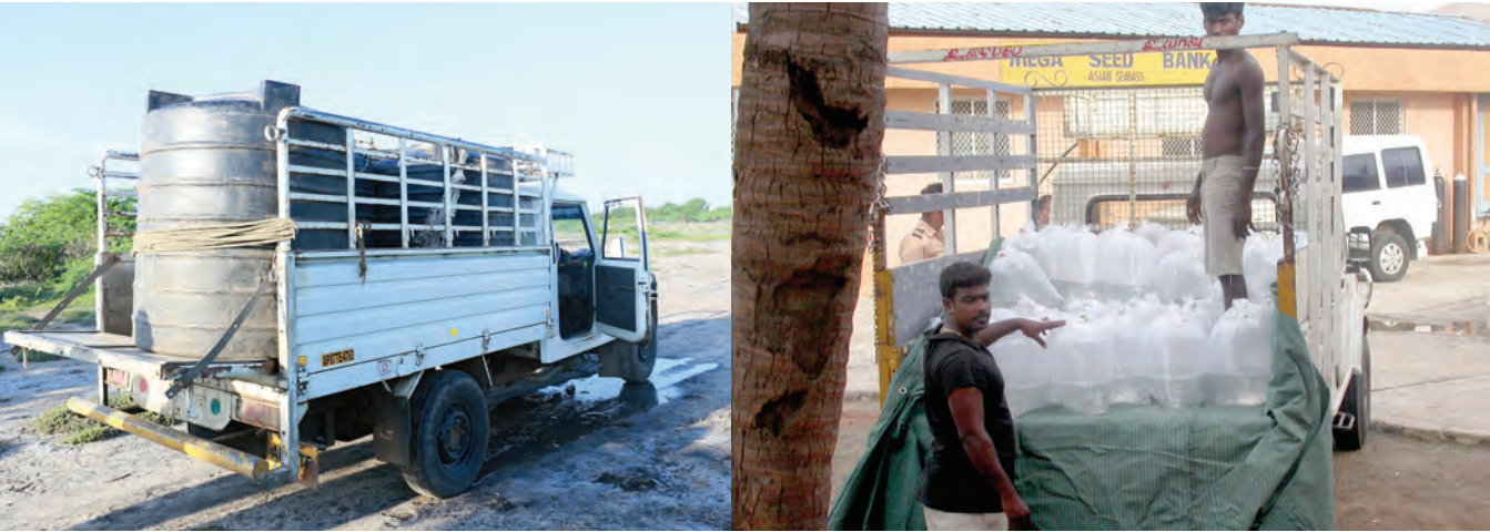
Live transportation of seabass seeds