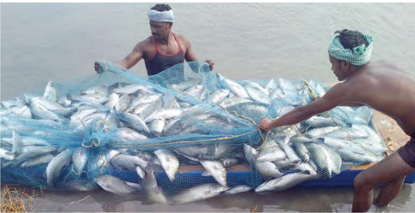
Farmed seabass harvested from pond

and makes the species in wide range culture environments from freshwaters to seawater. It can be farmed in ponds and cages from freshwater to seawater environments. The fish can grow to 1.0 kg size in 6-8 months by consuming pellet feed. Availability of hatchery produced seed and formulated pellet feed ensures the year-round supply and thus enables easy adoption of seabass farming by farmers. It can also be farmed in net cages, floating cages and Recirculatory Aquaculture System (RAS).