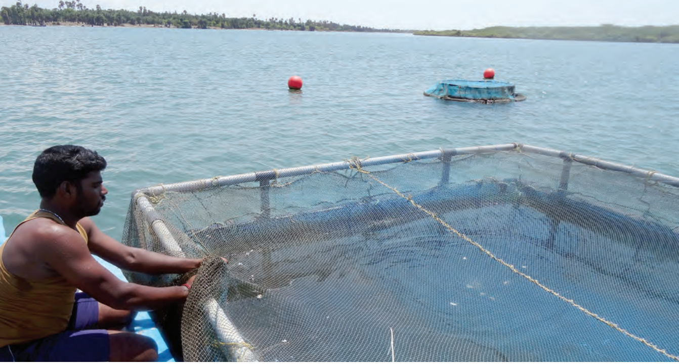
Timely feeding and its management are crucial for a successful harvest

CIBA's Seebass<sup>Plus</sup> feed can be used in all the stages of cage farming. The feeding rate is 6-4% of body weight in pre-grow out stage and 4-2% in grow-out stages on an average the FCR in pre and grow out stages are 1.5%. The daily ration is equally distributed in two feedings preferably in the morning and evening hours.