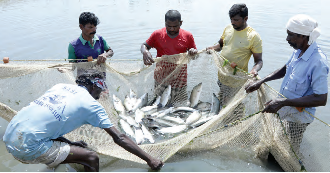
Seabass farmed in brackishwater pond in a short grow-out farming cycle as option for crop rotation in shrimp farming