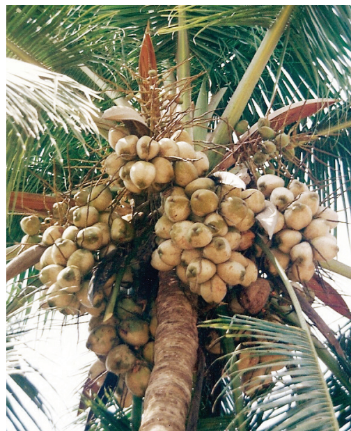
Kalpatharu - a high yielding ball copra variety