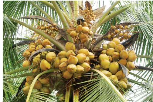
Chandra Sankara - a high yielding D x T hybrid variety

Chandra Sankara was the first hybrid developed at the institute to be recommended for commercial cultivation in the year 1985 and is the most popular Dwarf x Tall (D x T) hybrid in the country. This hybrid was produced by crossing Chowghat Orange Dwarf palms (female parent) with pollen from elite West Coast Tall palms (male parent). The palms come to bearing early when compared to the tall WCT parent. The palms of this variety are semi tall in habit, with circular canopy. The average time taken for flowering is about 3 - 4 years, under favourable growth conditions. The fruits are round in shape and brown in colour. It is a heavy yielder and produces, on an average, 110-123 nuts/palm/year, with an estimated copra yield of 25-28 kg copra/palm/year or 4.40-4.82 t copra/ha yielding 2.99 t oil/ha. The hybrid progenies can easily be identified in the nursery, since the hybrid seedlings exhibit vigorous growth coupled with bronze-coloured petioles.