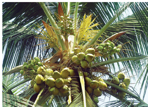
Kalpa Samrudhi - a high yielding dual purpose D x T hybrid variety