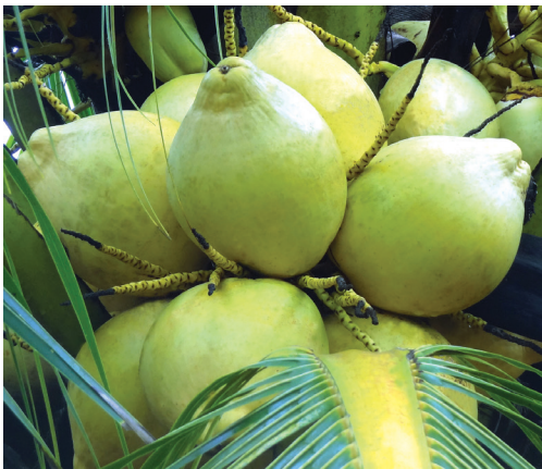
Kalpa Jyothi - fruit bunch

is around 380 ml and good in taste with TSS of 5.9 o Brix. The nutritive value of tender nut water: total sugars – 6.2 g/100 ml, free amino acids -1.7 mg/100 ml, sodium – 36 ppm, potassium – 1998 ppm. The average fruit weight of Kalpa Jyothi variety is 649 g, with copra content of 142.42 g/nut, with copra oil content of 61.5%. The palms commence flowering 38 months after planting in the field. However, the average time taken for flowering in 50% of the palms in the population is 51 months. No major disease outbreaks have been observed under field conditions. However, the palms of this variety are moderately susceptible to bud rot. No major pest attacks have been observed under field conditions. However, the palms of this variety are attacked by rhinoceros beetle as well as red palm weevil. It is also moderately affected by eriophyid mite. Dwarf varieties in general are