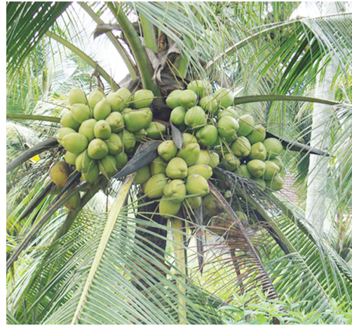
Kalpa Sankara - a root (wilt) disease tolerant hybrid variety

Kalpa Sankara is a D x T coconut hybrid developed in 'hotspots' of root (wilt) disease by crossing root (wilt) disease-free Chowghat Green Dwarf female parents with pollen of root (wilt) disease-free West Coast Tall male parents. Kalpa Sankara is found to be a high yielding root (wilt) disease tolerant variety suitable for cultivation in the root (wilt) affected tracts in the country. The palms of this variety are semi-tall in nature with precocious bearing habit. The palms attain a height of around 4.98 m at 18 years of age and come to flowering 3-4 years after planting. The quantity of tender nut water