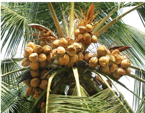
Chandra Laksha - a high yielding drought tolerant hybrid variety

The fruits are oval in shape, medium-sized and the average copra content