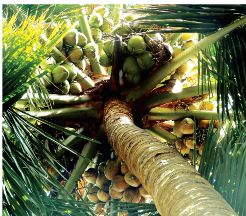
Kalpa Sreshta - a high yielding dual purpose D x T hybrid variety