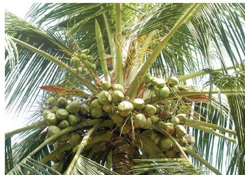
Kalpa Mitra - a high yielding drought tolerant variety

The variety is recommended for cultivation in the states of Kerala and West Bengal. The recommendation by the XVIII Biennial Workshop of All India Coordinated Research Project on Palms, in 2007, was based on the superior performance of this variety at CPCRI, Kasaragod in Coastal Kerala and AICRP on Palms Centre Mondouri, West Bengal. The variety release proposal was approved by the Central Sub-committee on Crop Standards, Notification and Release of variety and this variety was released and notified vide Notification of Ministry of Agriculture (Department of Agriculture and Co-operation) S.O. 1714(E) dated July 18, 2008.