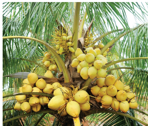
Kalpa Jyothi - a dwarf tender nut variety