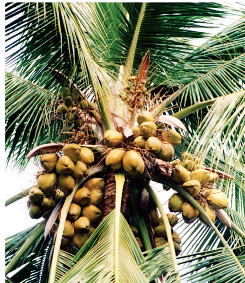
Kera Keralam - a drought tolerant variety

The WCT palm grows well in all types of soil and is comparatively drought tolerant. Based on the superior performance of the WCT accession provided from CPCRI to AICRP on Palm centres at Aliyarnagar, Veppankulam, and Mondouri, the XVIII Biennial Workshop of the All India Coordinated Research Project on Palms during the year 2007 recommended Kera Keralam for large scale commercial