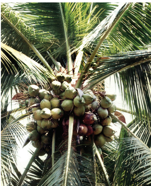
Kerachandra - a high yielding dual purpose variety

Kerachandra was developed as a selection from IND014, the exotic accession Philippines Ordinary Tall. The palms of this variety grow to a height of 10-12 m at the age of 25 years, are regular bearers and produce large, round and green fruits. It is a good yielder with an annual average yield of 110 nuts/palm and copra yield of 20.8 kg/palm/year, an increase of 37.5% and 50.7% for nut and copra yield over the local West Coast Tall. The seed nuts of this variety germinate early, with majority of the nuts germinating within two months after sowing in the nursery. The fruits are large, with mean copra content of 198 g/nut and 66% oil content in copra. Because of