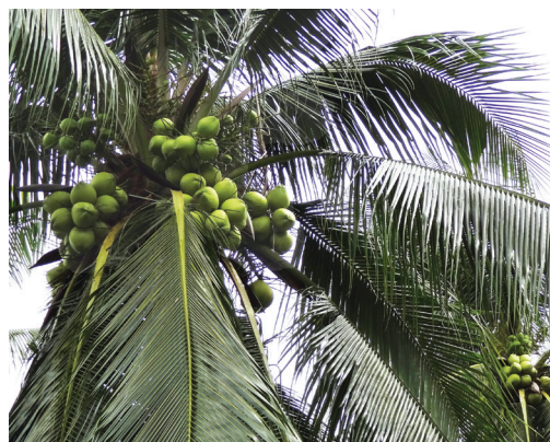
Kalpa Haritha - a dual purpose variety