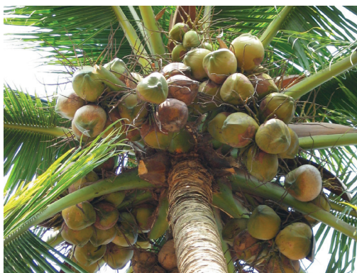
San Ramon Tall - large fruit size, high copra content

leaf rot and root (wilt) disease of Kerala. San Ramon Tall selection can be grown for higher copra output. However, the nut yield is lower, an average of 66 nuts/palm/year, due to the large size of the fruits.