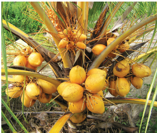
Chowghat Orange Dwarf – a popular tender nut variety

The fruits are small with an average weight of 634 g and average copra content of 128 g/nut and 66% oil. Chowghat Orange Dwarf was found to have the higher total sugar content in the tender nut water on comparative evaluation of tender nut water quality in 44 accessions at CPCRI, Kasaragod and hence was developed by CPCRI as a tender nut variety. The tender nut water of 7 month old fruit is sweet with total sugar - 7 g/100 ml and sodium and potassium of 20 ppm and 2000 ppm,