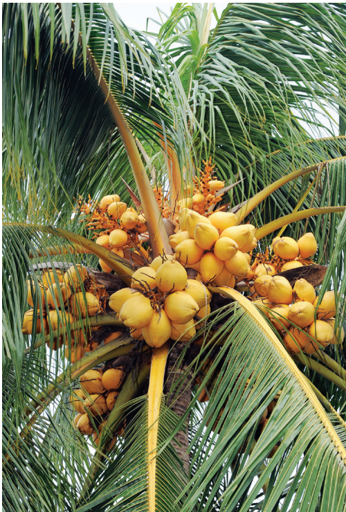
Kalpa Surya - a dwarf tender nut variety

attains a height of 6.5 metres at the age of 26 years. Under irrigated conditions, initiation of flowering is observed within three years of planting. However, under rainfed conditions, average time taken for flowering in 50% of the palms in the population is 59 months. The seed nuts of this variety germinate quickly with 50% of the nuts germinating within 66 days after sowing. Germination during storage is also observed in this variety.