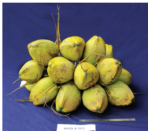
Kalpa Sreshta - Fruit bunch