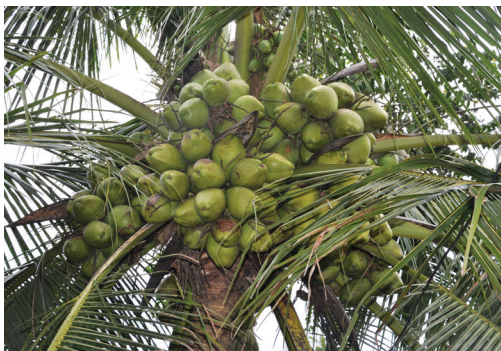
Kalpasree - a root (wilt) disease resistant variety

characteristic 'beak' when fully mature. Kalpasree has superior quality of coconut oil, very sweet tender nut water and kernel and is resistant to root (wilt) disease. The palm attains a height of around 4 m at 20 years of age. It can be grown for tender nut purpose as it contains nut water of 240 ml and is very sweet in taste. The nutritive value of tender nut water is as follows: total sugars - 4.80 g/ml, potassium - 2150 ppm, sodium - 22.40 ppm. The data on fatty acid profile of the coconut oil from this variety, reveals that Kalpasree is rich in long chain unsaturated fatty acids (LUSFA's) and is healthier compared to oil of WCT and COD. Coconut oil of Kalpasree also has 25% to 40% more essential fatty acids during all seasons compared to oil from WCT and COD, respectively. Besides, Kalpasree oil is rich in essential fatty acids especially linoleic acid. However, the variety is more sensitive to biotic stress and caution is advised to adopt plant protection measures against major pests