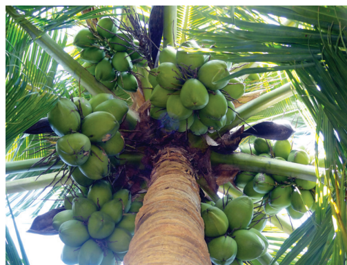
Niu Leka Green Dwarf - high copra content

The palms of the Niu Leka Green Dwarf selection developed by CPCRI are very dwarf with fruit characteristics and pollination behaviour similar to tall. The average weight of husked fruit is about 800 g with kernel weight of about 450 g yielding about 260 g of copra. The palms are dwarf characterized with higher number of leaf scars (over 33