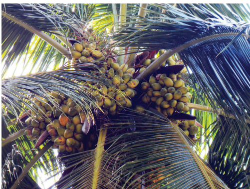
Laccadive Micro Tall - high nut and oil yield

This is a popular cultivar of the Lakshadweep Islands, and is sporadically found in coconut gardens of mainland India, especially in the state of Kerala. The Laccadive Micro Tall is a selection from the tall coconut populations of Lakshadweep Islands. The cultivar is unique for its heavy bunches with large number of micro nuts and has recorded highest copra oil content (75%) among the coconut accessions studied. The accession is also found suitable for ball copra production as the fruits of this cultivar have a very slow rate of germination, small nuts with less nut water aiding in very low spoilage during storage for making ball copra.