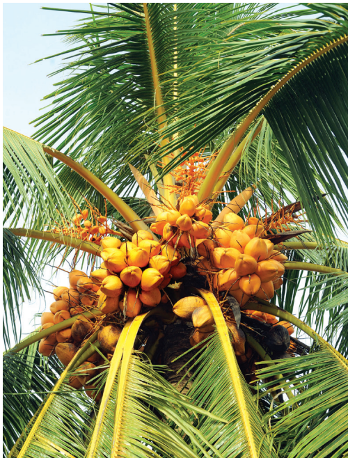
Cameroon Red Dwarf - high nut yield

in many genebanks across the world, including India. The Cameroon Red Dwarf is an ornamental palm, and can also be planted in gardens for landscaping. As with most Dwarf varieties, it is sensitive to drought and subject to alternate bearing.