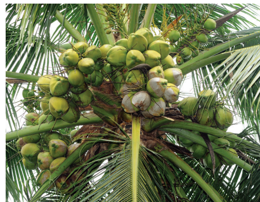
Kappadam Tall - high copra content

Kappadam Tall, an ecotype from the WCT coconut population of the southwest coast of India, is also known as ‘Chappadan’ in some parts of Kerala. Compared to the other Indian varieties from west coast populations, this cultivar produces larger fruits with thinner husk. The fruits of this selection are predominantly green, oblong to round in shape. The palms of this selection are tall statured with clear bole on the stem. The leaves are longer with broader and longer leaflets. The palms are strictly cross pollinating as there is no overlapping of male and female phases within and between inflorescences. The palm starts flowering