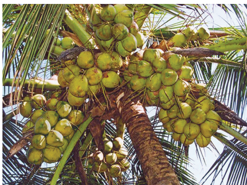
Kalparaksha - a root (wilt) disease resistant variety

Kalparaksha is a semi tall variety with higher level of resistance to root (wilt) disease and with sweet tender nut water, developed by Central Plantation Crops Research Institute, Regional Station, Kayamkulam. Kalparaksha was developed as a selection from Malayan Green Dwarf population introduced from Malaysia. Kalparaksha showed 22.4% root (wilt) disease incidence in comparison to 84.0% disease incidence in West Coast Tall (WCT) coconut, fifteen years after planting. The diseased palms of this variety scored an average disease index of 15.5 in comparison to a disease index of 45 in WCT. Kalparaksha attains a height of around 4.14 meters at 12 years of age and comes to flowering by 55 months from planting. Kalparaksha gives an average nut yield of 88 nuts/palm/year, with copra content of 185 g/nut and oil content of 65.5%. With