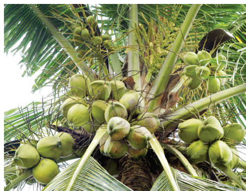
Kalpa Dhenu- a high yielding variety