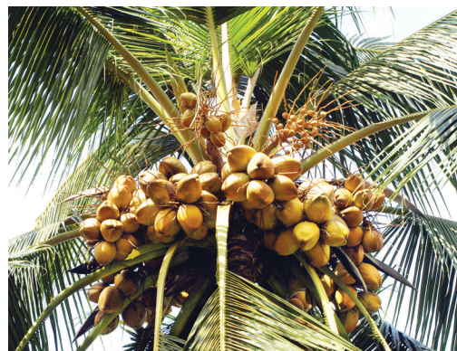
Kera Sankara - a precocious T x D hybrid variety