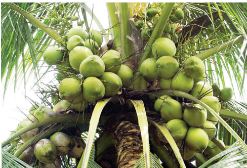
Kalpa Pratibha- a high yielding dual purpose variety

The average weight of the fruit is around 1332 g and from one fruit, on an average, 256.37 g of copra (dried endosperm) can be obtained. The copra contains about 67% of oil. The oil extracted from the copra of this variety has 47.81% of lauric acid. The average quantity of tender nut water is 448 ml and the tender nut water is classified as “good” in taste. The nutritive value of tender nut water is as follows: total sugars - 5.5 g/100 ml; free amino acids - 1.1 mg/100 ml; potassium - 2150 ppm; sodium - 21.7 ppm.