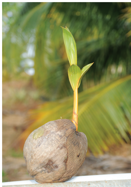
Early sprouting - Kalpa Surya seed nut