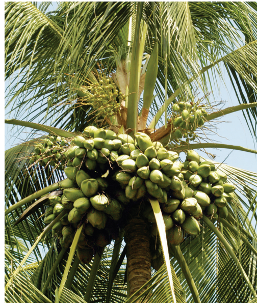
Chandra Kalpa - a high yielding ball copra variety

The palm grows in all types of soil and can withstand moisture stress. This variety was recommended by the VII Biennial Workshop of the All India Coordinated Research Project on Palms, in the year 1985, for large scale cultivation in the states of Kerala, Karnataka, Andhra Pradesh, Tamil Nadu and Maharashtra, based on the performance of this variety at CPCRI, Kasaragod, CPCRI Research centre Kidu and the centres under AICRP on Palms.