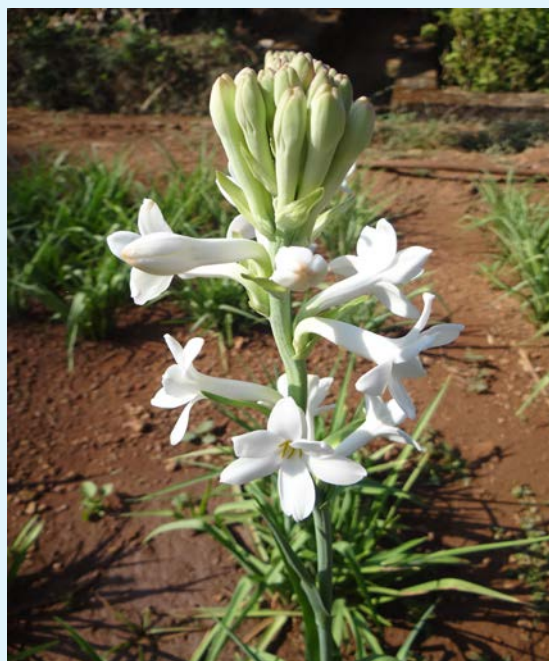
Single flower with one row/ whorl of corolla segment.

extraction. Single types are more fragrant than double. Concrete content has been observed to be 0.08 to 0.11 per cent. Loose flowers are