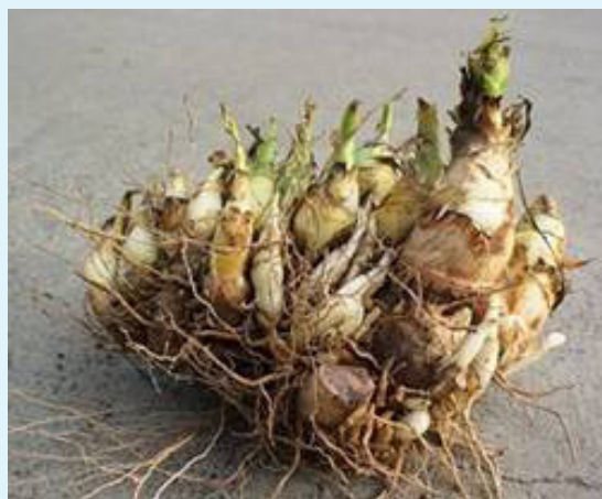
Tuberose bulbs in clumps

bulbs in 4% Thiourea solution for one hour if early planting is desired. Ethylene chlorohydrins can also be used for breaking the dormancy of bulbs. The bulbs are separated from the clumps by rubbing off the loose scales and the long roots should also be removed. Selection of suitable