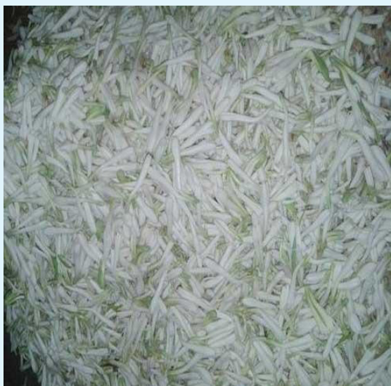
Loose flowers packed in bamboo baskets

Loose flowers of single - flowered tuberose are packed in bamboo baskets and the baskets are covered with muslin cloth or with wet gunny bags. About 10-15 kg fresh flowers are packed in each basket. They are also packed in gunny bags or polythene bags lined with newspaper. Then