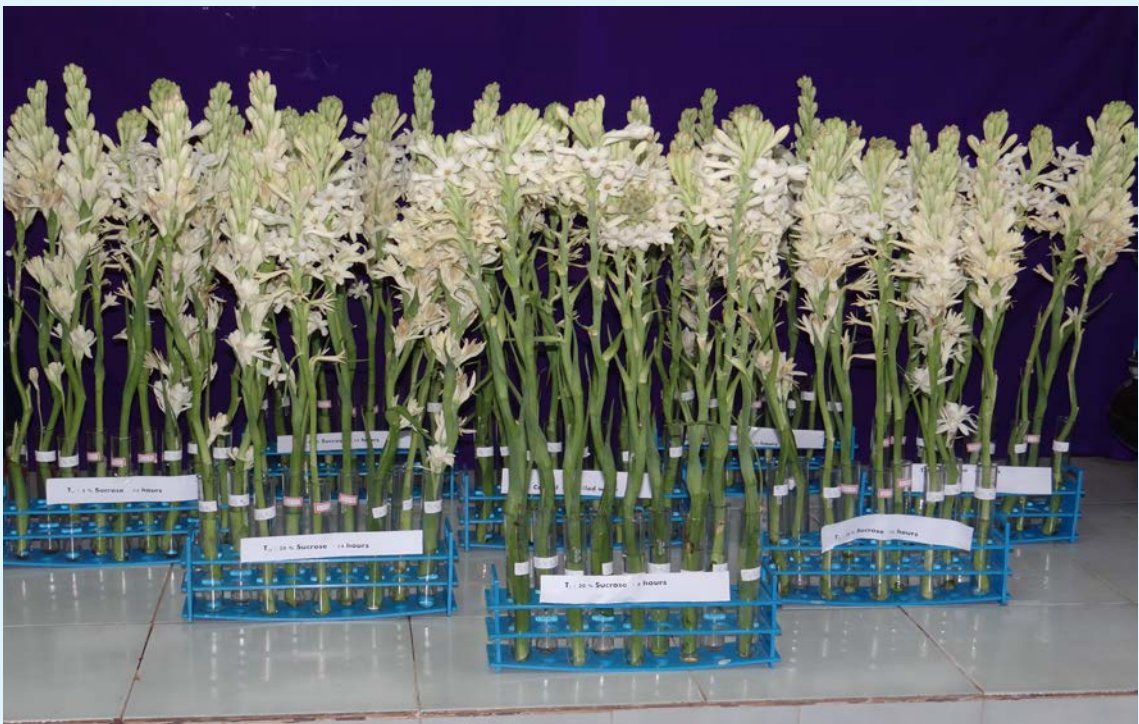
A view of vase life study taken up at the laboratory

Immediately after harvest, the lower portion of the cut spikes should be immersed in water for prolonging the vase life of spikes. The spikes are made ready by removing the unwanted leaves to minimise the transpiration loss for sending to floral markets. Further, pulsing of spikes at low temperature (10°C), for about four hours with the ends immersed in water, is helpful in prolonging life of spikes to be sent to distant markets.