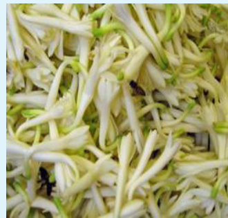
Single types harvested for loose flower purpose

by cutting the spikes from the base when 1-2 pairs of flowers open on the spike. Spikes are harvested at bud-burst stage preferably in the morning before sunrise or late in the evening by clipping with a sharp knife or secateurs that gives a clean cut. About 4-6 cm basal portion of the scape has to be left to allow the growth of bulb. For loose flower purpose individual flowers which grow at the horizontal position on flowers stalk are plucked early in the morning by 8.00 a.m.