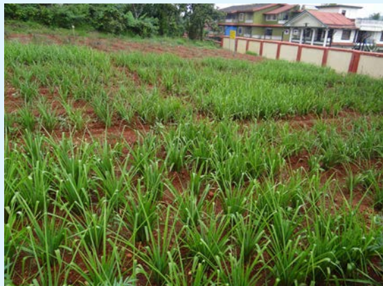
Performance of different varieties of tuberose at vegetative stage

Tuberose responds well to the application of organic and inorganic manures. Apart from FYM (20 tonnes/ha), a fertilizer dose of 100 kg N, 50 kg P 2 O 5 and 70 kg K 2 O per hectare is recommended for tuberose production. For achieving increased essential oil content in flowers and for the maximum recovery of concrete, a fertilizer dose of 80 kg N,