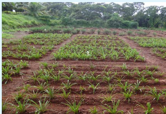
Tuberose planted at optimum spacing

Planting density markedly influences flower yield and quality. The planting distance varies with the soil and climatic conditions. Low planting density results in wastage of inputs and very high planting density leads more plant competition, thus reducing individual bulb enlargement. For economic returns, bulbs are