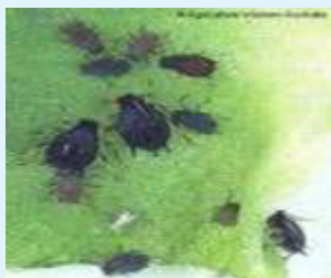
Aphids: Aphis craccivora

These are tiny insects, soft bodied, green, deep purple or black in colour. These usually occur in clusters. They are found to feed on flower buds and young leaves.