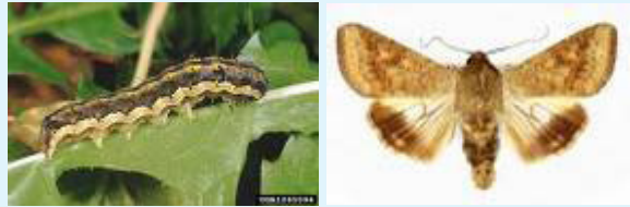
Larva and adult of bud borer

This pest mainly damages flowers. Eggs are deposited singly on growing spikes. Larvae bore into buds and flowers and feed on them making holes.