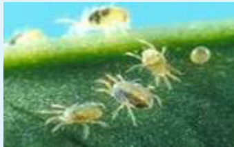
Red Spider Mites: Tetranychus urticae

Mites thrive well under hot and dry conditions, usually on the undersides of the leaves, where these make webs, if allowed to continue. These are usually red or brown in colour and multiply fast. Mites suck sap, which results in the formation of yellow stripes and streaks on the foliage. In due course of time, leaves