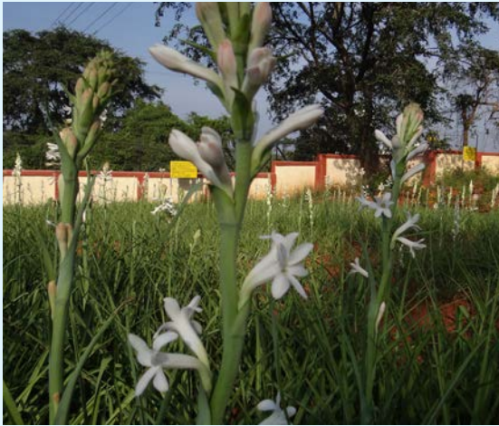
Flowers ready for harvesting in field