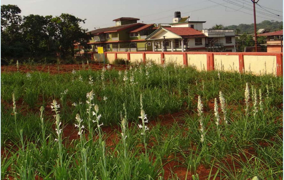
Yield of tuberose flowers observed at experimental field of ICAR (RC) for Goa