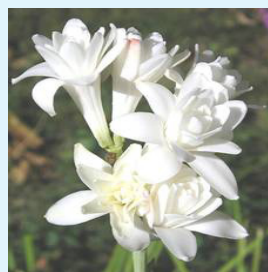
Double flowers with more than 3 rows of corolla segments

They bear flowers having more than three rows of corolla segments on straight spikes. Flower colour is white and also tinged with pinkish red. The main varieties are Pearl Double, Kalyani Double, Swarna Rekha, Hyderabad Double, Culcutta Double, Vaibhav and Suvasini.