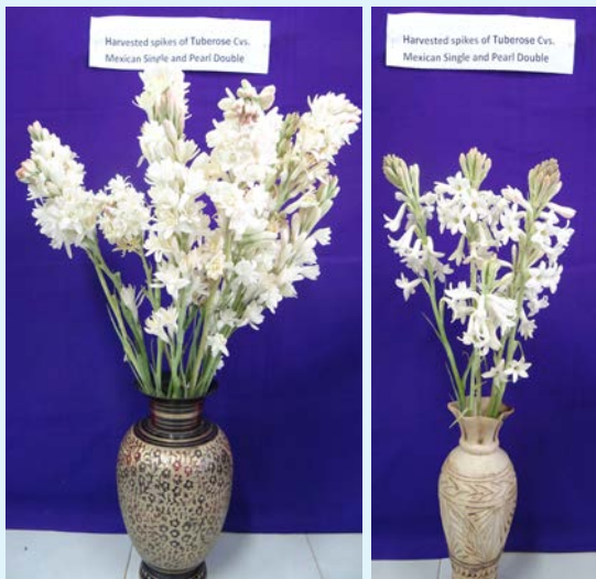
Harvested spikes of Tuberose for cut flower purpose

flowering time is July onwards. August-September is the peak period of flowering. Tuberose flowers all the year round. Depending on the purpose, harvesting is done by cutting the spikes from the base or single flowers are harvested as they open day by day. For marketing of cut flower spikes, the tuberose is harvested