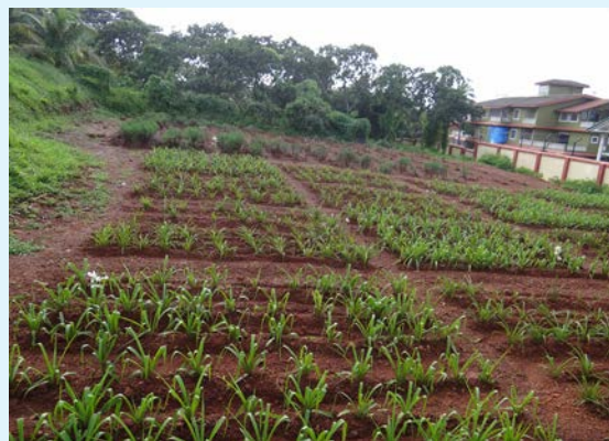
Earthing up of tuberose plot when plants are 15- 20 cm high.

Earthing - up enables the spikes to grow erect, despite strong winds and rains. Earthing up to 10-15 cm height is done when plants are 15-20 cm high. The flower-spikes should be supported by stakes after about 2 1/2 months of planting. Staking with bamboo or wooden sticks is done in beds and string or rope may be tied in three rows along the plant-rows to avoid lodging of plants.