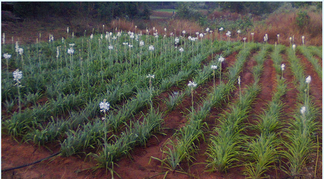
Yield of tuberose flowers observed at farmers field