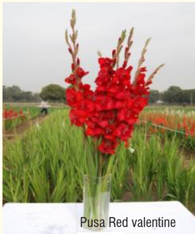
Pusa Red valentine