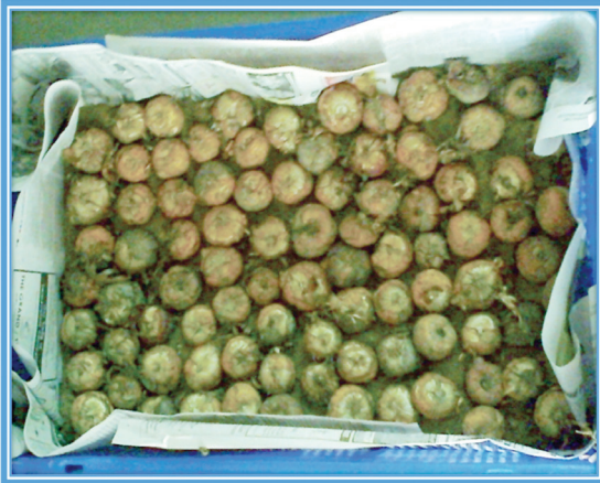
Storage of corms in perforated plastic trays

After harvesting of flowers or spikes, plants are twisted down to ground level for allowing the corms to mature. Once the spikes are cut out, the leaves begin to turn yellow. Plenty