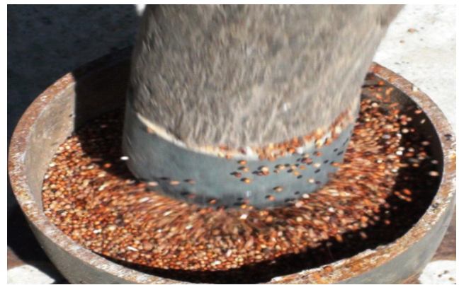
Fig 1. Processing of Finger Millet with traditional method