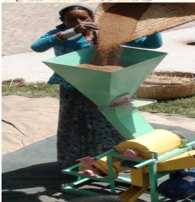
Fig. 2. Processing of Finger Millet with Millet Thresher

mechanize the processing of small millets, the machine works well with > 98% threshing efficiency and > 90% pearling efficiency. The machine has threshing capacity of 60-80 Kg and pearling capacity of 80-100 Kg grains of finger millet in one hour. The machine has similar threshing capacity for barnyard millet with dehusking capacity of 2.5-4.0 Kg grains per hour (Anonymous, 2012). Two models of these machines, electric thresher and engine operated thresher are available. These machines significantly reduce the work load and time for post harvest processing of small millets. This thresher