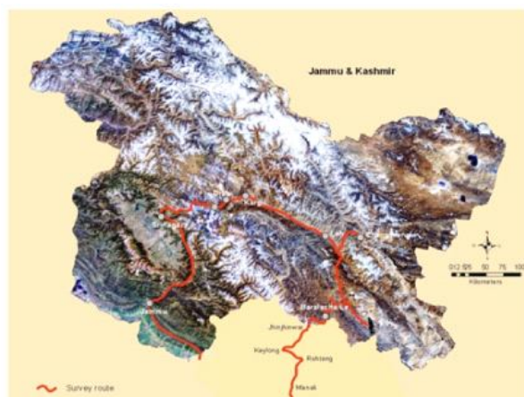
Fig 1. Field survey route, J&K, India

Several pastoralist groups located along the field trips routes were randomly selected and interviewed. Total 120 informants (including farmers, shepherds, house wives, herdsmen and herbalists) aged between 18-75 years familiar with grassland issues participated in the study (Table 1). Data were collected through interviews, focus group discussions, participant observation and by administering questionnaires. Structured, semi-structured interviews, guided questionnaires and direct observations were used to collect the data following the standard ethno botanical investigations (Jain, 1995; Martin, 1995). The voucher specimens of plants were collected and identified either in the field itself or with the help of various flora besides, local literature (Dhar and Kachroo, 1983; Kaul, 1997; Dar et al. , 2002; Wani et al. , 2006, Dad and Khan, 2011) was consulted to reveal more details about the identified plants.