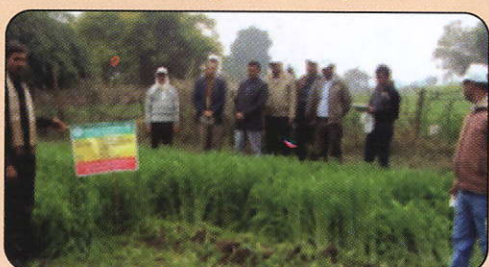
Fodder crop demonstration