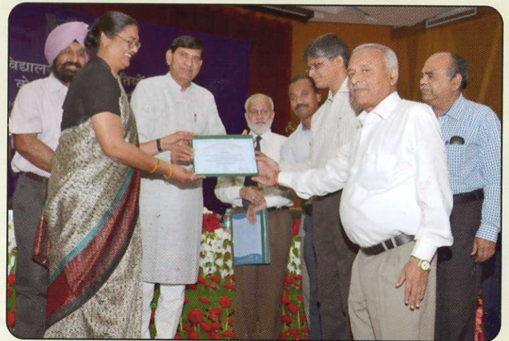
KVK Dantewara received Zonal Best KVK Award for the year 2013-14