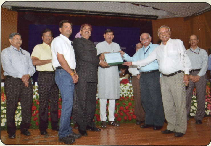
KVK Jhabua received National Best KVK Award for the year 2013-14