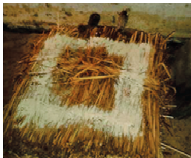
Preparation of straw mushroom bed Application of supplement