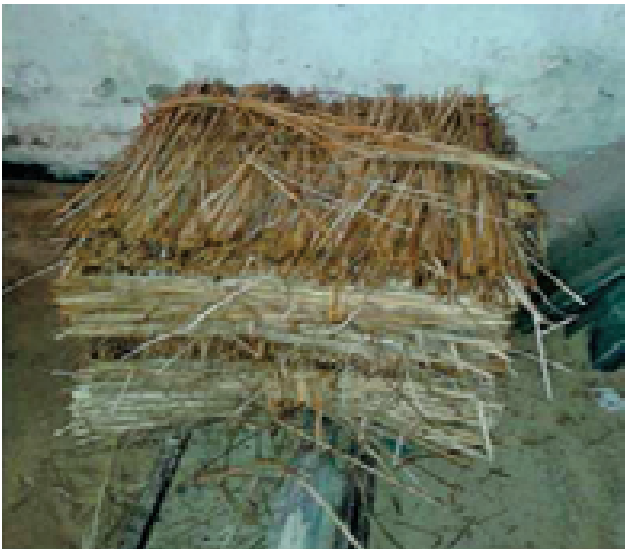
Straw mushroom bed