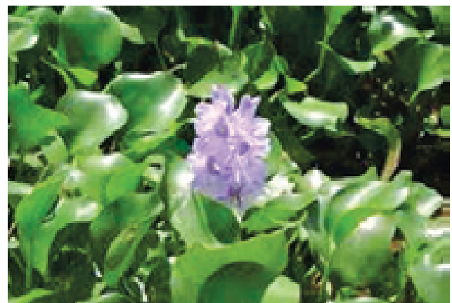
Alternate substrates for straw mushroom Water hyacinth