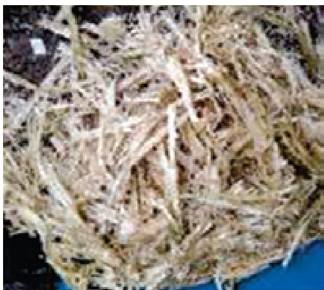
Alternate substrates for straw mushroom Sugarcane baggage