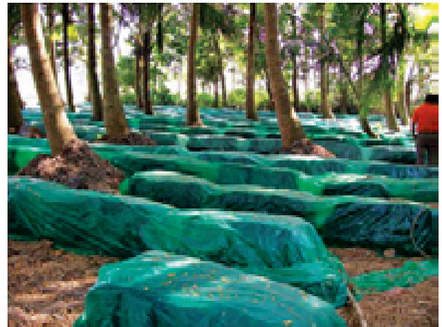
Straw mushroom beds in coconut orchard