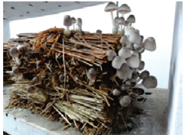
Straw mushroom bed in fruiting stage