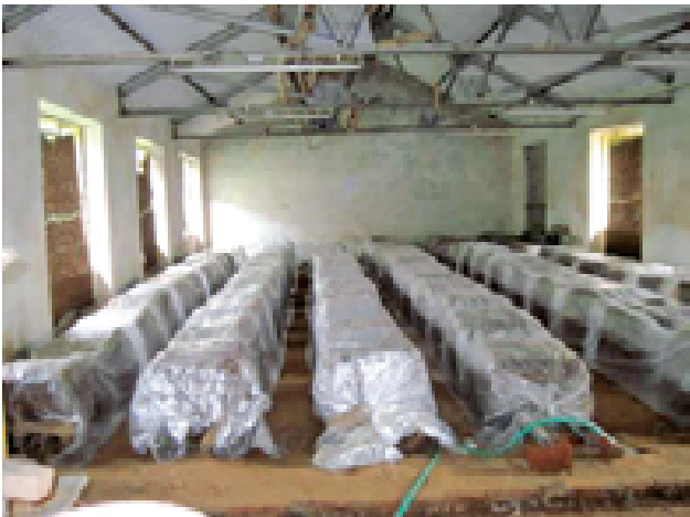
Straw mushroom beds in shed