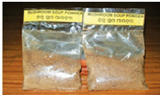
Value added product Mushroom soup powder