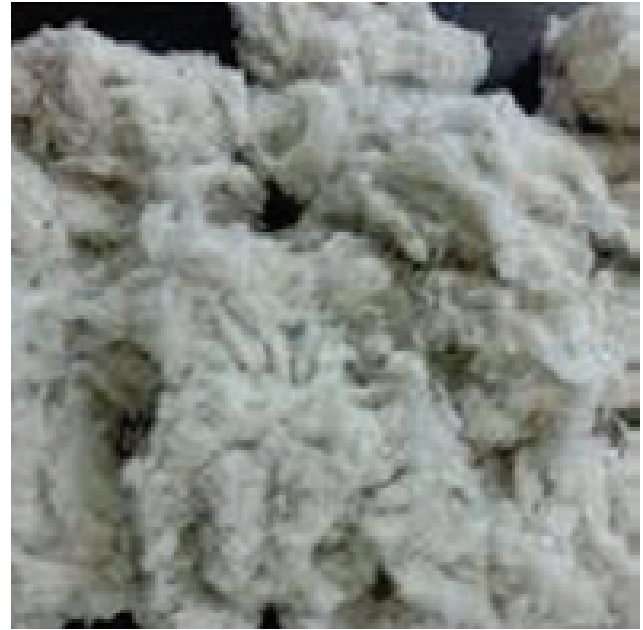
Alternate substrates for straw mushroom Cotton mill waste