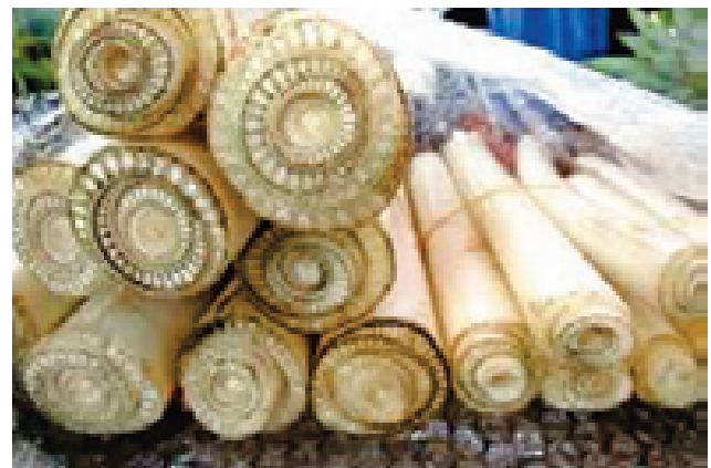
Alternate substrates for straw mushroom Banana pseudostem