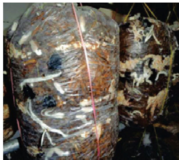
Coprinus infected bags

It produces dark blue to violet coloured buds with a long white thin stalk, with opens in a few