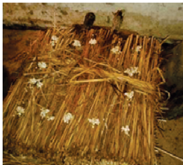
Preparation of straw mushroom bed Spawning of straw mushroom