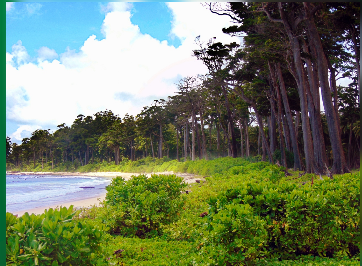
(Natural defence against the sea surges and tsunami) 2015