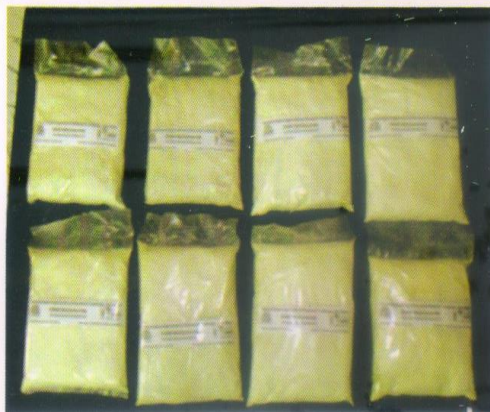
CIARI Bio Consortia

Therefore, for the successful management of plant diseases, common methodology should be followed as prophylactic measures before the onset of disease. The biological control is one such method where the plant diseases are controlled by using native useful living microbes. CIARI- Bioconsortia is a talc based formulation which is very effective for management of major plant diseases in both field and protected cultivated conditions.