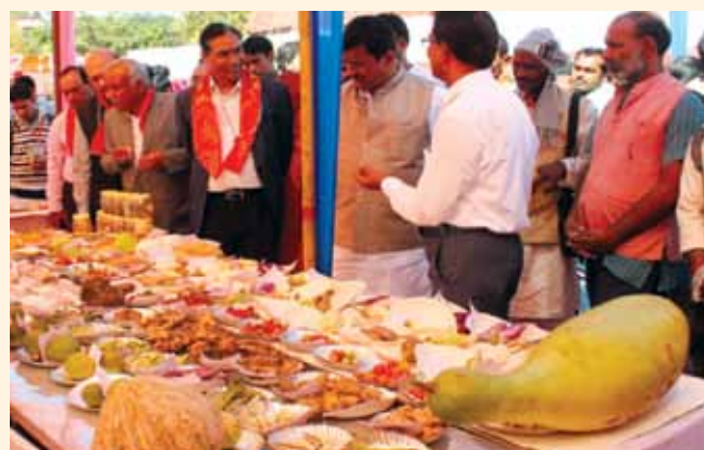
Secretary DARE & DG, ICAR visiting the Exhibition stalls