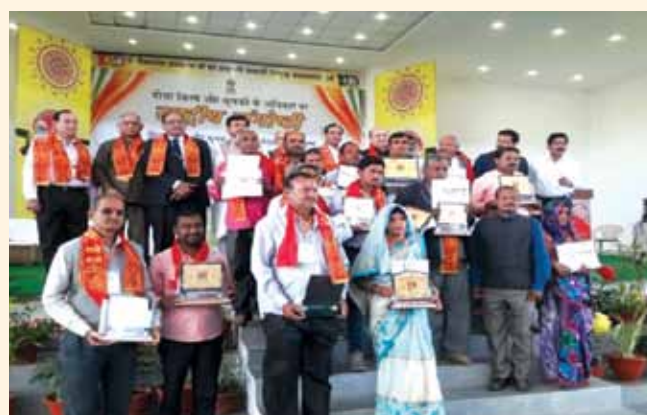
Awardee Farmers with Chief Guest and Dignitaries