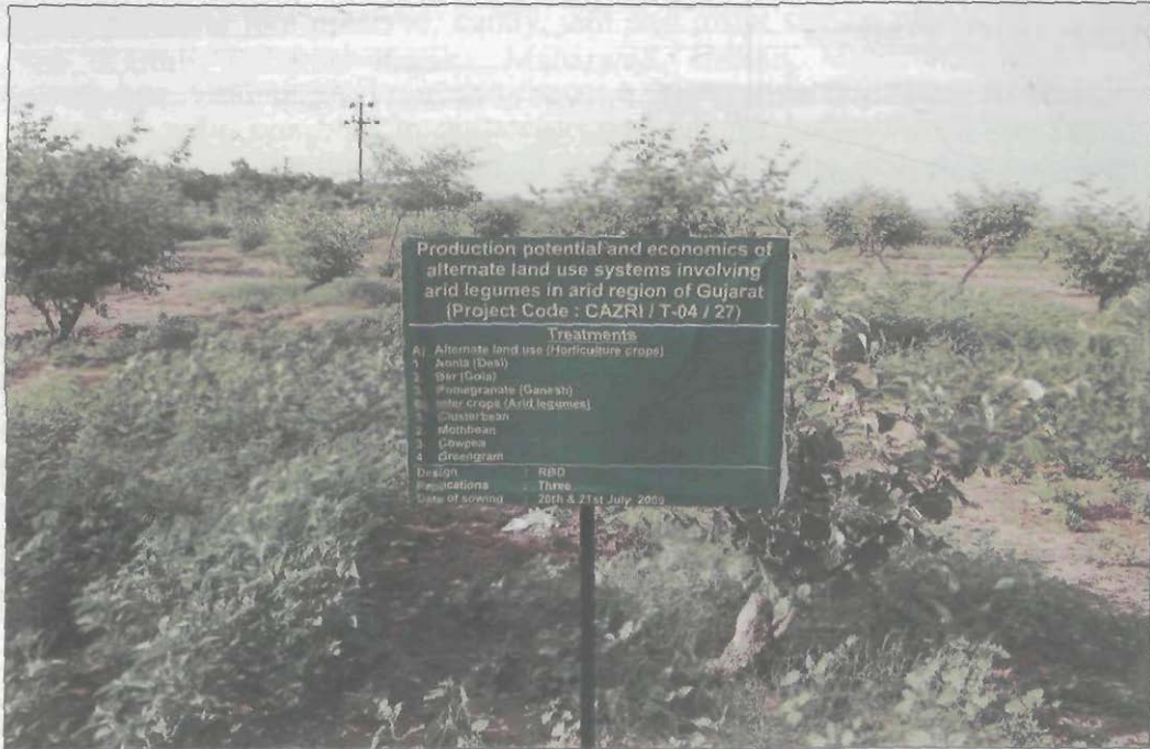
Fig. 9. Alternate land use system involving combination of ber with arid legumes