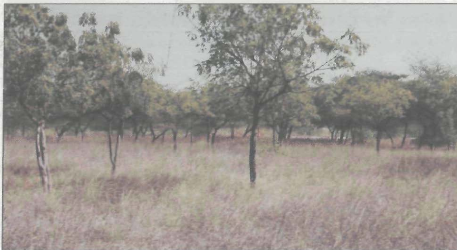
Fig. 14. Silvopastoral system involving Cenchrus ciliaris with Neem