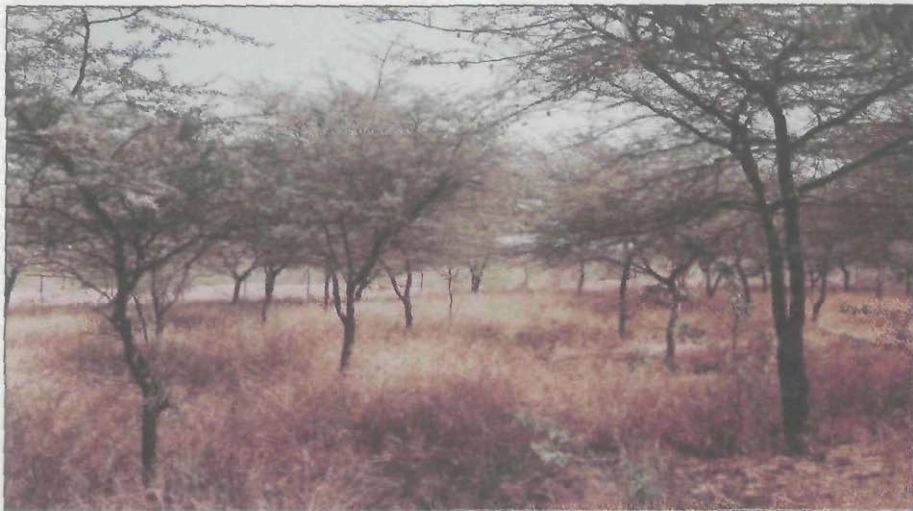
Fig. 13. Silvopastoral system involving Cenchrus ciliaris with Acacia tortilis