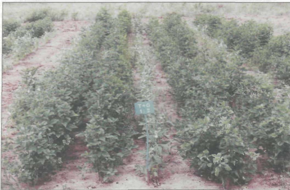
Fig. 4. Intercropping of clusterbean with sesame

The studies on intercropping of sesame + clusterbean (Figure 4) indicated that grain yield under intercropping system reduced by 28.8% in clusterbean and 40.4% in sesame as compared to their sole treatments. However, considering the net returns and BCR, intercropping of sesame with clusterbean (1:2) gave the maximum net returns of Rs 7,440/ha along with BCR of 1.80 compared with Rs 5,945/ha and BCR of 1.68 in sole clusterbean and Rs 2,851/ha and BCR of 1.37 in sole sesame. The Sustainable Yield Index (0.74) and Sustainable Value Index (0.76) were also higher in intercropping of sesame+ clusterbean (1:2) than that recorded by Sole sesame (0.73 and 0.73) and sole clusterbean (0.71 and 0.72). From the studies at RRS, Kukma it is concluded that intercropping involving clusterbean and sesame was more profitable and sustainable than their sole cropping (Meena et al , 2008).