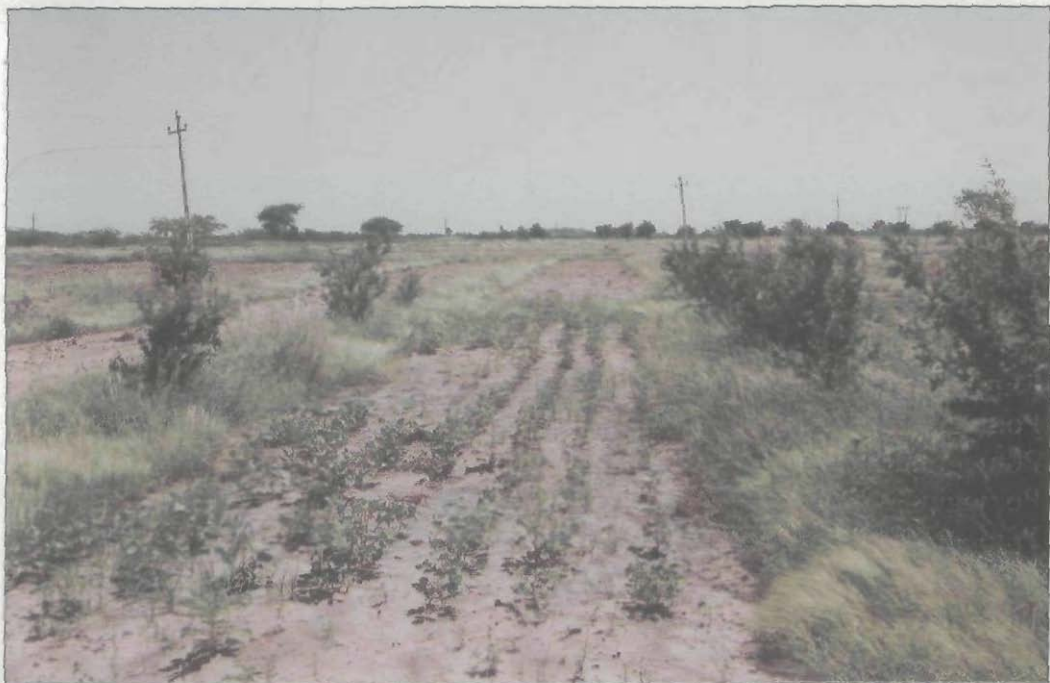
Fig. 10. Alternate land use system involving combination of pomegranate with arid legumes