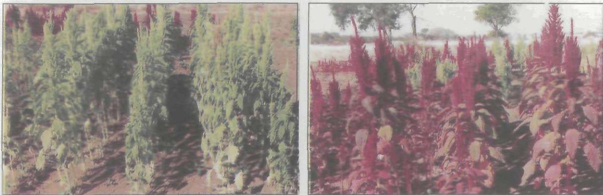
Fig. 5. Amaranth variety GA- 1 and GA-2

The feasibility studies were conducted for amaranth cultivation in Kachchh, which was not a practice of the region due to want of irrigation. The varietal trial showed that variety GA-2 gave 19.3 % more seed yield than GA-1 (Figure 5). The studies revealed that application of nitrogen @ 90 kg ha -1 and irrigation of 200 mm water at four growth stages in equal quantity produced 8382 kg ha -1 dry biomass and 1206 kg ha -1 grain yield for the variety GA-2. A net economic return of Rs 20,000 were obtained and the study indicated that, cultivation of amaranths in Kachchh has a commercial viability and will be helpful for meeting the protein requirement in the diet (Vyas, 2007; Anonymous, 2009).