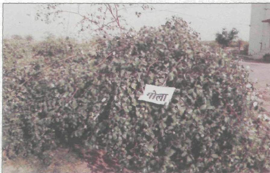
Fig. 8. Performance of Gola variety of Ber at Bhuj

Growing of Gola and Seb cultivars of ber under the spacing of 6 x 6m with other recommended practices for the region will be beneficial to the farmers. The doses of manures and fertilizers should be applied as per the age of the plant (Figure 8).