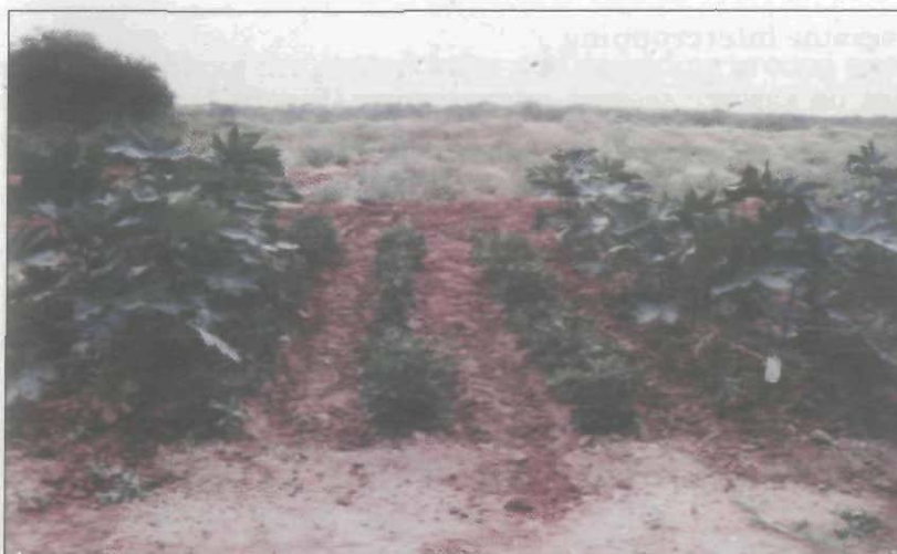
Fig. 3. Intercropping of castor with groundnut

The studies on intercropping castor with groundnut (Figure 3) revealed that sole crops of castor and groundnut produced an average yield of 570 and 150 kg ha -1 , respectively. The pod yield of groundnut reduced significantly due to deficient rainfall particularly during the reproductive stage (in September only 6.3 mm rainfall). The grain yield under intercropping was found to be reduced by 31.9% in castor and 16.6% in groundnut as compared to their sole crop treatments. However, considering the economics of the system, intercropping of castor + groundnut (1:3) gave gross return of Rs 11, 566/ha which was higher by Rs 1451/ha over the sole castor and by Rs 8,026/ha over the sole groundnut (Devi Dayal et al. , 2009).