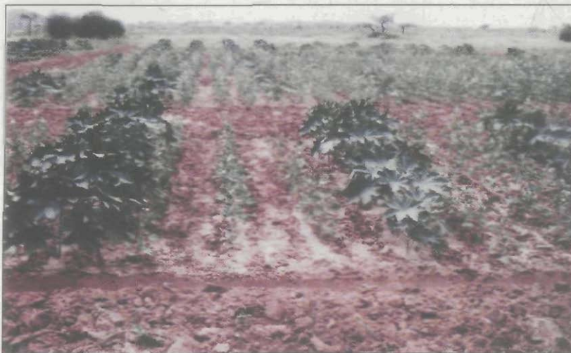
Fig. 2. Intercropping of castor with sesame