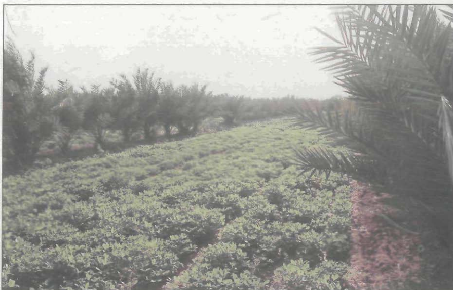
Fig. 7. Intercropping of groundnut with date palm in the initial stages of plantation establishment

The local varieties are Yakubi, Ganshyam, Neelkanth and Harikrishna. The imported off shoots varieties which are use in the region are Barhee, Halawy, Khadrawy, Zahidi, Hayani, Bint Aisa, Medjool and Ameri. The varieties introduced to the region through tissue culture are Khunaizi, Medjool, Zagloul, Khasab, Ford and Khalas. The propagation is by seeds, offshoots or tissue culture. In the initial stages of establishing new plantations, intercrops like groundnut, cucurbits, etc can provide profitable income (Figure 7). Harvesting starts from 15 th July onwards and continues up to end of August. Date palm starts yielding at 4-5 years age (10-20 kg/plant) and economic production starts after 8-10 years (100-120 kg/plant) and the trees remain productive for a very long period. Trees of even 40 year age have been seen bearing heavily.