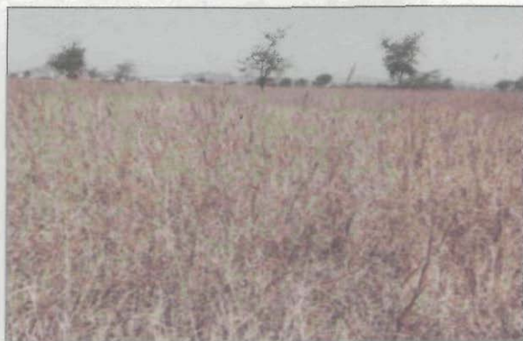
Fig. 12. A field view of Cenchrus setigerus