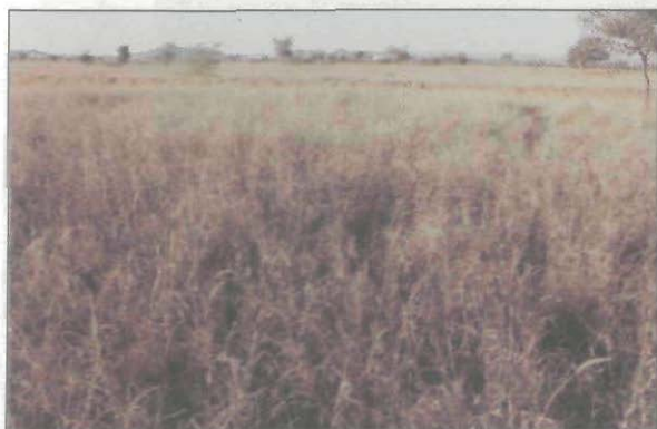
Fig. 11. A field view of Cenchrus ciliaris

The evaluation of thirty-six germplasms of prominent grasses viz. Cenchrus setigerus (24), Dichanthium annulatum (6) and Sporobolus marginatus (6) collected from different parts of Kachchh region during kharif 2004, showed that genotype BH/CS-5 of Cenchrus setigerus and BH/DA-3 of Dichanthium annulatum performed better in respect of plant height, number of tillers per plant and tussock diameter. Maximum dry fodder yield was produced by Lasiurus indicus (6,153 kg) followed by Cenchrus ciliaris (1,360 kg) and Cenchrus setigerus (1,188 kg) in a hectare of land (Annual report, RRS, Bhuj, 1998-99).