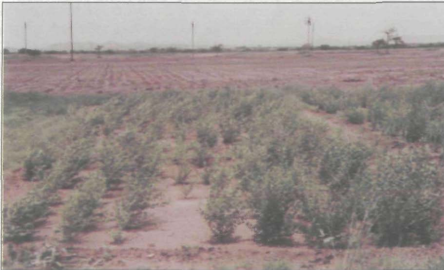
Figure. 6. A field view of Henna crop

Mehandi " Lawsonia inermis L.", a bushy, glabrous, much branched shrub is often cultivated as hedge plant (Figure 6). The leaves of the plant contain dye "lawsone". The dye is used in colouring palms of hands, sole, nails and hair etc. It is utilized in printing of value – added textile product and dyeing of leather. Plant is also used as a prophylactic agent against skin diseases in the Indian system of medicine. Flower and seeds yield essential oils and fatty acids, respectively. The crop produce is in high demand in export market which fetches considerable foreign exchange in national exchequer. This is being extensively used as a cash crop for arid wastelands of Rajasthan. Looking to the importance of the crop, its suitability as a crop for arid Gujarat was studied and agro techniques were developed.