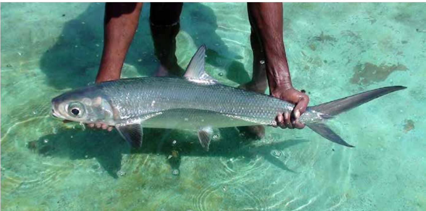
Milkfish in Broodstock tank of MES hatchery (Tamil Nadu)