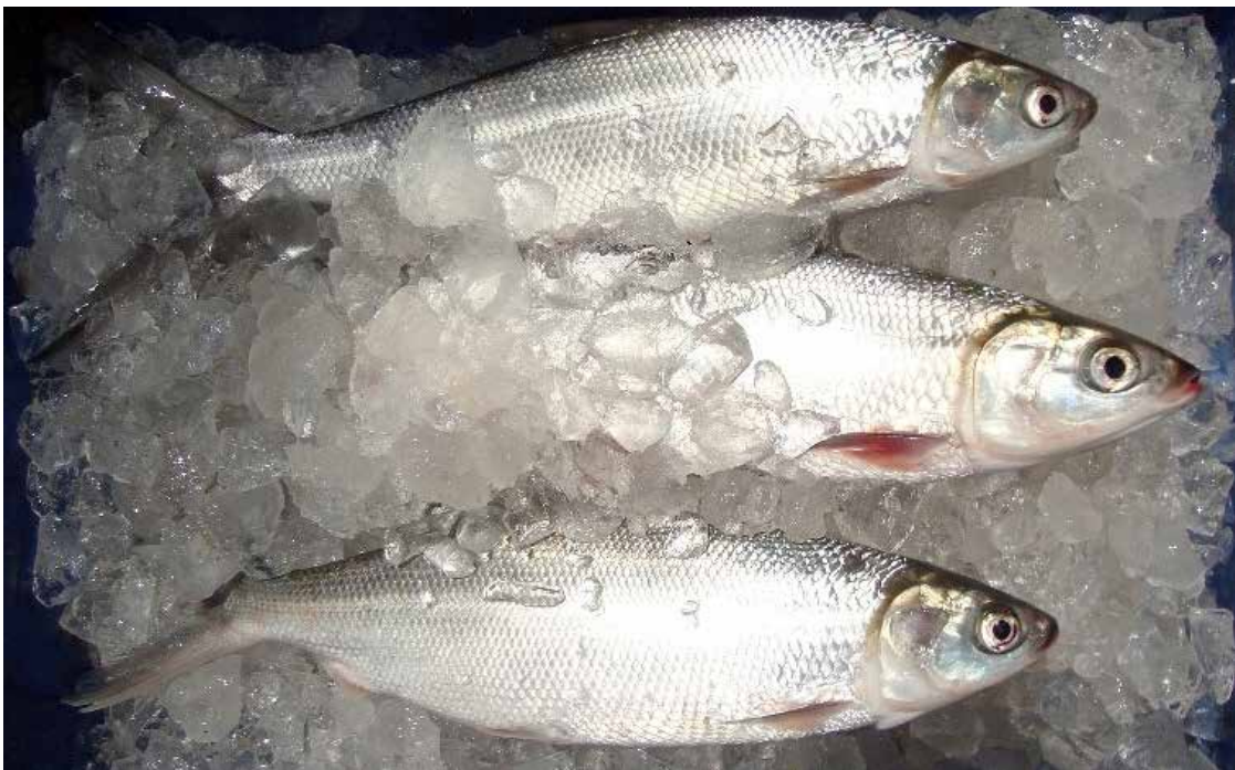
Harvested Milkfish in Fish market

Major producer and consumer of Milkfish is the Philippines, which consumes Milkfish mostly in fresh form and a small amount is processed for canned products. Milkfish can be harvested and marketed at the body size of 20 - 40 cm (body weight 200-500 g). Uniformly grown Milkfish having a body weight of more than 200 g are partially harvested from grow-out facilities using dragnets or gillnets. In complete harvesting, all fishes of one crop period are harvested from different grow-out facilities by using different methods like complete draining in the pond by gravity or by pumps, hauling of net-cage structure and use of seines or gill nets