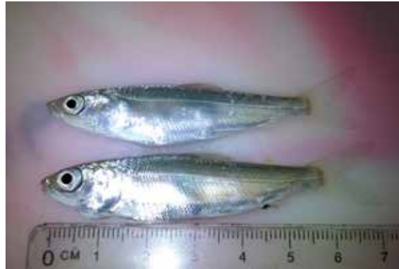
Milkfish fingerlings from nursery ponds, MES (TamilNadu)