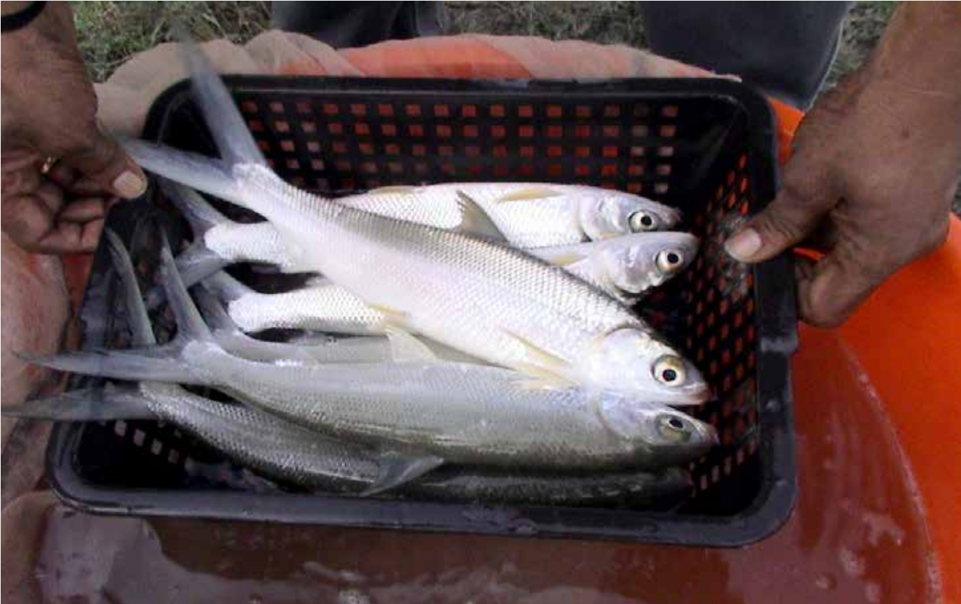
Milkfish harvested from growout pond, KRC (West Bengal)