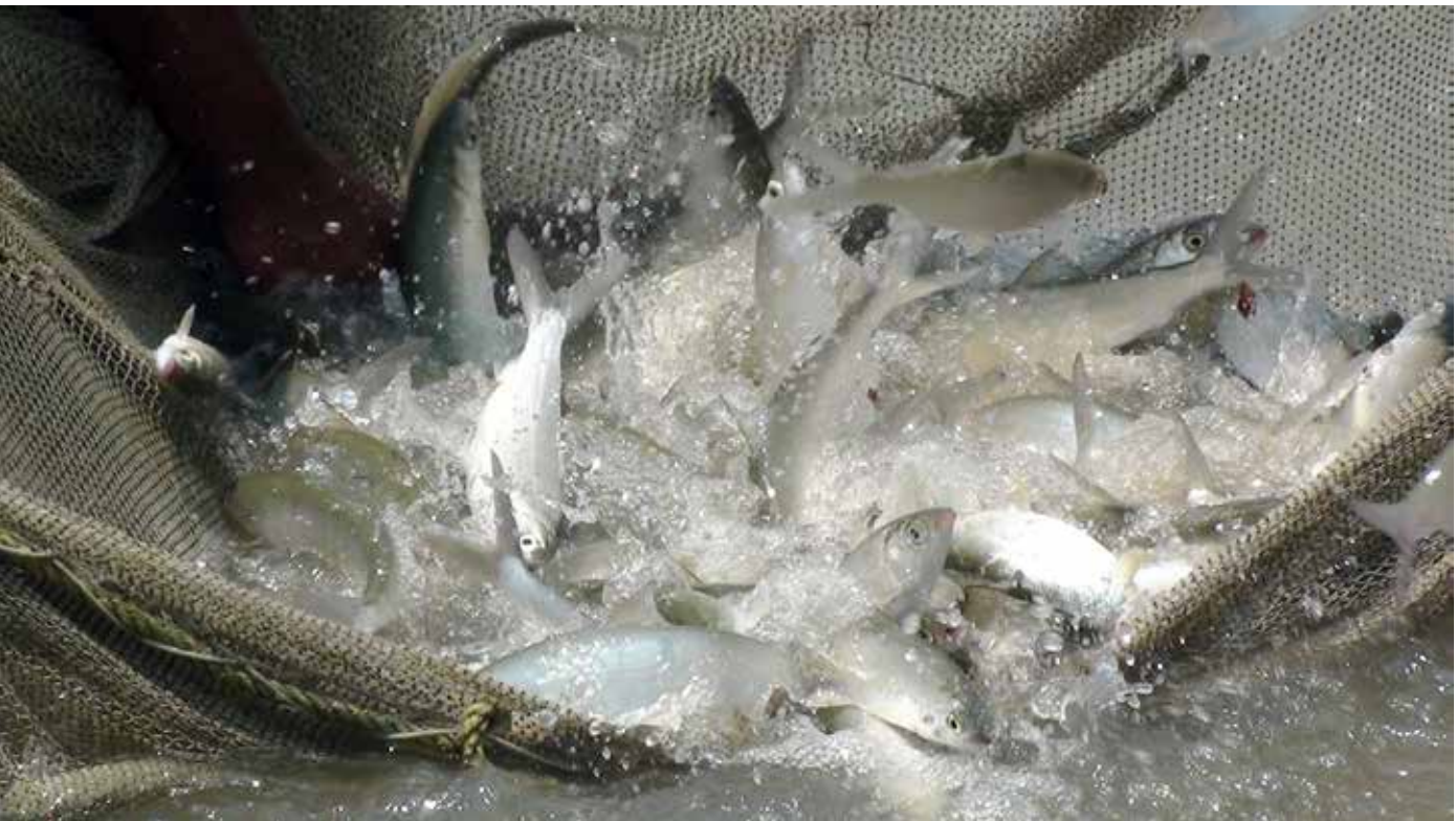
Stunted Milkfish juveniles in transition pond, KRC (West Bengal)

Abundant seasonal fry occurrence in nature or high juveniles produced in hatcheries can be reserved with stunting methods to stock later in grow-out ponds. Milkfish fry can be stunted from few months to a year in transition ponds for a year-round supply of fingerlings for stocking into rearing ponds. Stunted fry/fingerling shows similar growth pattern in culture pond compared to non-stunted fry/fingerling.