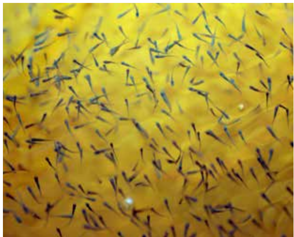
Milkfish Early fry at MES hatchery

Adults Milkfish spawns at sea though larvae migrate to their nursery grounds in lagoons, mangroves, and swamps in coasts where they grow and subsequently sub-adults return to the sea. World wide, Milkfish seeds are collected abundantly from coastal areas in Indo-pacific region since time long past for farming which has led to declining the fry availability in nature subsequently. In 1970's Philippines developed hatchery technology for seed production of Milkfish which has given an impetus to its farming.