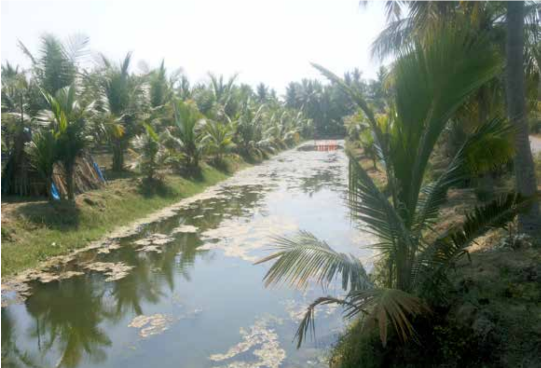
Milkfish Nursery pond (Andhra Pradesh)