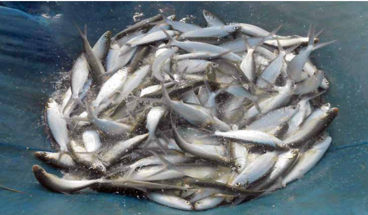
Milkfish harvest, KRC (West Bengal)

Euryhaline fishes possess the virtue of thriving in different saline zones which gives scope for sustainable diversification for 21 st -century Aquaculture. Milkfish ( Chanos chanos ) is an herbivore euryhaline fish and cost of farm production is 90 – 100 /kg. A survey conducted by ICAR-Central Institute of Brackishwater Aquaculture, Chennai in different markets of the