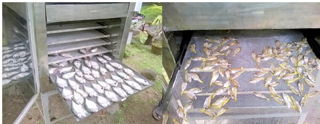
a. Fig.2 CIFT Solar-Electric Dryer