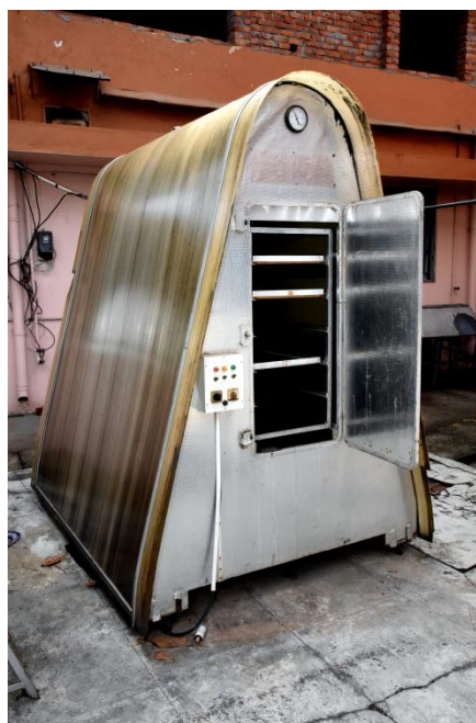
Fig.4 CIFT Solar-Tunnel Dryer