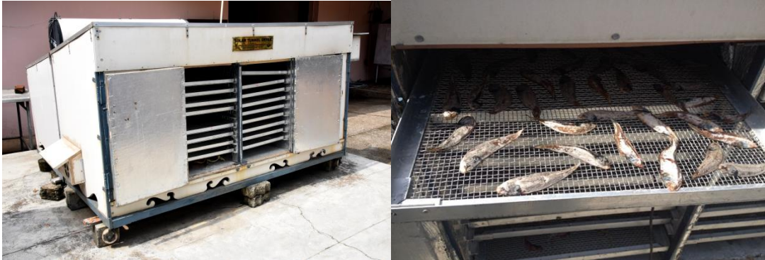
Fig.5. CIFT Solar-Cabinet Dryer with Electrical back-up

Electrical back up comes into role once the desired temperature is not attained for the drying process, particularly during rainy or cloudy days.