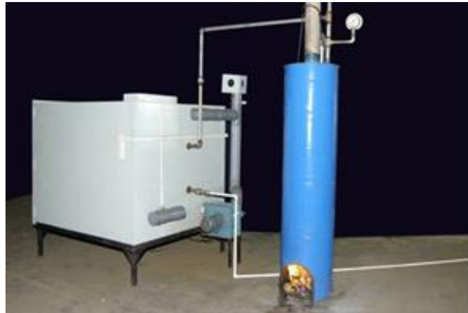
Fig.3 CIFT Solar-Biomass Dryer