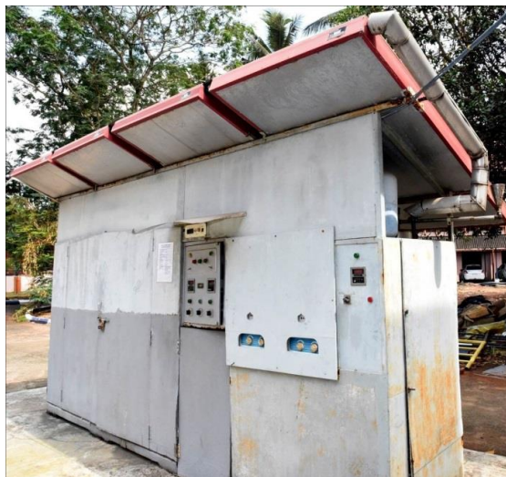
Fig.1. CIFT Solar-LPG Dryer

This dryer is ideal for drying of fish, fruits, vegetables, spices and agro products without changing its colour and flavour. It helps to dry the products faster than open drying in the sun, by keeping the physico-chemical qualities like colour, taste and aroma of the dried food intact and with higher conservation of nutritional value. Programmable logical Controller (PLC) system can be incorporated for automatic control of temperature, humidity and drying time. Solar drying reduces fuel consumption and can have a significant impact in energy conservation.