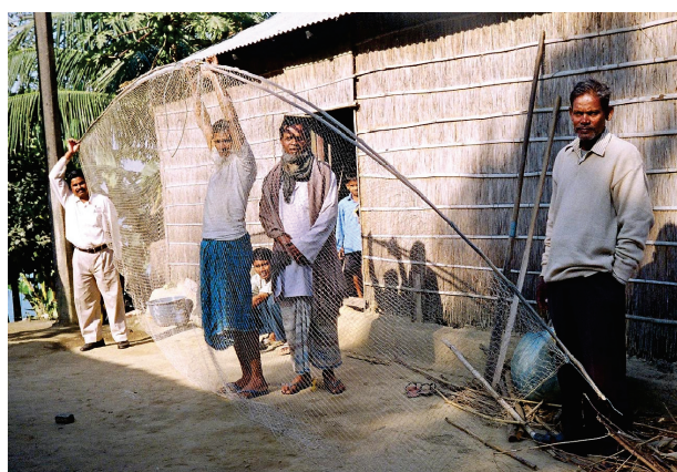
Fig. 2. A clap net in closed position

purse nets in some places due to their appearance as a purse shape bag net hung from the bamboo splinters. The bag net has a mesh size of 22-70 mm and is made of hemp, cotton or polyamide multifilament webbing (210Dx1x3) with a hanging coefficient of 0.5-0.6. The net has a depth of 1.5-1.75 m (3.0-3.5 m for the total round). The frame is kept open (Fig. 2 and 3) by a piece of brick or stone weighing 1.5-4.0 kg fastened at the center of the lower bamboo split. There is a feeler cord fixed to the upper portion of the net to transmit the disturbance created by the fish while entering the net (Fig. 4). The feeler cord is held in the left hand and the haul rope in the right hand of the fisherman. The stout haul rope is paved out to the desired depth so that the net remains suspended at about the subsurface or mid water region where hilsa are predicted in appreciable numbers. This closing or haul rope passes through a ring or “Y” shaped piece of wood in the upper lip and attached to the lower lip of the frame in the mid part immediately above the weight. The length of the rope that can pass through this ring is limited by fixing a knot or seizing along the length of closing rope just above the limit of upper arc.