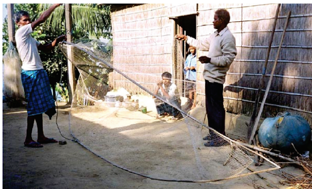
Fig. 3. A clap net in open position

the fish to escape, the closing or pursing mechanism is very well developed and the action is quickly been taken in these nets. The net is usually operated from the fore end of one boat at a time and when two nets are operated from the same boat, the second net is paved from the aft as well. The gear is selective for catching Tenualosa ilisha , however other fishes entering the net are also caught. The fish hilsa, being migratory in nature ascends the river and get trapped in the net that drifts down in the opposite direction. Once the desired distance is traversed downstream, the boat is rowed back towards its origin point and the caught fishes are harvested. The process is repeated several times in the day. The catch is often alive and of high quality. The average catch per unit effort (CPUE) of clap nets was recorded as 2.82-7.20 \pm 1.36 kg/ hour/gear during the fishing season. The gear is operated for 3-4 h in a day. The price fetched from hilsa ranges from Rs. 300-1000 kg -1 as this fish is highly relished in Assam. Clap nets are inexpensive (Rs. 500/gear) due to low fabrication and maintenance cost. The gear has a life span of 5-6 years and less labour intensive.