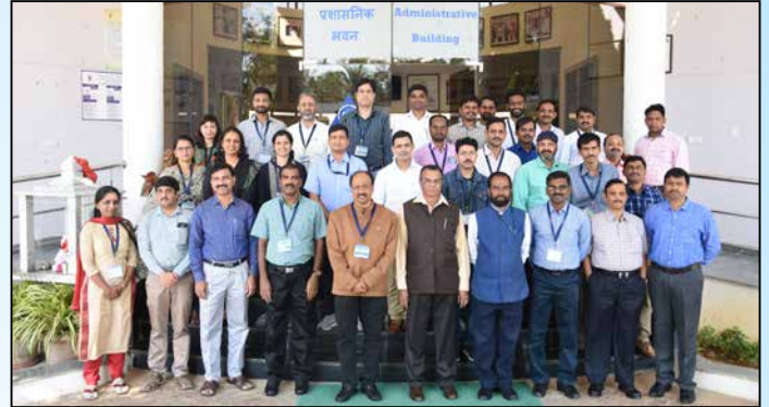
ICAR-NIVEDI organized ICAR short course on 'An update of molecular and advanced approaches for the diagnosis of parasitic diseases in animals' during 2-11 th January, 2019.