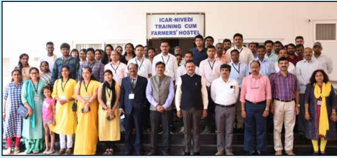
ICAR-NIVEDI organized "Field Veterinary Epidemiology" training to the Veterinarians from Chhattisgarh state sponsored by Livestock Development Department, Government of Chhattisgarh held during 11-15 th February and 12-16 th March, 2019.