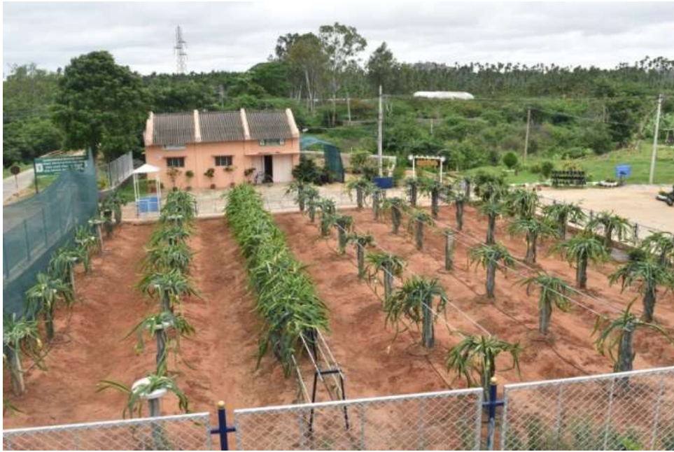
Figure 1. Field view dragon fruit established with trellis system

Many trellis designs are used in India. The IIHR Bengaluru, India evaluated four different trellis system of Single pole with cement and iron ring, continuous pyramid stands and 'T' stands with two different cultivars. For our analysis, each trellis consisted of one 6 feet height by 5 or 6 inch thickness of poles erected 2 feet depth. Single pole system showed better performance in growth and yield when comparatively other trellis system. Single pole with ring type of trellis that can support the weight of the plants and allow easy access to flower and fruit will work for commercial production (Fig.2.). The wooden poles are hard but their durability is least compare to cement poles. It is not possible to change the poles in between because of the growth and entangled branches. Therefore it is better to go with concrete poles its cost may be high for cement pole but they are durable and can be used