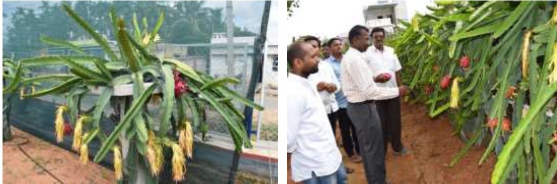
Figure 3. Dragon fruit flowering and fruiting

The flowers starts with on small spiral button type attract structures at the stem margins. These develop to flower buds in 10-15 days. The beautiful hermaphrodite nature flowers length (25-30cm), white inside and greenish yellow with purple dyes on the outside (Fig.3.) They are scented and only blooming at night and last one only night. Flower production generally takes place during May - August and fruit harvest 30-40 days after fruits set. Quality of the fruit does vary between varieties, but harvest time has a much greater effect on quality than varietal differences. There are self-compatible and self-incompatible varieties. There is considerable variation in fruit size and shape between the varieties. At present, very little knowledge available on varietal and production aspects ((Karunakaran and M. Arivalagan,2019).