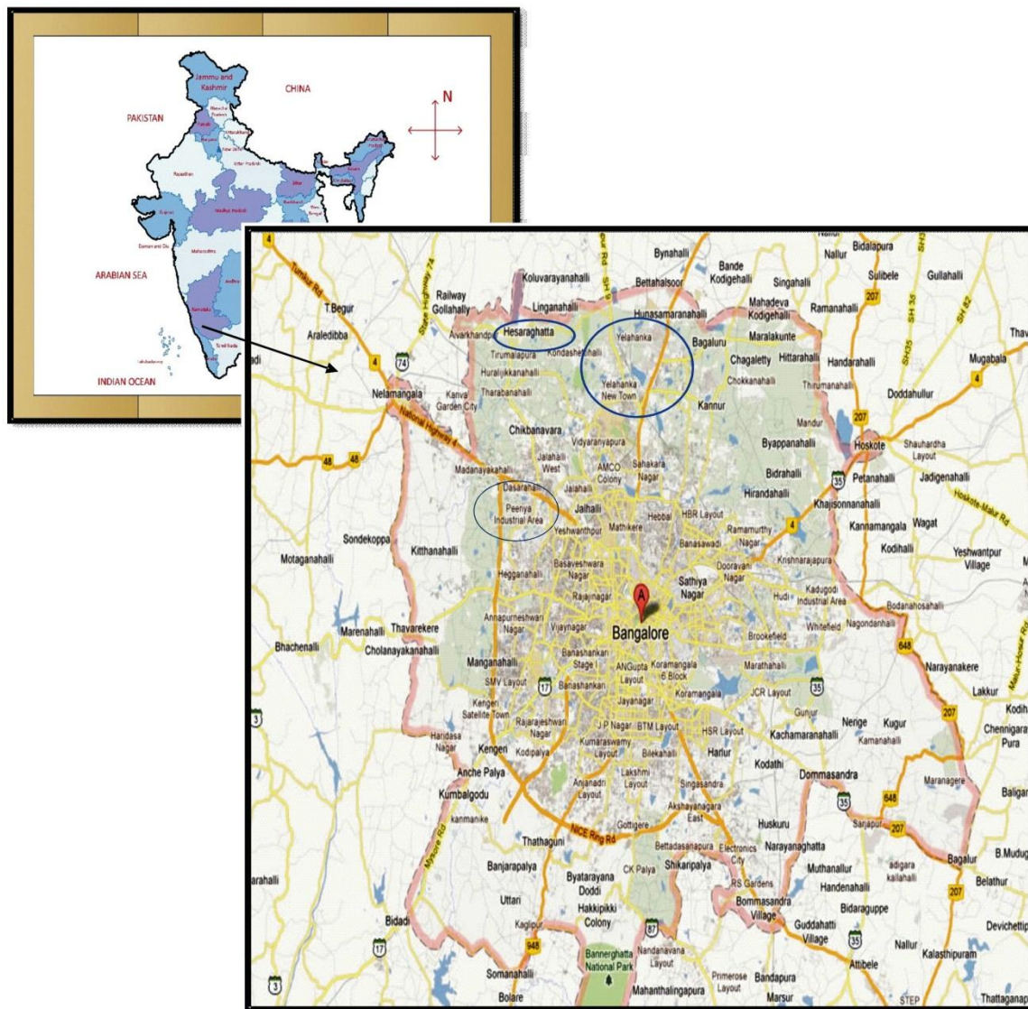
Plate 1: Map of Bengaluru