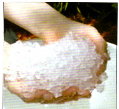
Hydrogel granules soaked with water

Hydrogels are characterized by negative (anionic), positive (cationic) or neutral charge. These charge classes are found in both linear and cross-linked polyacrylamide hydrogels. The charge determines how they will react with soils and solutes. Briefly, clay components of soils have a negative charge; heavy metals have a positive charge, and other commonly found minerals in soils and water