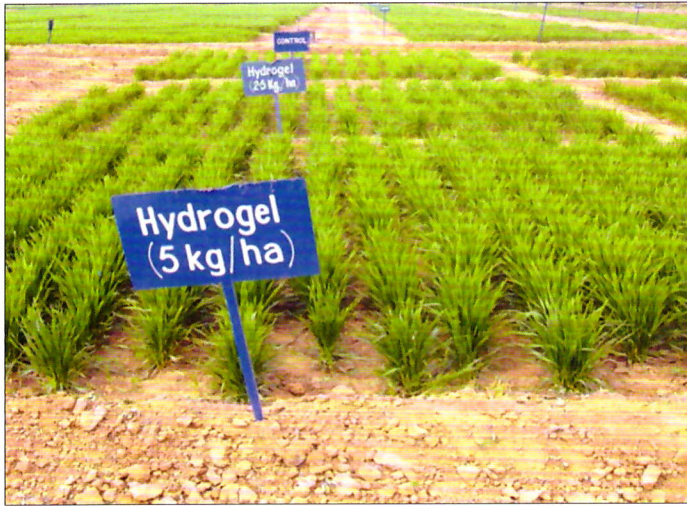
Hydrogel applied in a wheat field (application rate 5 kg/ha, mixed with 1 kg of dry sand and applied in rows at 5-7 cm soil depth along with seeds by using a manually drawn seed drill)