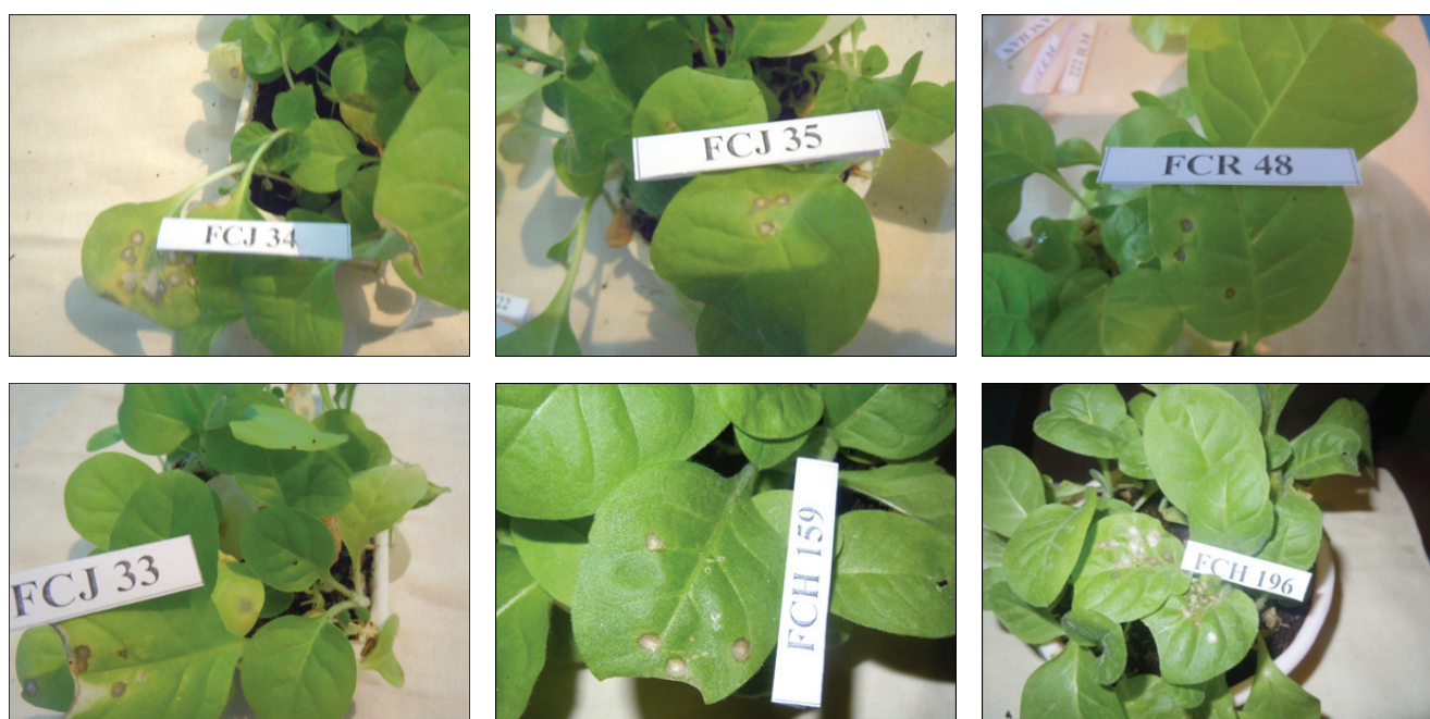
Fig. 1: Hypersensitive reaction of some of the germplasm lines for TMV infection

Screening of 272 germplasm lines for TMV resistance through artificial screening was carried out in order to identify potential resistance donors. Among the entries evaluated, twenty two lines viz. , FCH 162, FCH 165, FCH 196, COR 14, Bell no.110, SL 21, FCR 41, FCR 42, FCR 43, FCR 44, FCR 47, FCR 48 FCR 49, FCR 50, FCK 7, FCJ 33, FCJ 34, FCJ 35 and FCJ 37 exhibited hypersensitive reaction (Fig. 1) indicating their resistance to TMV. Among these resistant lines, thirteen lines (FCR