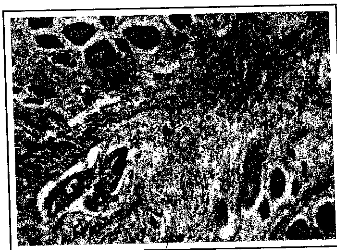
Fig 2. Histological section of the muscles showing spindle shaped neoplastic cells with long or oblong nuclei. Fibrous tissue septa divided the muscle bundles into lobules with well formed blood vessels (arrows). 40 x, H&E.