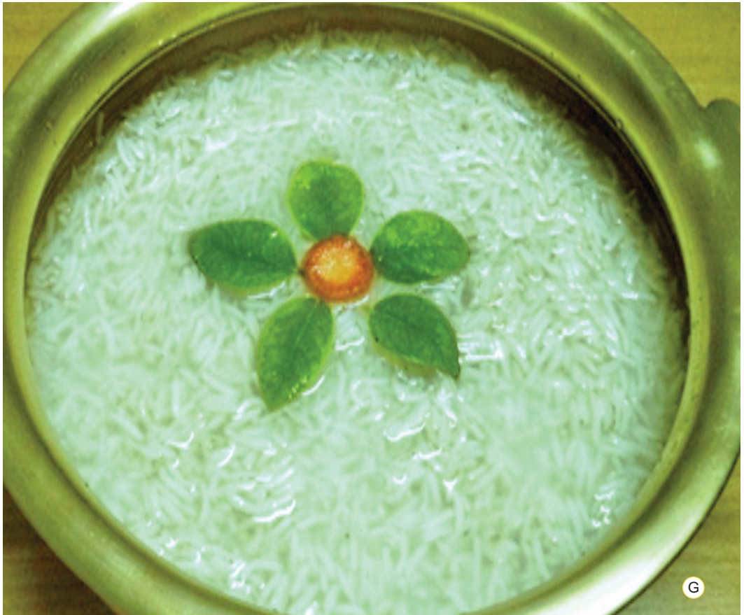
Fig.1. Different products from rice.

Note: A, Brown rice; B, Raw polished rice; C, Cooked rice; D, Popped rice; E, Puffed rice; F, Flaked rice; G, Fermented rice.