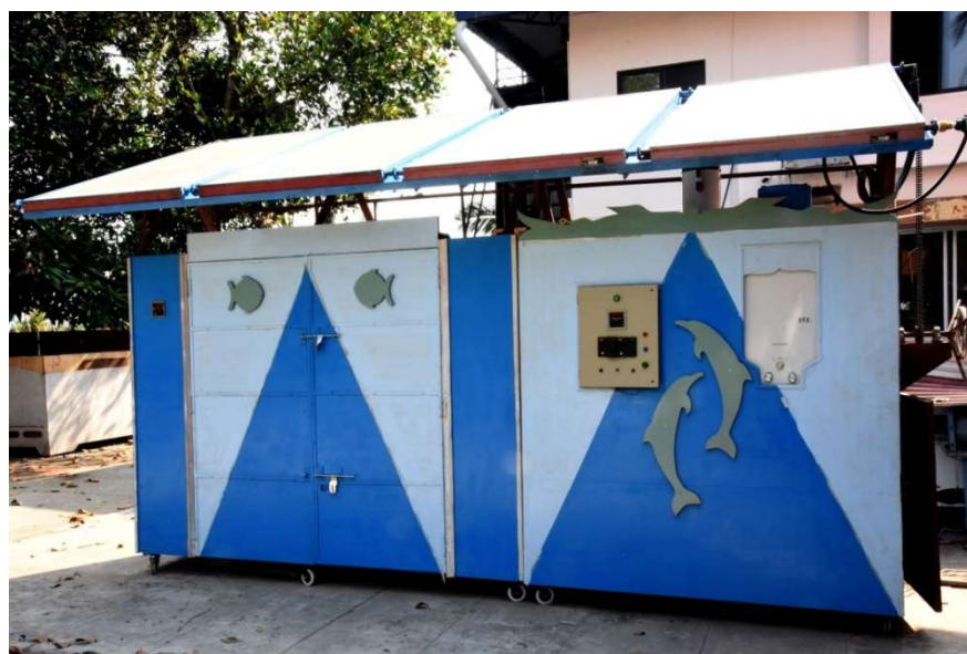
Fig.1. CIFT Solar-LPG Dryer

This dryer is ideal for drying of fish, fruits, vegetables, spices and agro products without changing its colour and flavour. It helps to dry the products faster than open drying in the sun, by keeping the physico-chemical qualities like colour, taste and aroma of the dried food intact and with higher conservation of nutritional value. Programmable logic Controller (PLC) system can be incorporated for automatic control of temperature, humidity and drying time. Solar drying reduces fuel consumption and can have a significant impact on energy conservation.