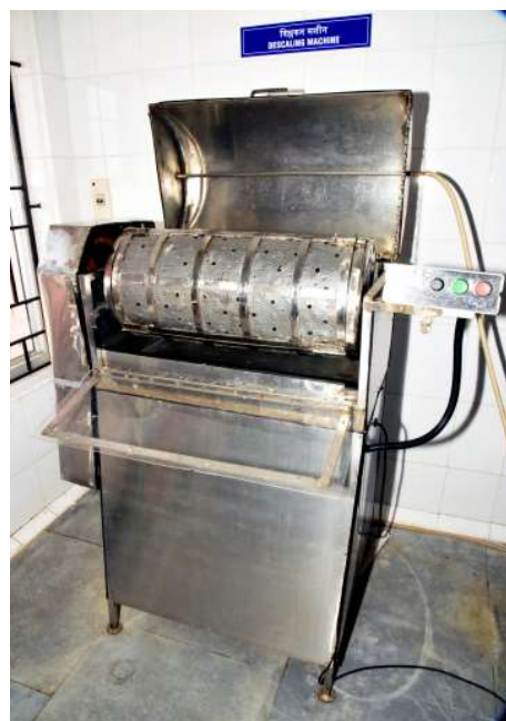
Fig.6 Fish descaling machine with variable drum speed