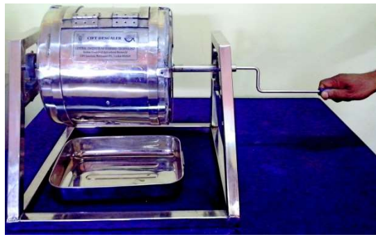
Fig.7 Fish descaling machine hand operated