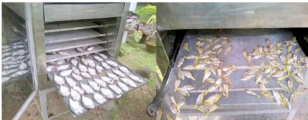
Fig.2 CIFT Solar-Electric Dryer