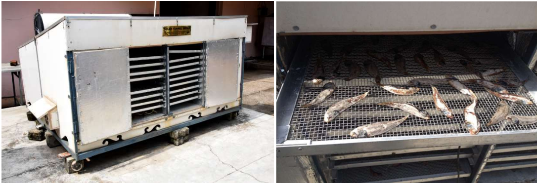
Fig.5. CIFT Solar-Cabinet Dryer with Electrical back-up