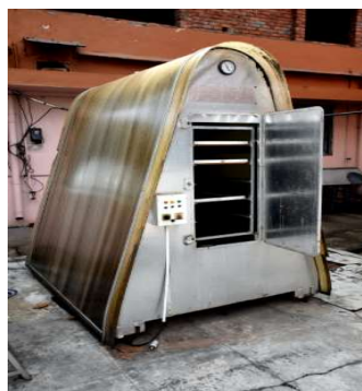
Fig.4 CIFT Solar-Tunnel Dryer

Solar tunnel dryer utilizes solar energy as the only source of heat for drying of the products. Heat absorbing area of 8 m 2 is made of polycarbonate sheet (Fig.4). Products to be dried are placed on nylon trays of dimension 0.8X0.4 m. The dimensions of the whole drying unit is 2.21X2.10X0.60 m. The capacity of the dryer is 5 kg. Drying takes place by convection of hot air within the drying chamber. Apart from fish, this dryer is also suitable for other agricultural products like fruits, vegetables and spices.