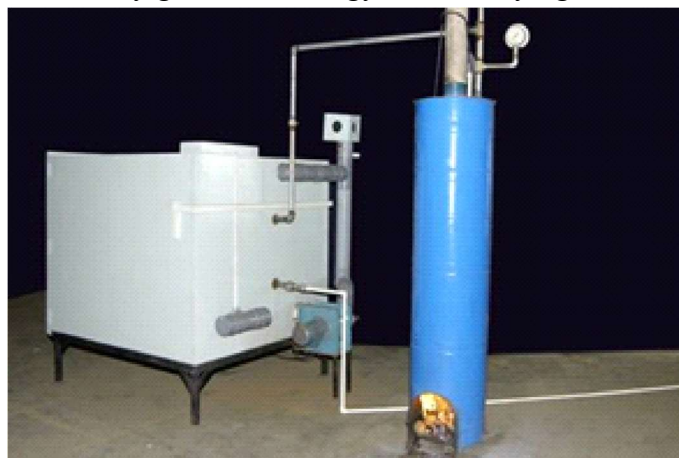
Fig.3 CIFT Solar-Biomass Dryer

available to maintain required temperature within the dryer, an alternate biomass heating system is manually actuated. Thus a fully green technology for fish drying is achieved by this.