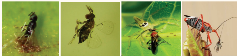
Egg parasitoid - T. cuspsis Egg parasitoid - Chaetostricha sp. Spider- Telemonia dimidiata Simon Reduviid - Panthous bimaculatus D.

Four species of egg parasitoids viz., Telenomus cuspsis sp. nov. Rajmohana and Srikumar (Platigasteridae), Chaetostricha sp. (Trichogrammatidae), Erythmelus helopeltidis Gahan (Mymaridae) and Gonatocerus sp. were recorded on TMB. Among them, T. cuspsis is the dominant one. Besides, nymphal - adult parasitoid ( Leiothron sp., [Braconidae]), ectoparasitic mite ( Leptus sp.) and nematode parasitoids were also recorded. But, none of these parasitoids are amenable for laboratory rearing. Among the predators; ants, praying mantises, spiders and reduviids also help in minimizing TMB population to a certain extent. Two fungal pathogens viz., Aspergillus flavus and A. tamarii can also cause infection in H. antonii . In most instances, though natural enemies play an important role in control of TMB, they could not minimize TMB population below economic thresholds levels.