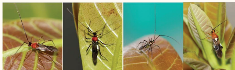
H. antonii H. bradyi H. theivora P. maesarum

P. maesarum : This species lacks the pin like knobbed process, have white scutellum and short antenna.