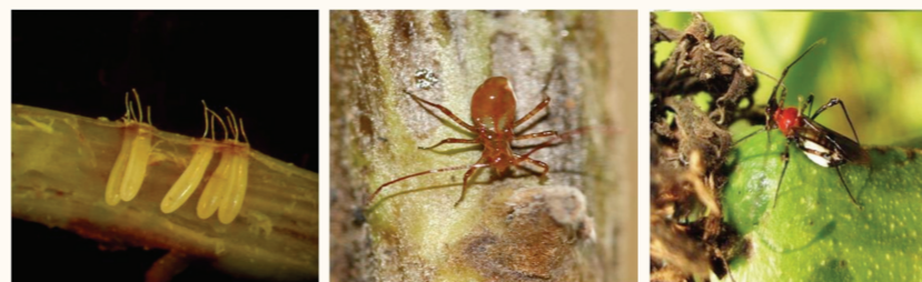
Eggs Nymph Adult