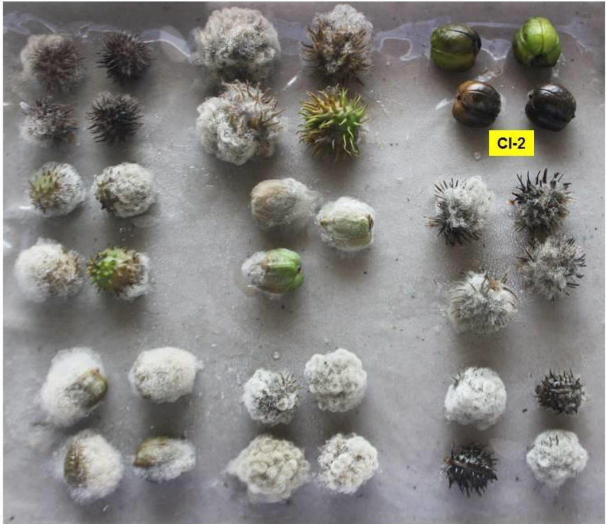
Gray mold development on Inoculated capsules incubated in growth chamber @7DPI