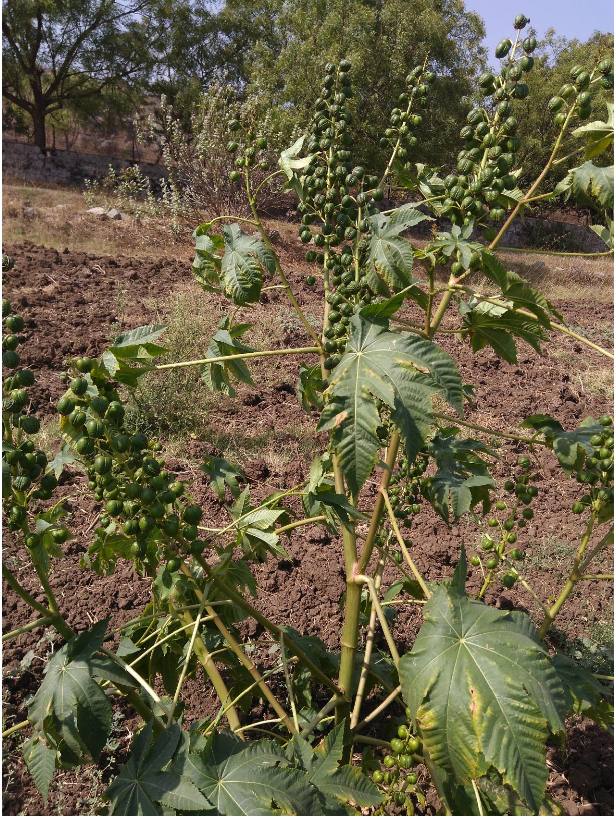
CI-2, a new inbred line with moderate resistance to gray mold