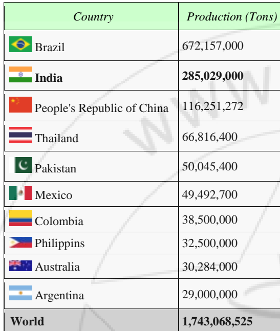
Table 2: In India