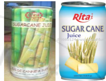
Figure 2: Packed Sugarcane juice

Vietnam. It is the national drink of Pakistan, where it is called "roh" and sold fresh by roadside vendors only. In Egypt, sugarcane juice is an incredibly popular drink served by almost all fruit juice vendors, who can be found abundantly in most cities. In both Indonesia and Malaysia, sugarcane juice is sold nationwide especially among street vendors. It is also bottled for local distribution in some regions and sold at food courts daily. In Singapore, it is sold in food courts only.