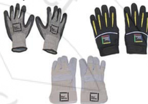
Figure 6: Leather gloves

The first step in eliminating hazards to the arms, hands, and wrists is education. The workers need to be informed about the proper ways to operate a machine, and things to be done in case there is a problem. This could include proper instruction on areas not to touch on the machinery without gloves, as well as proper placement of the hands to ensure they are not injured.