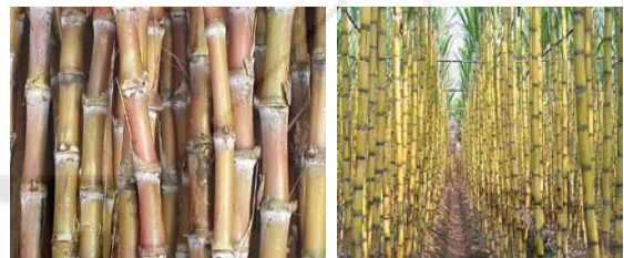
Figure1: Sugarcane Stalks

merchants began to trade in sugar - a luxury and an expensive spice until the 18th century. Before the 18th century, cultivation of sugar cane was largely confined to India.