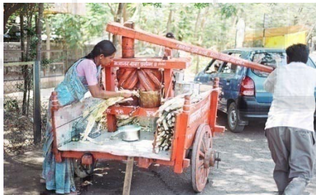
Figure 4: Sugarcane juice extraction by vendor

Different types of sugarcane juice machines available in the market are: Big Type Sugar Cane Juicer Machine, Cane Juice Four Roller Extractor, Cane Juice Machine, Cane Juice Wheel Concentrate, Cane Juicer Wheeled Machine, Cane Machine, Cane Manual Juicer Machines, Cane Small Type Juicer Machine, Cane Three Roller Appliance, High Quality Sugarcane, Fresh Sugar Cane Business, Hygienic Sugar Cane Juicer, Stainless Steel Sugarcane Crushing Rollers, Sugar Cane Chilled Squeezed Machine, Sugar Cane Chilled Squeezed Machine, Sugar Cane Gear Wheeled Extractor, Sugar Cane Three Roller Presser, Sugarcane Horizontal Domestic Machine, Sugarcane Juice Producer, Table Top Sugarcane Trendy Juicer, Big Sugar Cane Crusher, Box Type Cane Crusher, Cane Large Chiller Cum Crusher, Heavy Duty Sugarcane Crusher, Sugar Cane Chiller Cum Crusher, Sugar Cane Juice Concentrate, Sugar Cane Squeezebox Press, Sugarcane Crusher, Sugarcane Crusher