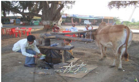
Figure 3: Sugarcane juice extraction with the help of bullocks

Sugarcane juice is not the new invention. Even in the past sugarcane juice is extracted from the sugarcane with the help of bullocks which is the traditional way of extracting juice from sugarcane. It is mostly seen in Rajasthan. Earlier humans also used the traditional sugarcane juice machine to extract juice by rotating it by themselves.