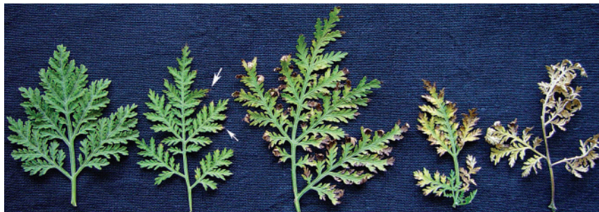
Fig. 1. Leaf blight symptom development on sweet wormwood. Note the initial spots marked with arrows. A healthy leaf is shown at the extreme left for comparison.

Pathogenicity was established by inoculating healthy plants. Healthy, mature leaves were spray inoculated with a suspension of \sim 3 \times 10^4 conidia/mL during the afternoon and immediately covered with an inflated polythene bag to maintain leaf moisture and high humidity. Control leaves received the same treatment except that the conidial suspension was replaced by sterile distilled water. After 24 h of incubation, the bags were removed and the leaves monitored daily to note symptom development. Symptoms identical to those found occurring naturally were observed 5–7 days after inoculation. Alternaria alternata was reisolated from such leaves.