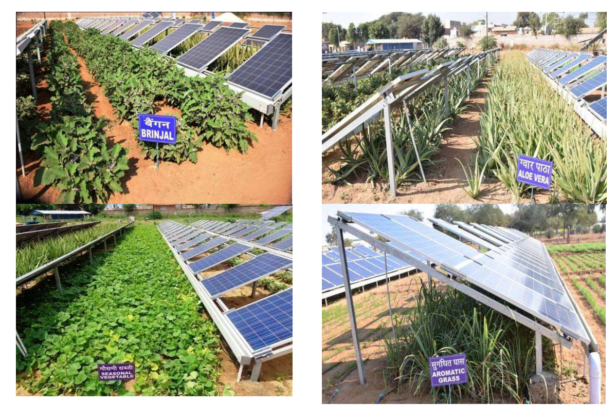
Fig. 4. Field view of different vegetables and aromatic grasses grown in agri-voltaic system during 2019-20