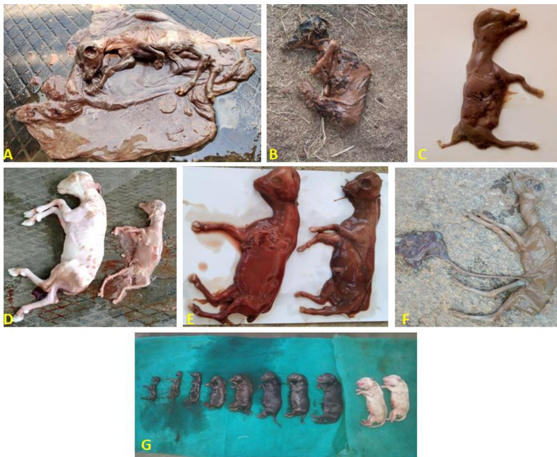
Figure 1: A. The haematic mummified fetus of cattle expelled at term. B. The papyraceous mummified fetus of cattle. C. Four-month-old haematic mummified buffalo fetus. D. Stillbirth normal fetus and mummified fetus of goat removed at term. E. Haematic mummified twin fetus aborted in goat. F. The haematic mummified fetus of sheep. G. Eight variable-sized mummified fetuses and two stillbirth normal fetuses removed by caesarian section in the dog (Adapted from Vikram et al. , 2015)

The formation of fetal mummy occurs gradually over weeks to months and depends upon the fetal age at the time of the death. In cattle and buffaloes, after fetal death when the placental caruncles start to involute, hemorrhage occurs between the endometrium and fetal membranes. This leaves a reddish-brown, gummy, tenacious mass of autolyzed red cells, clots, and mucus after absorption of plasma. The brownish mass of viscous adhesive material coats the fetus and hence the mummification is known as haematic or chocolate mummification (Fig. 1A & 1C). It is common between the 4 th to 8 th month of gestation but most cases occur during the 5 th and 6 th month in all age groups and various breeds of cows and buffaloes. The haematic mummification is also reported in dogs (Vikram et al. , 2015) and horses (Pizzigatti et al. , 2012). In some instances, the mummy will be dry, shriveled with the stiff fetoplacenta unit and no exudate is called papyraceous mummification, reported in cattle (Fig. 1B), buffaloes, dogs, cats, and sharks (Arthur et al. , 1996; Threlfall, 2005; Gadakh and Akhare, 2008; Alagar et al. , 2016; Rautela et al. , 2018). Moreover, fetal death at a very early age before the ossification process will lead to the absorption of entire fetal contents without forming a mummy. Unlike fetal mummification, fetal maceration differs by its putrified fetal contents in the uterine cavity under the presence of bacteria and oxygen.