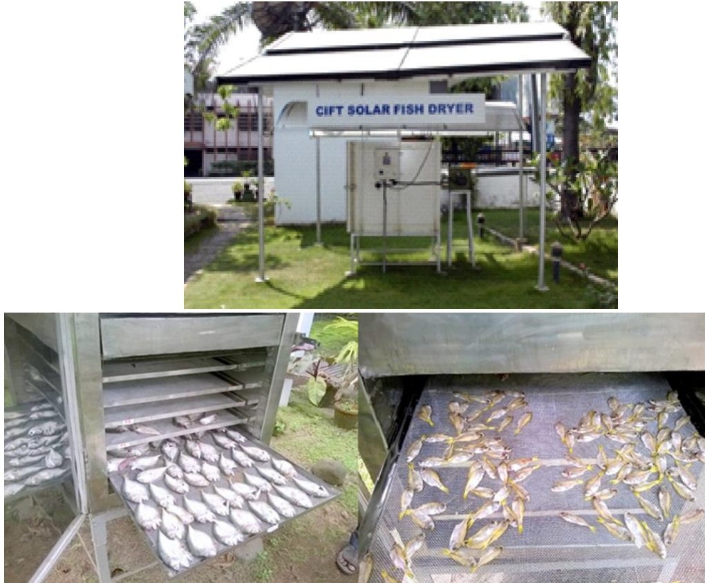
Fig.2 CIFT Solar-Electric Dryer

days and in night hours, so that the bacterial spoilage due to partial drying will not occur. Improved shelf life and value addition of the product fetches higher income for the fisher folk. The eco-friendly solar drying system reduces fuel consumption and can have a significant impact on energy conservation.