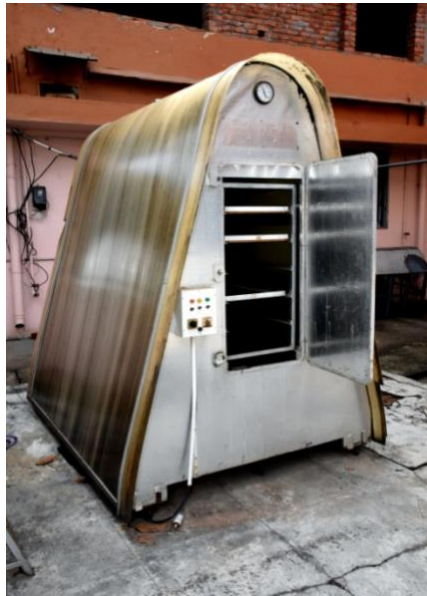
Fig.4 CIFT Solar-Tunnel Dryer