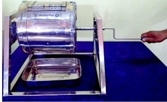
Fig.7 Fish descaling machine hand operated

1.3 Fish meat bone separator: A Fish Meat Bone Separator with variable frequency drive (VFD) to separate pin bones from freshwater fish was designed and developed. This can be used at a range of 5-100 rpm. With a unique belt tighten system developed; the new machine can be easily adapted to any species and need not be customised for specimen during the design stage. In existing imported models, only two speeds are possible which restricts the yield efficiency in a single span operation and also limits easy switching of the system for utilising specimen other than for which the yield has been originally customised. The meat yield of this machine was about 60% against 35% in imported models. Capacity of the machine is 100kg/hour.