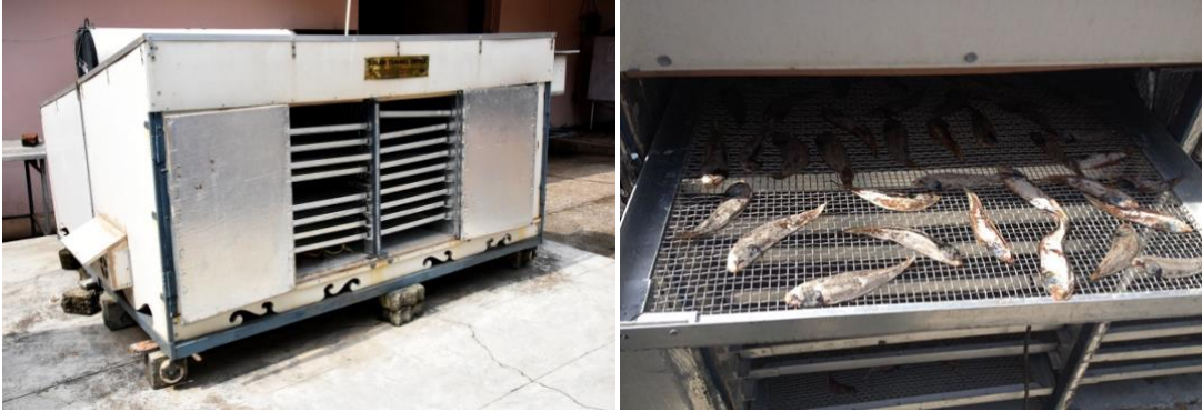
Fig.5. CIFT Solar-Cabinet Dryer with Electrical back-up

back up comes into role once the desired temperature is not attained for the drying process, particularly during rainy or cloudy days.