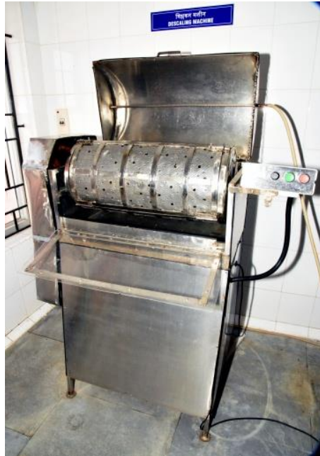
Fig.6 Fish descaling machine with variable drum speed