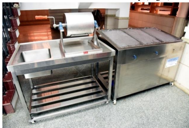
Fig.8 Refrigeration enabled Mobile Fish vending kiosk

1.4 Modern Hygienic Mobile fish vending kiosk: Most of the fisher folk across India sell fish in an open basket without any hygienic practices. The fish is kept in an open bag or container, it loses its freshness. They use ice purchased at high cost for temporary preservation and at the end of the day, if the fish is not sold, they give it at a low rate to customers with little or no profit. More over fish gets contaminated under unhygienic handling practices. The fish vending persons, especially women folk find it difficult to carry the fish as head load and subsequently sell it in the local markets or consumer doorsteps. In this context, the ICAR-CIFT have designed and developed a mobile fish vending kiosk for selling fish in the closed chilled chamber under hygienic conditions at consumer doorstep (Fig.8).