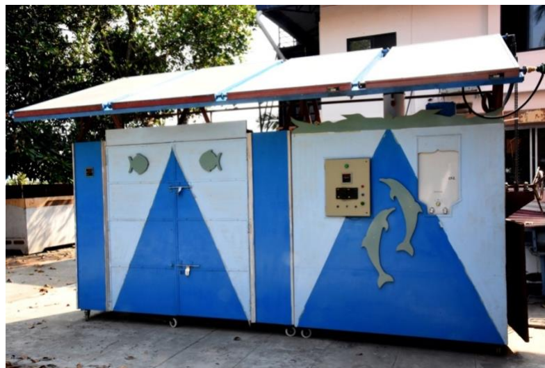
Fig.1. CIFT Solar-LPG Dryer

This dryer is ideal for drying of fish, fruits, vegetables, spices and agro products without changing its colour and flavour. It helps to dry the products faster than open drying in the sun, by keeping the physico-chemical qualities like colour, taste and aroma of the dried food intact and with higher conservation of nutritional value. Programmable logic Controller (PLC) system can be incorporated for automatic control of temperature, humidity and drying time. Solar drying reduces fuel consumption and can have a significant impact on energy conservation.