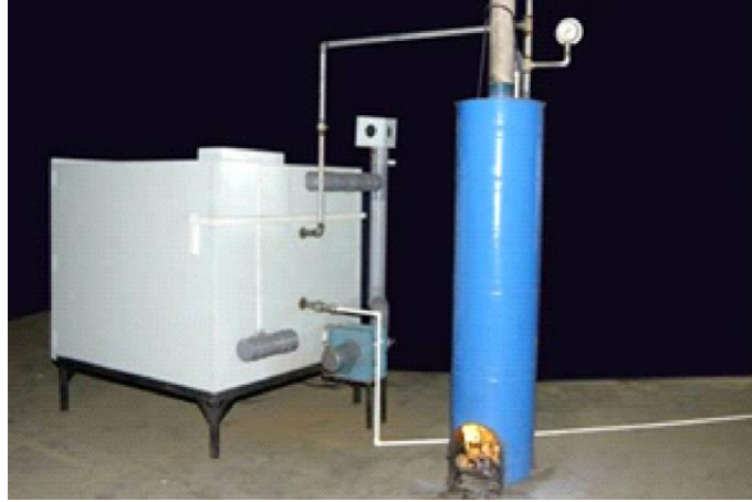
Fig.3 CIFT Solar-Biomass Dryer