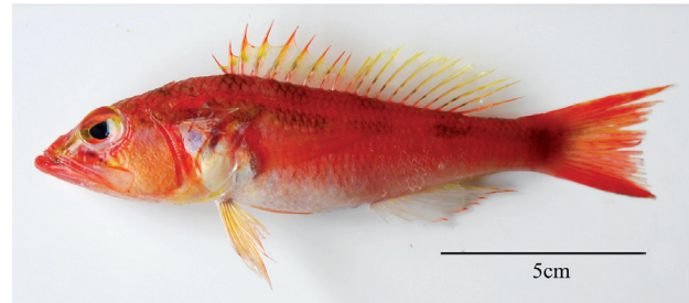
Fig. 2. Chelidoperca investigatoris GB.31.139.16.2, 125 mm SL