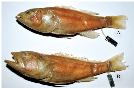
Fig. 1. Chelidoperca investigatoris . (A). ZSI 12821, 103 mm SL, female. (B) ZSI 12820, 107 mm SL, female

Body moderately elongate, cylindrical; depth 3.69-3.81 in standard length (SL), 1.55-1.73 in head length (HL); head moderately compressed, head length 41.95-48.71% SL, 2.05-2.38 in SL; snout short, pointed, snout length 4.55-5.44 in HL; orbit moderately large, 9.05-11.32 in SL, larger than inter-orbital width and snout