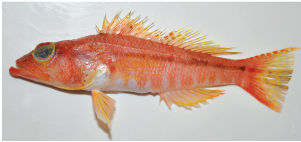
Fig. 5. Chelidoperca occipitalis GB.31.139.16.1, 12.5 mm SL from Kollam, south-west coast of India