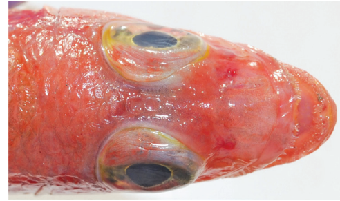
Fig. 6. Chelidoperca occipitalis GB.31.139.16.1, dorsal view of head