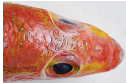
Fig. 3. Chelidoperca investigatoris . Dorsal view. GB.31.139.16.2, 12.5 mm SL

length; interorbital space flat, scaly, scales reaching up to the orbit; inter-orbital 10.54-15.79 in HL; opercle with 2 flattened spines, lower one prominent; preopercle rounded, finely serrated with 25-37 serrae; caudal peduncle depth 10.77-11.83% SL.