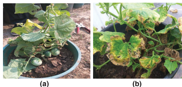
Fig. 1. Pot experiment showing Resistant (a-IC331627) and susceptible (b-IC538145) reactions against isolate Pc17

Five seeds of each accession after sterilization with sodium hypochlorite (2 %) for 2 minutes and rinsing thrice in sterilized water were sown in plastic pots (20 cm diameter) filled with sterilized soil with