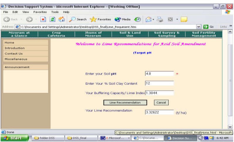
Fig.2. How the lime module works

To solve the problems related to acid soils, their management and provide immediate information to solve the problem of the user an interactive web-based computer program has been developed to provide assistance on making decisions related to acidic soils and their management.