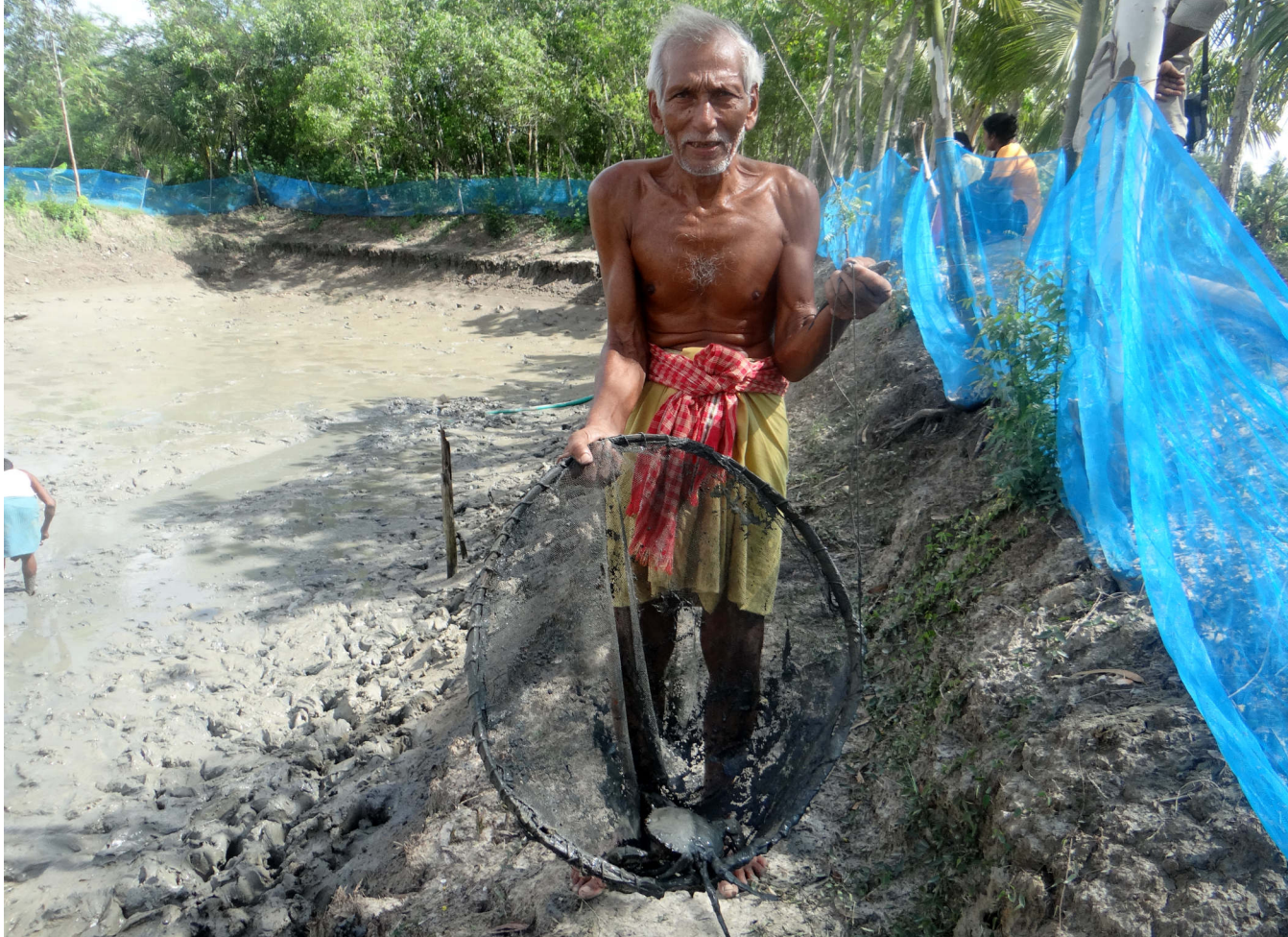
Mud crab harvest using farm-made circular net.