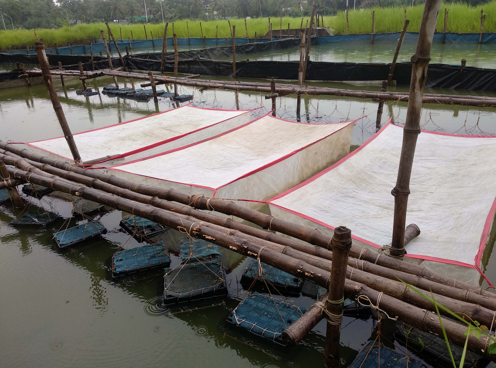
Hapa nurseries for rearing of mud crab instar.

designed feeding tray that leaves a space between the bottom soil and tray while submerged is employed to avoid crushing of crablets present in the bottom sand while lowering the tray. The animals are fed with chopped molluscan meat ad libitum twice daily. To provide shelter and to avoid cannibalism, a large number of hides made of pipes and tiles are provided. Grading and culling of animals are carried out by carefully picking up the hideout pipes and collecting shooters of 80-100 g among the smaller size crabs (10-40 g) which were then stocked to grow-out ponds. Final harvest after completion of second tier is carried out after 45 days with an average harvest size of 80g (40-120 g) and average survival of 50%.