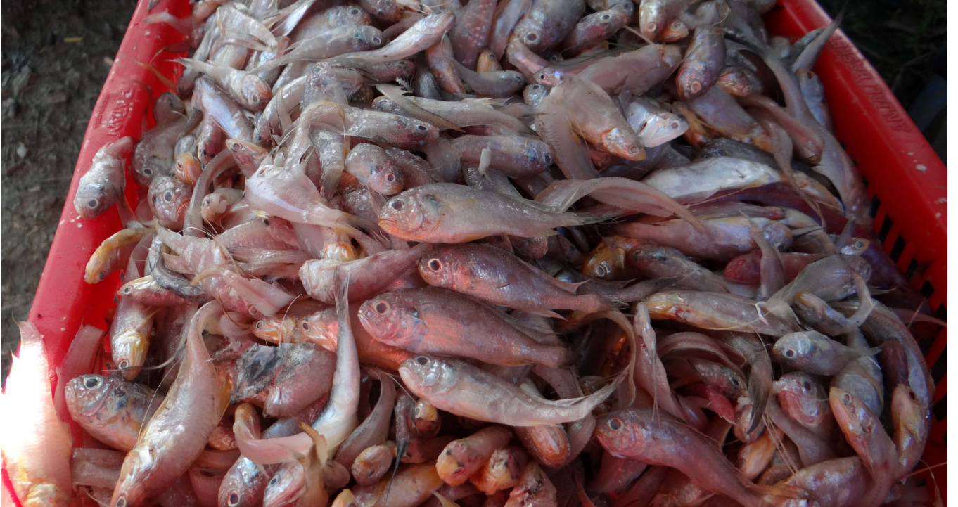
Above, below: Trash fish (raw and sun-dried).