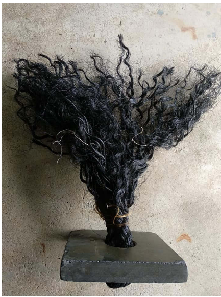
Crab hide used in nursery.