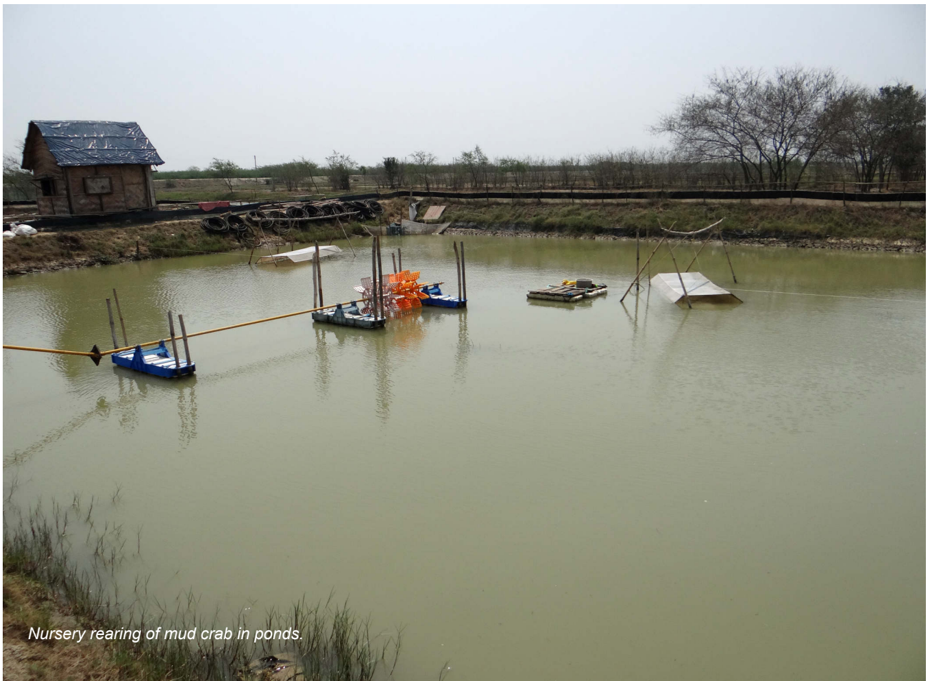
Nursery rearing of mud crab in ponds.

Crab fattening involves rearing of soft-shelled or immature crabs in individual boxes wherein the animals are fed until the shell is hardened or up to the development of gonads. Gravid females with full orange-red eggs fetch a high price both in domestic and export markets. A 200 g animal after 1 month gain 25-50 g and the fattening may continue for 9-10 months in a year with one fattening cycle duration of 20-30 days.