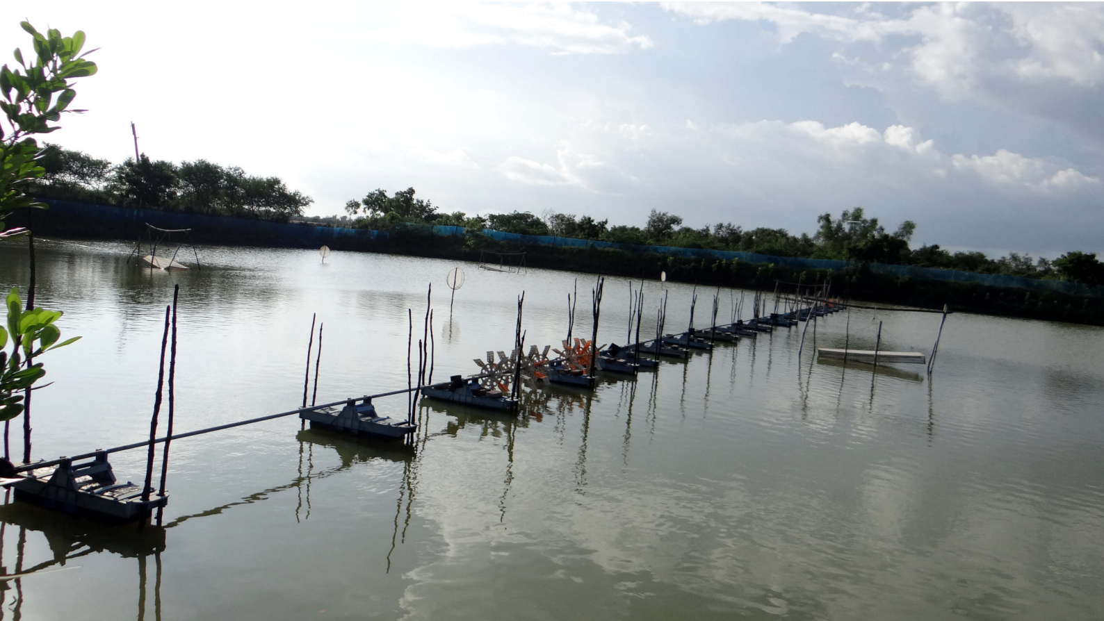
Mud crab grow-out pond.

1. Kakdwip Research Centre, Central Institute of Brackishwater Aquaculture (ICAR), Kakdwip, South 24 Parganas, West Bengal PIN-743 347, India. 2. Central Institute of Brackishwater Aquaculture (ICAR), 75, Santhome High Road, R.A. Puram, Chennai 600 028, India. *Email: christinapautu@yahoo.com