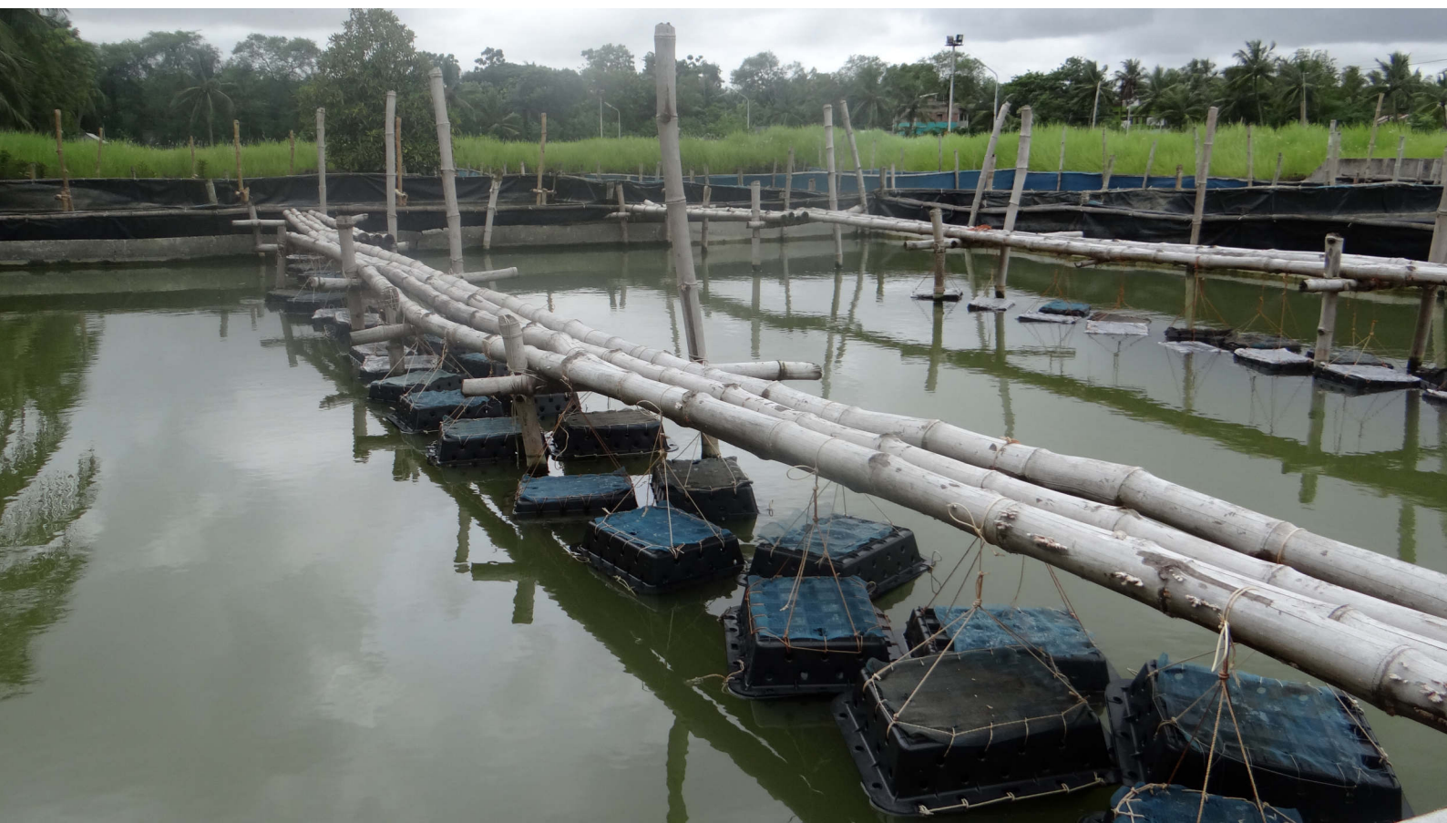
Above, below: Rafts for box culture of mud crab.