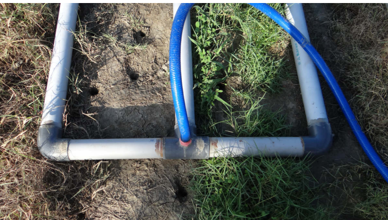
Interconnecting pipes for support and floatation of box cages.

vertically stacked mud crab boxes which can be installed in pond system with a lifting and sinking mechanism can be an innovative and less expensive alternative for farmers.