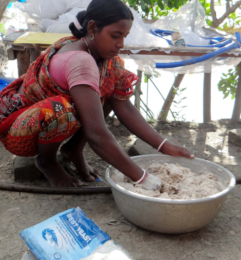
Preparation of farm-made mud crab feed.

bream ( Nemipterus sp.) and grenadier anchovies ( Coila sp.) are among the commonly available trash fish in West Bengal. Molluscan species such as Telescopium sp. and Bellamya bengalensis which are available in ponds and canals as pests are often caught and utilised as feed in nursery rearing of mud crab. The ease of farming and lower investment required in crab culture along with good return attracts small farmers to this venture.