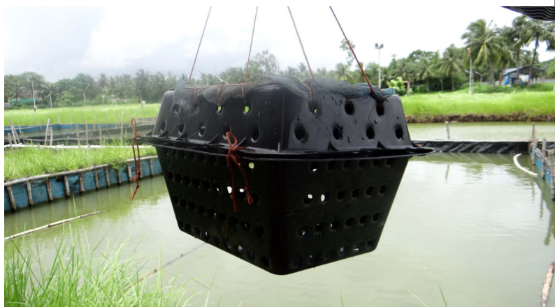
Above, below: Box culture of mud crab.

The high temperature during summer induces stress to the cultured mud crab in boxes which remain afloat at the pond surface throughout the day. Besides the stress caused by the heat, the constant exposure to sun may cause algal growth and fouling on the exoskeleton. These factors may lower the market value of the animal, hinder molting and cause death due to high temperature. A practical and innovative thinking is imperative in solving a problem faced in the farm, and has been one of the significant factors in improving the culture system. Keeping in mind these factors which adversely affect the box farming, the submersible box system was developed. This submersible box system is engineered and designed based on the function of a water pump. In this system, the PVC pipe which help float the box are interconnected and a pump is attached in one corner of the pipe. The system functions by pumping in or flushing out water from the pipe which in turn submerged or make the structure afloat. Using this technique, the cages can be submerged underwater during the hot days.