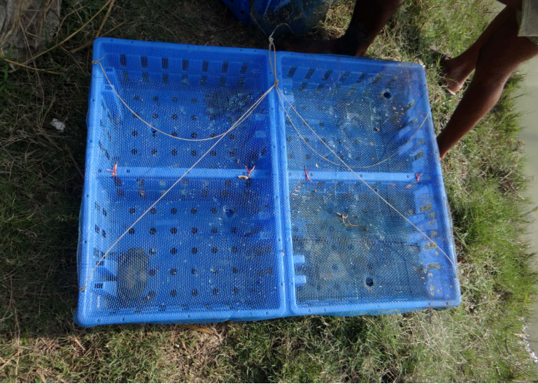
Above, below: Different styles of boxes for crab growout.