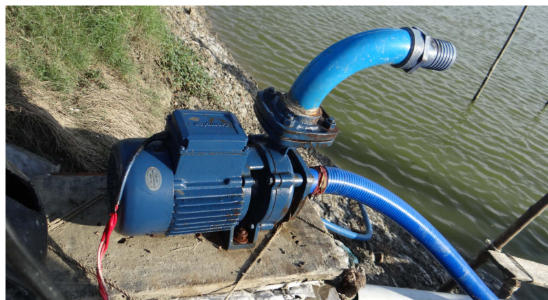
1.5 HP pump for suction and delivery of water into the box cage pipe, controlling floatation and submersion.