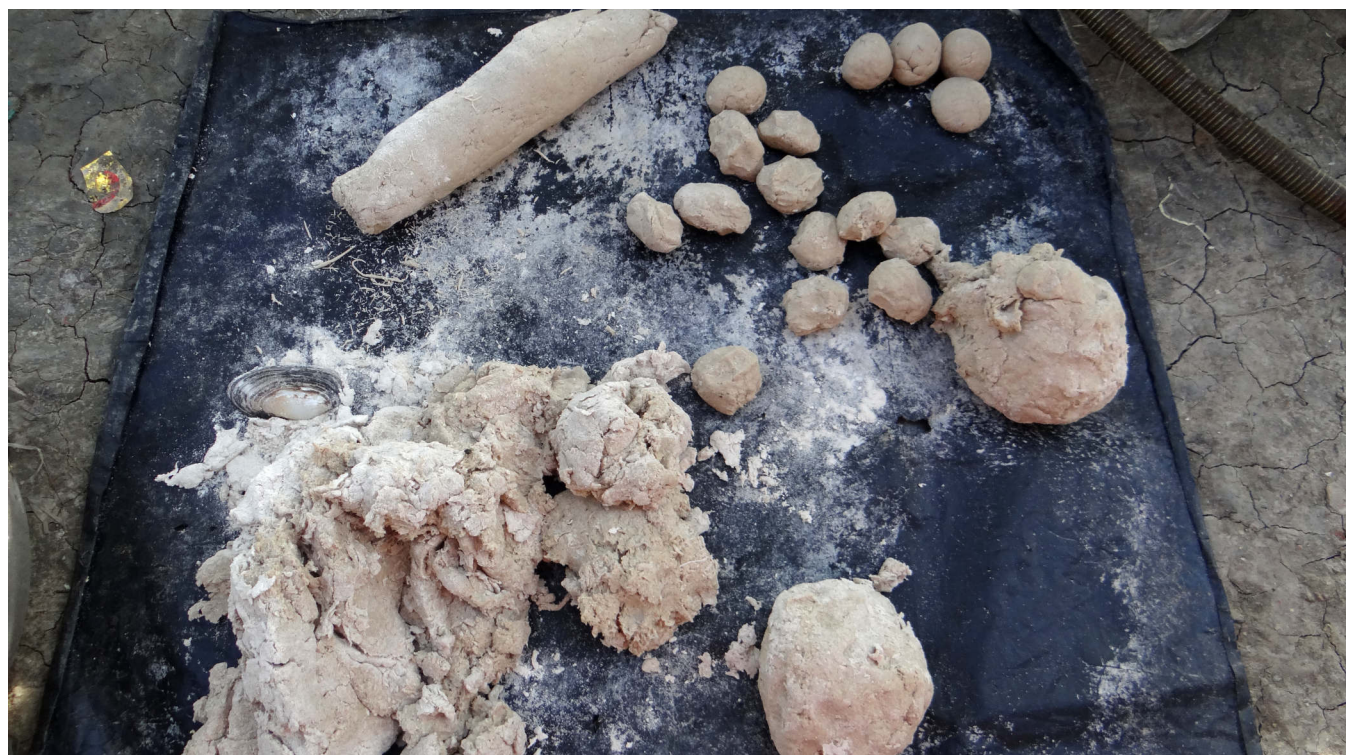
Farm made pellet feed.

The harvested crablets of 2.5-4 cm from hapas are stocked into nursery ponds at the rate of 3-4 individuals/m 2 . Pond preparation includes crab fencing, disinfection, liming and fertilisation using minerals and probiotics. A specially