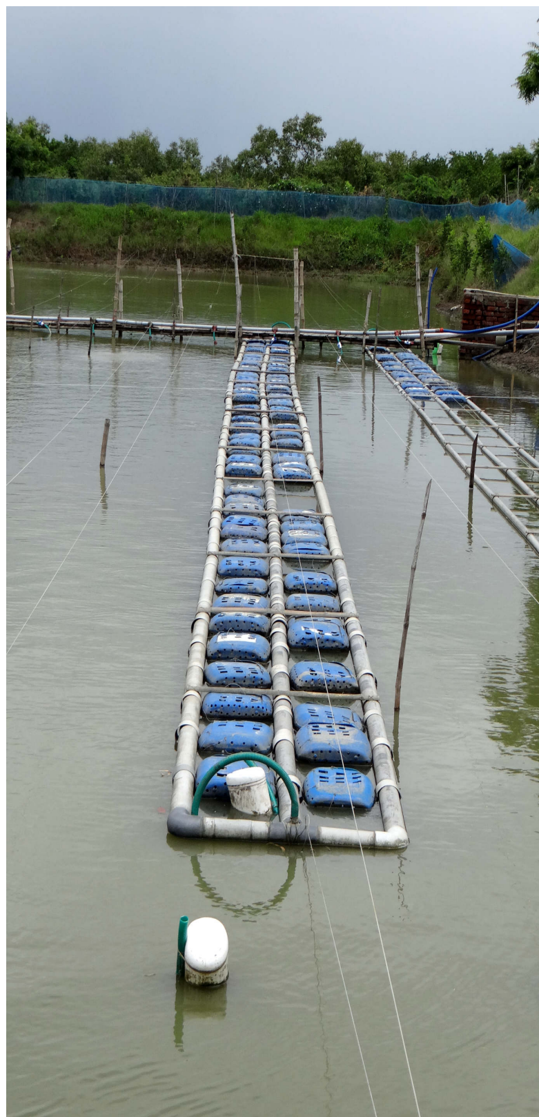
A single farm-made submersible cage.