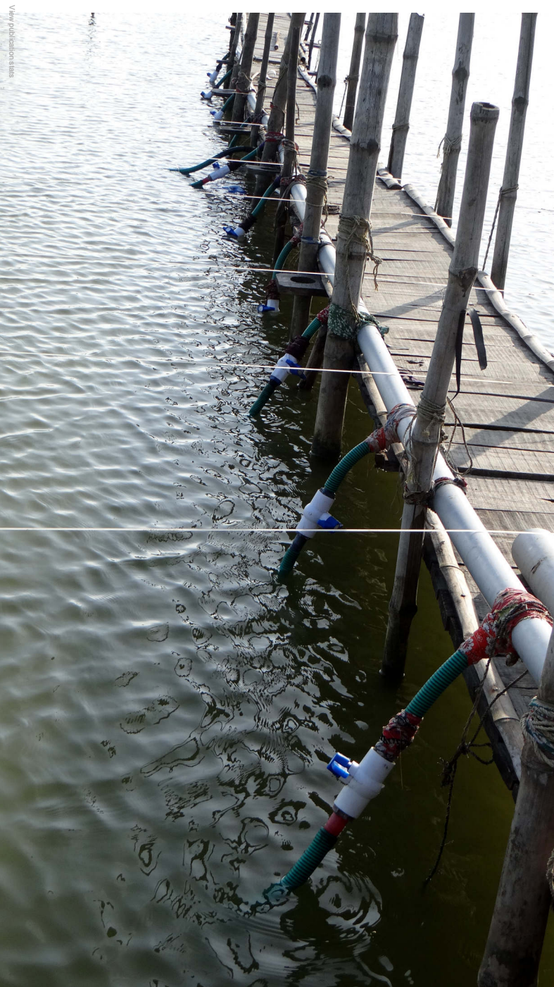
Several units are interconnected using the main pipe from the pump.