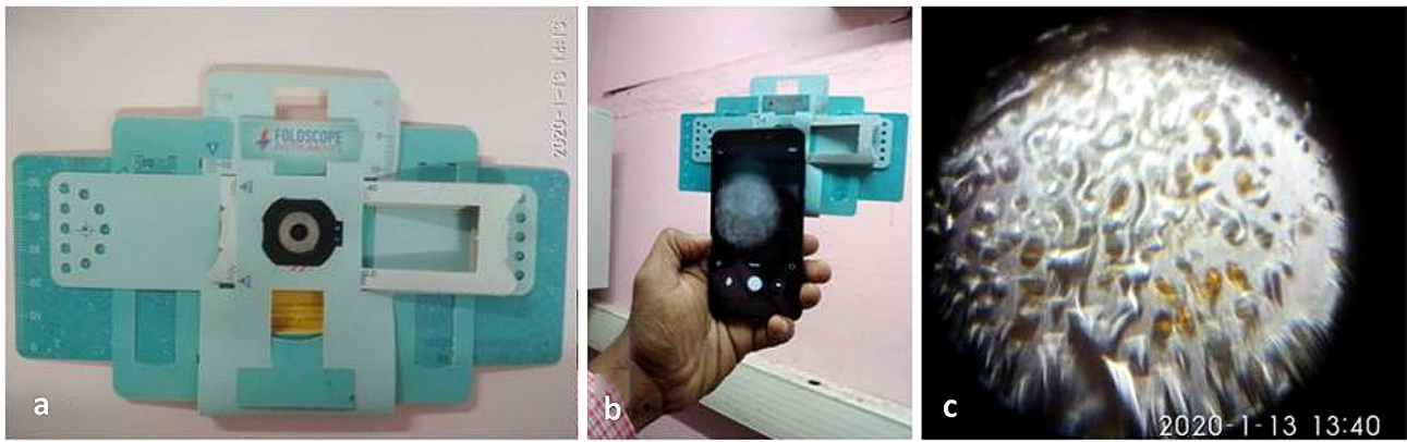
Fig. 3 Observation of uredospores using mobile phone integrated with Foldscope. a Foldscope. b Foldscope attached with mobile phone. c Uredospores on sticky slides photographed through mobile phone attached with Foldscope

in the phone and the digital pictures were stored (Fig. 3b, c). Earlier, the Foldscope was used to create awareness among school children about micro organisms and to observe the presence of fungal spores very easily (Wangdi et al. 2019).