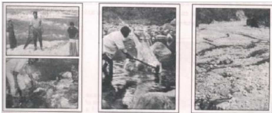
Fig. 1. The Goda structure fixed in the fast moving water (riffle) area of a stream.

In shallow streams, the stick is often the best instrument to catch the mighty T. putitora . During monsoon, the T. putitora migrates to small