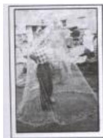
Fig. 12. A fisherman displaying the castnet.