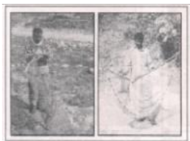
Fig. 4. Two fishermen displaying the different types of bag nets.

Various types of plant products such as leafs of Khina ( Madhuka spp.), Rambans ( Agave americana ), stem bark of Jamun ( Syzygium cumini L) and oil cake of Cheura ( Sapium spp.) are used to catch various size of fishes (Fig. 5). These plant products are first well grinded and thereafter, applied to slow moving water area (pool habitat). These herbal products are well mixed with the mud to make the stream water turbid; it is mostly applied during the morning or evening hours. After its application, the fishes come to the surface and exhibit abnormal behavior (nervous breakdown and lack of dissolved oxygen may be the possible causes). The fainted fishes are collected by the fishermen using simple cloth/cast netting or kadiyali .