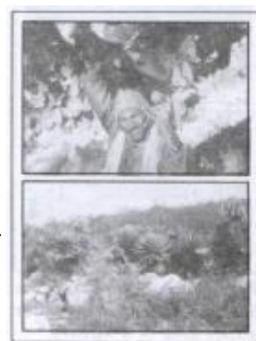
Fig. 5. A fisherman showing the seeds of Sapium spp. and a view of Agave americana plant, both used as herbal toxicant.