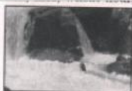
Fig. 7. A small pit made to catch jumping fish in the cascade type habitat.

Most of the fishermen use hooks to catch big fishes specially Tor spp., Schizothorax spp., Labeo spp., and Mastacembelus spp. This is used in fast moving as well as slow moving water areas. Generally, 10 to 20 hooks are tied to a nylon rope (1 to 2 cm thick). The nylon rope is then put in the stream water during the evening hours and the hooked fishes are collected the next morning. The hooks are generally put without bait but often the baits of melon seed, small fish, flies, wheat flour, wheat flour mixed with turmeric powder, and cooked rice are put on the hooks (Fig. 10).