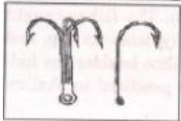
Fig. 10. Different types of hooks used for fishing.