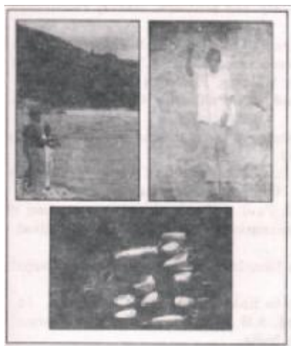
Fig. 14. The different classes of people enjoying angling and the different types of artificial baits used.

In the Kumaon region bait fishing is also practiced. The principle of bait fishing is to offer natural or artificial bait to entice fishes that get hooked and lifted. Big sized Tor spp. are often caught with lures, called plugs, spoons and flies. The bait often consists of flour and millet paste, minnows, and worms.