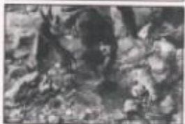
Fig. 8. A local man catching the fish hiding in the rock.