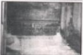
Fig. 9. The trap put near the barrage to catch fish