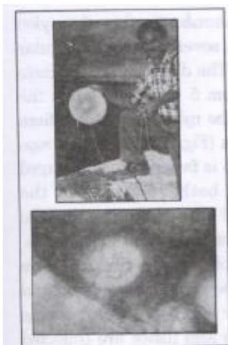
Fig. 6. The structure used in the "Pot and Pan" process and the fish assemblage over the structure.

The Tor and Schizothorax species have good jumping ability and move against the stream flow. Some fishermen use this behavior to catch fish. The fishermen make a small pit of about 50 x 50 cm dimensions by removing the substrate (Fig. 7). The pit formed is surrounded with cobbles and gravels in such a way that the fish could not escape from it. While jumping through the cascade or rapid type habitat, the fish often fell into the small pit from where it cannot escape (as it cannot attain the swimming velocity to jump out of the pit). This method is practiced during the morning or evening hours when most of the fishes are seen jumping. Locally this method is known as khori . Fishes up to 2 kg size are caught by this method.