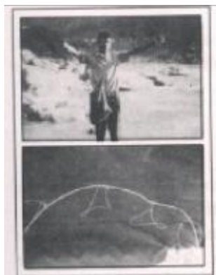
Fig. 11. A fisherman displaying the Suraka

The use of the gill nets (locally known as Mahajaal ) in streams is mostly practiced in the deep pools. The Mahajaal is spread into the stream using air filled tubes (bus and truck tires), as boats are not operated in the streams. Two fishermen hold the two ends of the net and move in opposite directions on air filled tubes. The fishermen normally practice this method during the evening and morning hours. The gill net is very effective when the adult T. putitora are on migration (both spawning and feeding migration). The net is made up of nylon silk, more than 10 m long and stretched mesh size varying from 5.0 to 8.0 cm. Normally, two gill nets of different mesh sizes are used at a time. They are placed across the stream by means of rope fastened at the banks. Using this method, the fishermen are able to catch up to 10 kg of Tor and Labeo species.