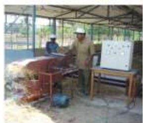
Figure 1-Mini paddy thresher-performance study

The mini paddy thresher was field tested for threshing freshly harvested panicles of paddy, Figure 1. The thresher was set to run at fixed level of operational parameters by adjusting the concave clearance at 15 mm and cylinder peripheral speed 16.50 m s -1 . The thresher was operated for a period of six hours with rasp bar threshing cylinder and the performance was evaluated following the test procedure described by IS: 11234: 1985.