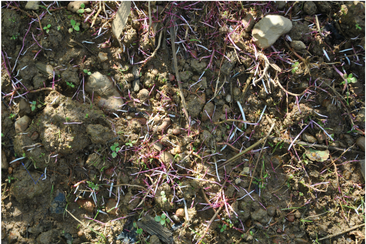
Fig. 1. Negatively geotropic roots of sugarcane clones under waterlogged condition

metaxylem vessels, average root diameter and ratio of cortex to stele (un-published).