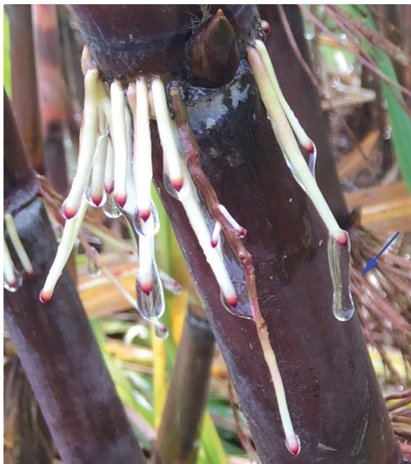
Fig. 4. Water drop on swollen calyptras of roots during rainy season

4). Studies on roots morphology and architecture are of prime importance in understanding the adaptation to waterlogging tolerance which is less investigated in sugarcane. In a study conducted