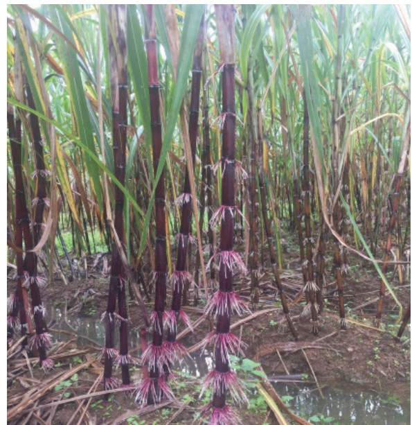
Fig. 2. Aerial roots of waterlogging tolerant sugarcane clones

In clones sensitive to waterlogging the geotropic are not present. Quick growth of a variety and bobbin shaped internodes are found related to waterlogging tolerance (Srivastava et al. 2003). Hidaka and Abdul Karim 2007 reported three types of roots under waterlogged condition, aerial roots (Fig. 2), whitish roots and secondary roots. The whitish roots referred as buttress roots by earlier workers (Jensen 1937 Evans 1934). The anatomy of the buttress roots showed extensive aerenchyma compared to normal roots. In young normal roots the aerenchyma formation was not observed even under waterlogged condition (Fig. 3). During rainy season the aerial roots shows water droplets hanging on the tip on the swollen calyptra (Fig