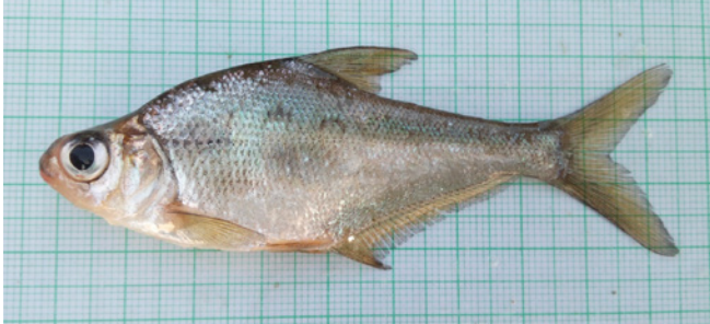
Figure 1: A fully matured O. cotio collected from the inland open water body

very deep with laterally compressed, dorsal profile steep with a hump on the back, eyes comparatively large, snout blunt, scales small and irregularly arranged, 27 pre-dorsal scales (Vishwanath and Shantakumar, 2007). The pectoral fin touches the pelvic fin base and later almost touches the anal fin base, anal fin elongated with 31 branched rays, inserted well behind the dorsal fin. Body depth 42.9% (39.3-44.9 %) of standard length (SL), pre-pelvic length 40.09% (37.4-42.2 %) of SL, pre-anal length 55.2% (52.3-58.2 %) of SL, and length of the anal fin 37.7% (36.4-38.6 %) of SL.