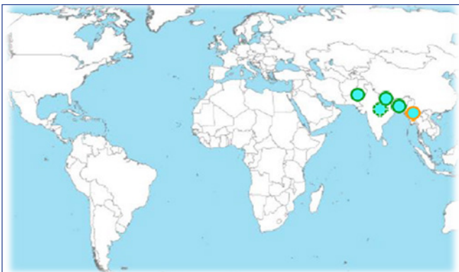
Figure 2: Global distribution of O. cotio

It is distributed in Bangladesh, India, Pakistan, and Nepal in Asia, and its presence in Myanmar is questionable (Rahman, 1989; Talwar and Jhingran, 1991; Shrestha, 1994) (Figure 2).