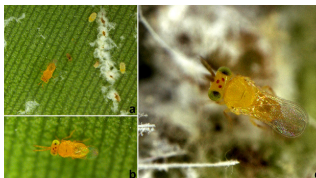
Fig. 1. Adult of Encarsia dispersa Polaszek on rugose whitefly infested banana.

Diagnosis: Both Encarsia dispersa and E. guadeloupae have a tarsal formula of 5–4–5 and belong to the luteola species-group (Hayat, 2011), with E. dispersa being a part of the Encarsia meritoria species-complex, a subgroup of the luteola -group (Polaszek et al. , 2004). Females of Encarsia dispersa can be distinguished from E. guadeloupae by the following combination of characters: body more or less uniform orange-yellow except mesoscutal-scutellar transverse suture distinctly pigmented dark brown-black (Fig. 2a) in live and recently mounted specimens; antennal scape pale yellow to white, pedicel yellow, flagellum pale yellowish brown to brown, F6 usually darker than rest of flagellar segments. Wings hyaline. Legs, including coxae, yellowish except tarsal apices pale brown. Antennal formula 1133 (Fig. 2d, e), F1 shorter than pedicel and F2, F2 subequal to or only slightly longer than F3, rest of flagellum more or less subequal in length. Midlobe of mesoscutum with 12–15 setae (Fig. 2b); each side lobe with 3 setae; scutellar sensillae widely separated; distance between anterior pair of scutellar setae slightly greater than between posterior pair. Fore wing (Fig. 2c) about 2.3x as long as broad with marginal fringe less than one-fifth of wing width (modified from Hayat (2011) and Polaszek et al. (2004)). Hayat (2011) provided detailed descriptions of E. dispersa and E. guadeloupae with illustrations.