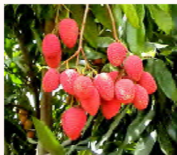
Litchi cultivar China

This is a medium-late season cultivar and fruits ripen during end of May in West Bengal, first week of June in Jharkhand and during second week of June in North Bihar. Trees of cultivar China are dwarf (4.0 m height, and 6.0m spread) and high yielder (80-100 kg/tree) but prone to alternate bearing. It bears fruits in cluster of 12-18. The plants bear less fruit in southern direction. Fruits are large in size (3.86 cm length and 3.26cm diameter), medium in weight (22.0g/fruit), oblong in shape and tyrant rose in colour with dark tubercles at maturity. Aril is creamy-white, soft, Juicy, sweet having 18.17% TSS, 11.0% total sugar and 0.43 o Brix titrable acidity. Seeds are glaucous, dark chocolate in colour, oblong to concave or Plano convex in shape, medium in size (2.9 cm length and 1.5 cm diameter average in weight (3.49 g/seed). The ratio of rind : pulp : seed by weight is 16.42 : 69.22 :14.36.