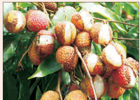
Fruit cracking in litchi