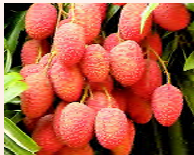
Litchi cultivar Shahi

Shahi: This is the most popular cultivar of North Bihar, Jharkhand, Uttaranchal and Uttar Pradesh. The fruits have distinct rose aroma and hence called as Rose Scented. It is known as “Shahi” in Uttaranchal and “Muzaffarpur” in Western Uttar Pradesh. This is an early season maturing cultivar ripens during second week of May to first week of June at various locations. It matures 12-15 May in Jharkhand, 25 th May in North Bihar and by end of May in tarai region of Uttaranchal.