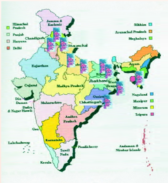
Litchi Growing Areas in India

Litchi ( Litchi chinensis Sonn) is an important subtropical fruit crop of the country. It is known as queen of the fruit due to its attractive deep pink/red colours and fragrant aril. It has high nutritive value and suitable for geotropic weak person. Litchi appears to be native of Southern province of China and northern Vietnam from where it was introduced into India during the 18 th century in the North East region (Tripura) and over the period of time it travelled to eastern states and percolated in the northern states of India. From China, litchi spread further to West Indies, South Africa, Hawaii Islands, Florida, Vietnam, Indonesia, India, southern Japan, Formosa, Australia, New Zealand, Brazil, India etc. Litchi is now an important commercial fruit crop in India due to its high demand in the season and export potentiality. Cultivation of litchi is widely spread in eastern India covering approx. 100 km width from foot hills of Himalaya