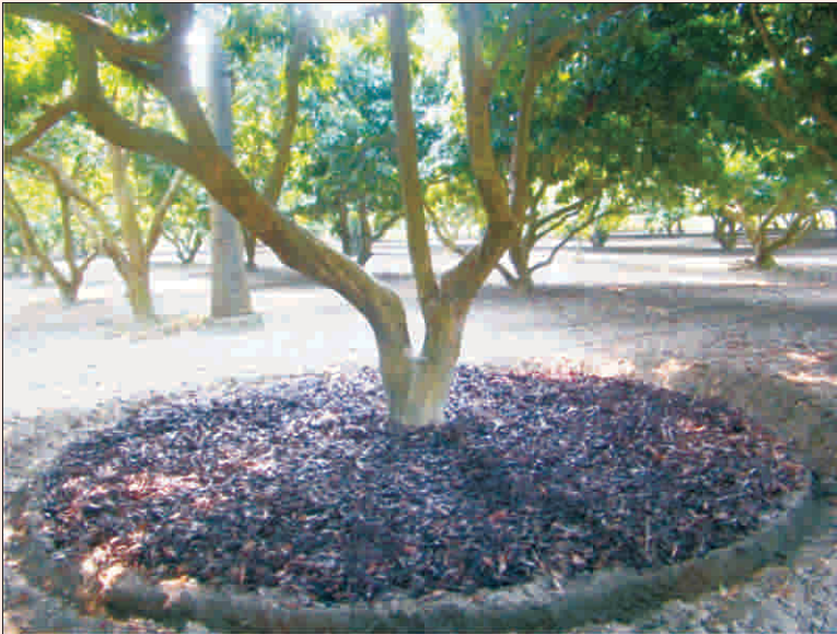
Mulching in plant basin