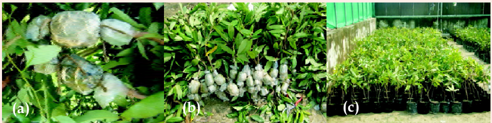
Litchi propagation of through air layering (a) Rooted air layered shoots (b) Collection of gooties in Nursery (c) Planting of layers in green house

For preparation of air layers, healthy terminal branch receiving good sun shine with a thickness of about 1.2-1.5 cm is selected. Better the branch used for layering, better the root system obtained. The branches must be selected on the periphery of the tree, so that they can easily be worked on. The newly flowered/fruited shoot which has exhausted its food material generally produces poor roots, thus should not be selected for air layering. On a selected branch, 2.5 cm ring of bark is removed about 45-60 cm below the tip of shoot. Further the cambium layer is rubbed off and woody portion is exposed properly. For early and proper rooting pasting of 1000