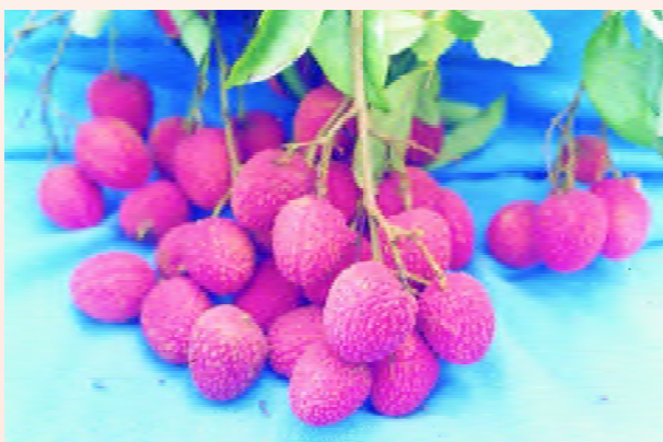
Litchi cultivar Bombaiya

Bombaiya: This is an important cultivar of West Bengal. It is a vigorous cultivar attaining a height of 6-7 m and spread 7-8 m. The cultivar matures early (first to second week of May) and gives 80-90 kg yield per tree. Fruits are large in size (3.5 cm long and 3.2 cm diameter), obliquely heart shaped, weighing 15-20 g. The colour of ripe fruit is attractive carmine red with uranium green skin background. Like Chinese cultivar "Hom Shen Chi" this cultivar also has a small, tiny under developed fruit attached to the fruit stalk of each fully developed fruit. Pulp is grayish white, soft, juicy, sweet containing 17 o Brix TSS, 11.0% total sugar and 0.45% acidity. Elongated, smooth and shining seed of light chocolate colour is 2.3 cm long with 1.6 cm diameter and weighs 3.4g. Ratio of rind : pulp : seed in this cultivar is 12.1 : 70.1 :16.8.