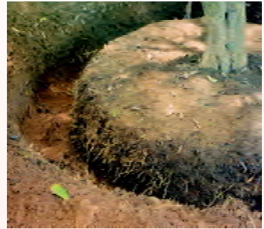
Root primary and fertilizer applications trench in litchi plants

25-30 cm fruit bearing shoots at the time of harvesting should be removed. In this way, 2-3 new terminals will develop which will consequently develop into fruiting branches next season. As principle, young trees are lightly pruned to provide larger area for photosynthesis. Severe pruning at young stage should however be avoided as it hinders the tree development and increases the period of juvenility. Besides, removal of dead and diseased shoots, small internal branches which prevent the sun rays to penetrate inside the canopy should be removed. Although, removal of branches along with the fruit bunch had shown its promise, but culturing compact canopy seems to be more useful in other litchi growing countries. The techniques includes, more pruning at top (open window) and outer parts of the tree canopy and less at bottom and inner side of the canopy which promotes stereo fruiting. In Israel however, dwarf stature litchi tree has been maintained by topping and hedging.