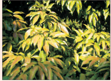
Deficiency of iron