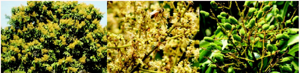
Flowering in Litchi plant (Left), Pollination through Honey bee (Centre), Initial fruit set in litchi (Right)

in which the seed is shriveled, presumably, develop without fertilization and such cultivars are likely to be self sterile and perhaps cross-sterile also, while those with normal seeds are probably self and cross fertile. It is thought that pollination is necessary even for seedless type, this being a case of stimulative parthenocarpy. Though, litchi plants flower profusely but only 2 to 4.5 per cent of the total flowers set fruits. This may be due to lack of fertilization or embryo abortion.