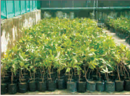
Hardening of plants in nursery