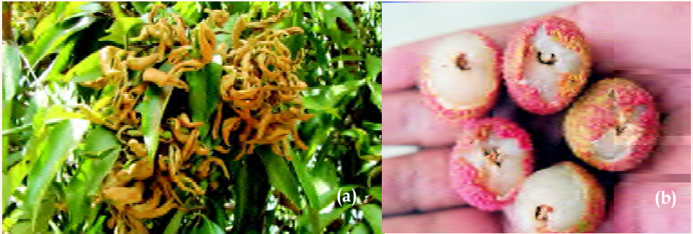
Mite infected leaf (a) and fruit borer infected fruits (b)

with the ultimate result of gall formation, curling, twisting, thickening and pitting of the affected leaves. The upper surfaces of the leaves give a characteristic greyish or dried appearance. The leaves may ultimately fall off. Mites have been found to attack and cause malformation of inflorescence. The affected flowers or buds show an enormous increase in size are thickened with yellow colour. An enlargement upto 4-5 times the normal size is not rare. In affected flowers, calyx is highly enlarged and sharply divided at the top showing the presence of 4 or 5 sepals. The peduncle is highly thickened and elongated. Some affected flowers have been found to develop highly thickened and elongated bracts, though they are normally ebracteate. Ultimate result is extremely low or 'no' fruit set.