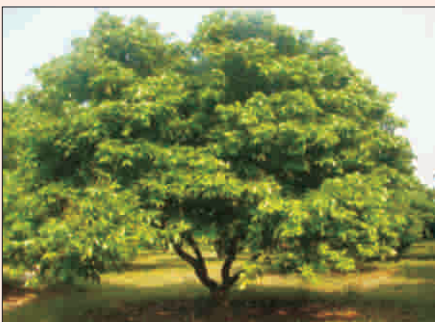
Ideal canopy for adult plant