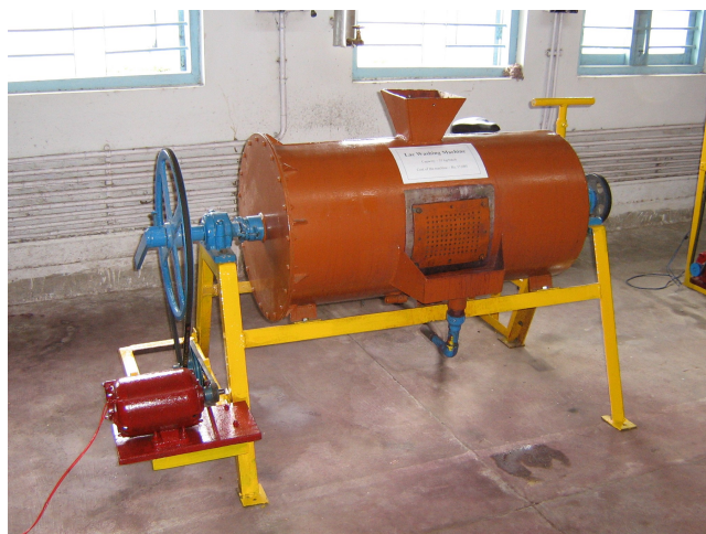
Fig. 1: Lac washing machine