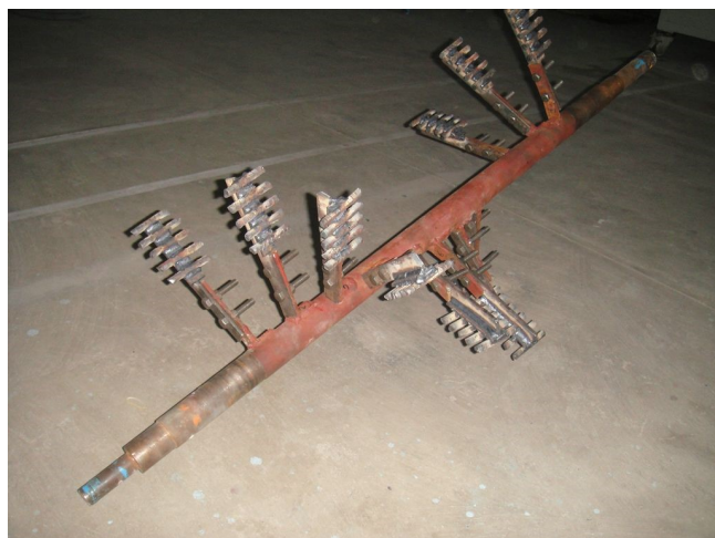
Fig. 3: Modified churning blade mounted on shaft of washing machine

For washing seedlac utilizing lac washing machine with set of modified churning blade, one set of modified churning blade were fixed on the shaft of washing barrel and required quantity of crushed sticklac having grain size 8 – 10 mesh was charged and washing was performed as detailed in Table 1. Wash water present inside the washing barrel was discharged completely by loosening the nut and bolt provided at the bottom gate of the washing machine. After final washing operation or removal of color of wash water, washed seedlac was discharged by completely opening the gate provided below the washing machine so that it is collected and dried. After collection of washed seedlac it was spread on the cemented floor in thin layer and time to time raking was done using wooden rack till complete drying of washed seedlac. Dried and washed seedlac was then winnowed using lac winnower to remove lighter impurities which were not removed during washing operation. The winnowed seedlac was then graded using lac grader to make the lac grains of uniform size. The washing process detailed below (Table 1) followed for each set of modified churning blade and quality parameters i.e. impurity and color index were determined for seedlac prepared using different profile of modified churning blade and compared.