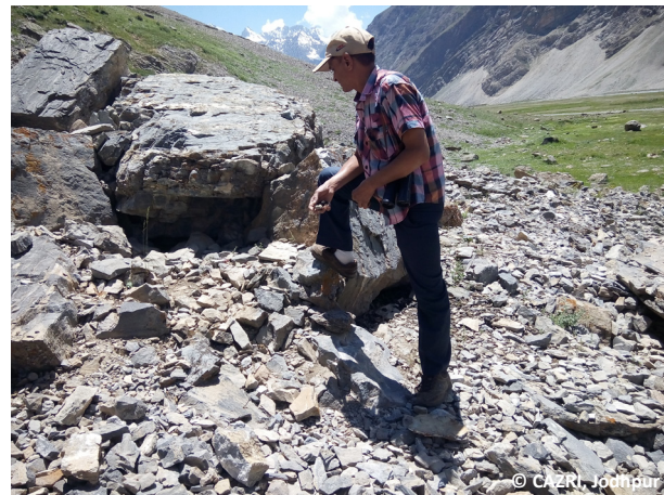
Image 3. Den of Himalayan Marmot

marmots was observed near cultivated fields. Maximum activity of marmots was observed in grassland (41.67%) followed by scrubland (29.76%), the reason probably being the availability of food and ease in excavation of burrows. A significant variation in the activity of marmots was observed in the different habitats ( X^2=42.27 , df=4 , p<0.01 ), which was in conformity with the reports of