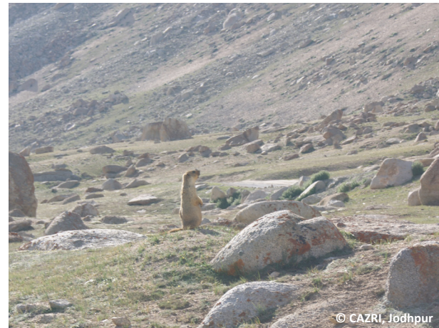
Image 4. Himalayan Marmot giving alarm