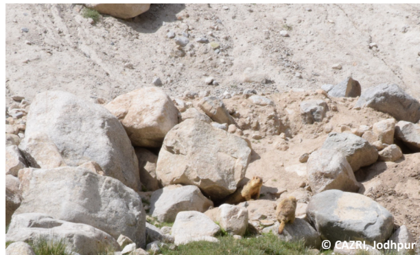
Image 2. Himalayan Marmot near steep slope