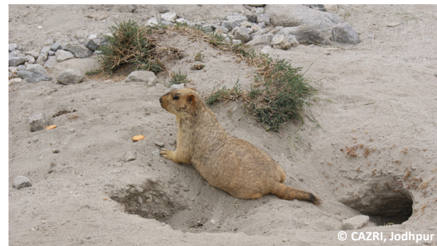
Image 5. Himalayan Marmot basking outside its burrow