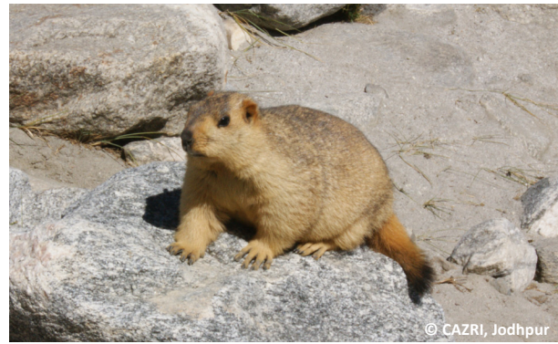
Image 1. Himalayan Marmot in rocky habitat