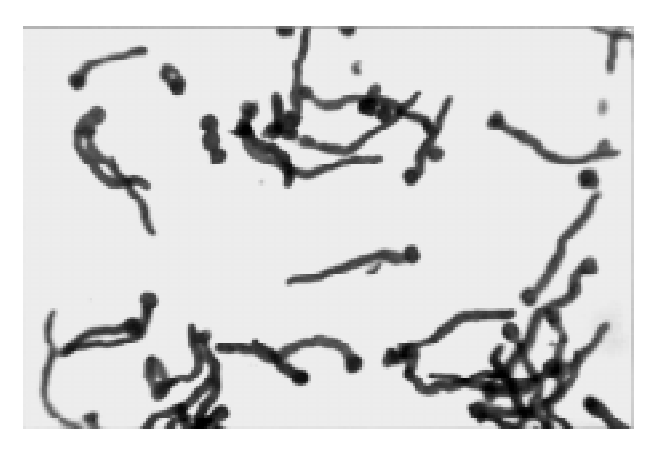
Fig. 1. In vitro pollen germination

In vitro test is based on the germination of pollen in artificial medium and a viable tool for determining viability of pollen grains in intervarietal crossing programme. Observations on in vitro pollen grain germination showed overall high rates of pollen germination in artificial media (Brewbaker's media). Pollen germination varied - the slowest being in S.officinarum and the fastest in commercials [3]. In our study, the highest pollen germination recorded was 25.0 % in Co 1148 (Fig. 1), Co 99008 and Co 86011 and 23.38 % in Co 62198 and Co 89003 had minimum germination of 11.11 %. All other clones recorded germination within this range of