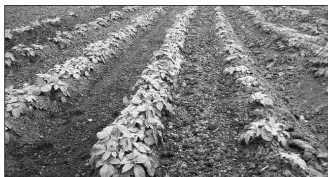
Line planted potato with earthing-up improves tuber yield