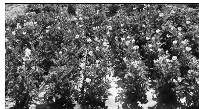
Use of black mulch in potato

Integrated pest management and use of light traps: Vegetables are fast-growing succulent plants, and are generally affected by some pests, diseases and especially weeds on which they hibernate and spread on succulent ones. Continuous cultivation on the same patch of land reduces soil productivity and result in low yields. On the other hand, pose susceptibility to biotic and abiotic stresses. For the purpose,