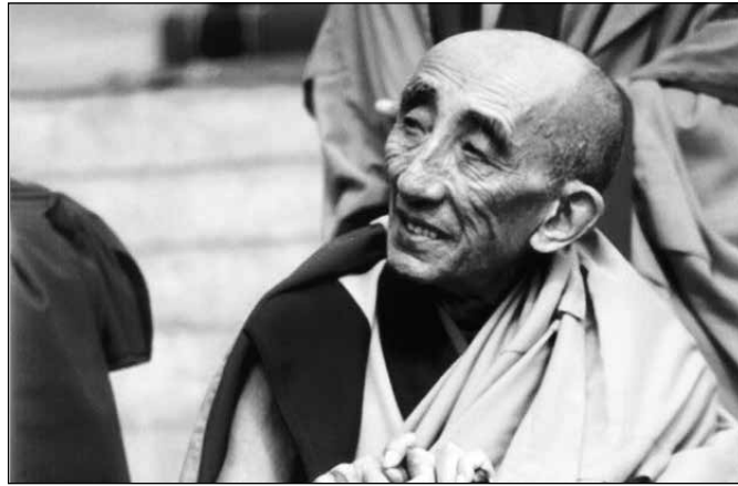
19th Kushok Bakula Rinpoche (19th of May 1917- 4th of November 2004)

In the year 1949, Kushok Bakula joined the mainstream of Indian politics and became a legislator in the Jammu and Kashmir State Assembly, and later a minister and then was elected to the Lok Sabha from the Ladakh Parliamentary Constituency. He boldly spoke out