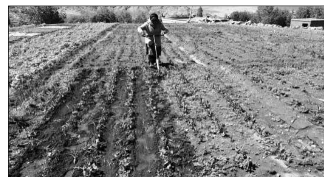
Line sown crop facilitate weed control using hand hoe

Solanaceous vegetables may be followed by leguminous vegetables, amaranth to avoid soil-borne diseases. According to IPCC (1995), the years have noticed warmer over the last few decades. Due to biotic and abiotic stress, insects are being observed in all the crops/ vegetables, forest trees, orchards, etc. Under the changing climate, there may be insect problems in future. Instead of using pesticides, use of light traps in apple and apricot orchards has been very useful and significant, controlling the further spread and commencement of problematic insects and reproduction.