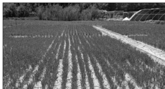
Line sown crop improve the crop growth and yield

The writer is a New Delhi-based Editor-at-large, columnist and professional speaker