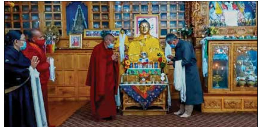
President LBA and LGA paying tribute to the Lord Buddha on Buddha Jayanti at Chowkhang Vihara.