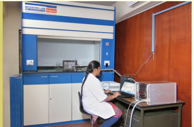
Plasma reactor for textiles