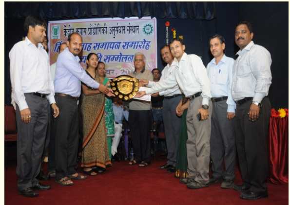
Best Hindi work Award to CBPD Division