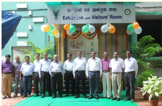
Inauguration of Exhibition cum Visitors' room