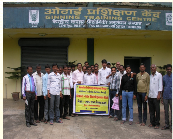
Visitors to GTC, Nagpur

Visits of around 150 farmers from different districts of Gujarat and Madhya Pradesh were arranged at Ginning Training Centre (GTC) of CIRCOT, Nagpur under ATMA programme during the month of Aug-Sept 2014. Farmers were explained about maintaining the quality of cotton while picking, storage and transportation, quality based marketing of cotton and preparation of value added products from cotton and its by-produce. In addition, farmers were also demonstrated the pilot plants for preparation of particle boards from cotton stalks. Farmer friendly CIRCOT technologies like small lab model gins, acid delinting machine, farm level axial pre-cleaner, etc. were also demonstrated to the visitors. Several students from different local Engineering Colleges and Polytechnics also visited GTC.