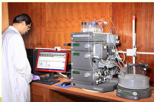
Fast protein liquid chromatograph