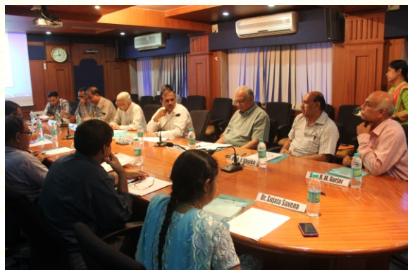
Experts during discussions about Pilot Plant