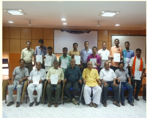
Trainees with GTC staff

A week training programme was organised on Operation and Trouble Shooting of Double Roller (DR) gins for 12 fitters of M/s. Manjeet Cotton Pvt. Ltd., Aurangabad at Ginning Training Centre (GTC) of CIRCOT, Nagpur during Sept 15-20, 2014. Trainees have undergone rigorous practical training for settings of DR gins for different cotton staples and moisture content. A series of lectures were also delivered on preservation of the inherent cotton parameters during ginning operation, increasing the productivity of DR gins, proper grooving of leather rollers, etc. A special lecture on impact of processing of extremely wet cotton on quality of lint and maintenance of DR gin was also arranged. Fitters had also opportunity to discuss their field problems with the experts of M/s. Bajaj Steel industries, Ltd. Nagpur. Shri. S. N. Soni, Managing Director, M. K. Enterprises, Nagpur graced the valedictory function and distributed the certificates to the participants.