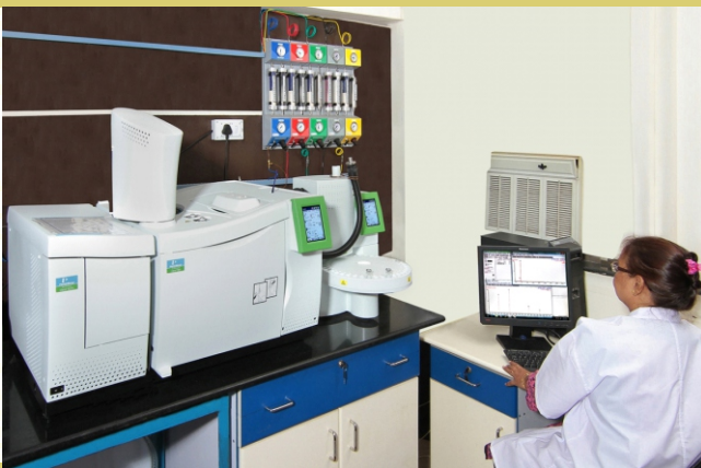
Gas chromatograph mass spectrophotometer