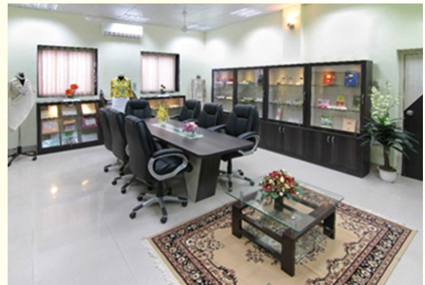
Inside view of Exhibition cum Visitors' room