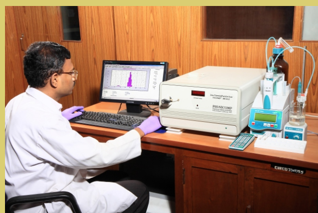
DLS particle size analyzer