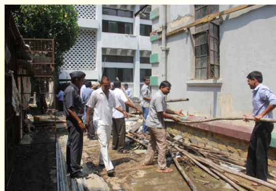
CIRCOT staff during cleaning activity

Cleanliness is next to the godliness. To follow the guidelines from the Council, on September 30, 2014 all CIRCOT staff members voluntarily participated in the cleaning of institute premises by forming human chain.