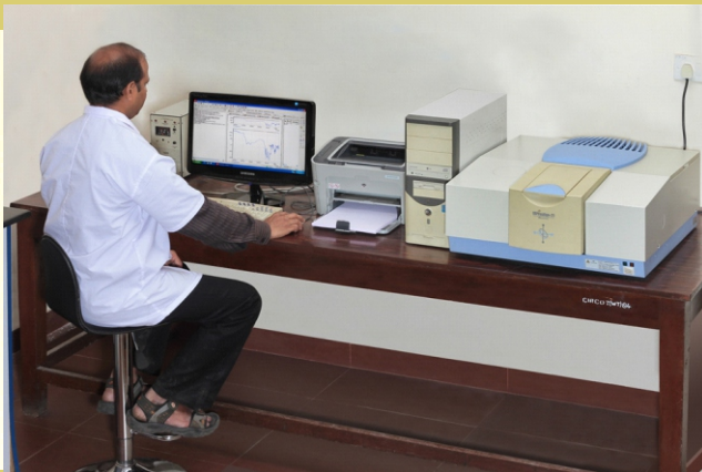
Fourier Transformation Infra red Spectrophotometer