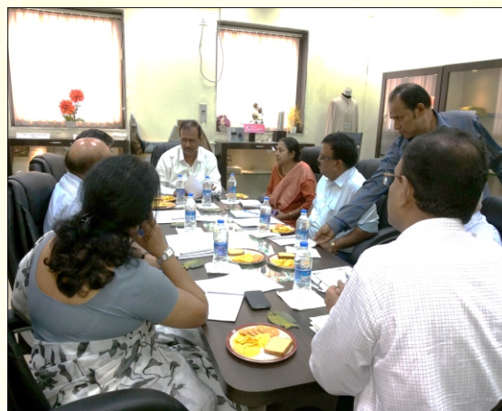
Director is discussing with RCF delegates