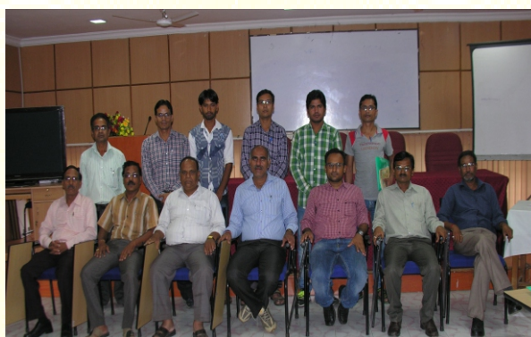
Trainees with GTC Nagpur Staff

A week training programme on ' Cotton Processing, Classing and Marketing ' was arranged for ginners, classers and traders during Sept 1-6, 2014 at GTC of CIRCOT, Nagpur. Trainees from different parts of Maharashtra and Madhya Pradesh participated in this training programme. A series of in-house and guest lectures were arranged on different aspects of quality assessment, cotton grading and marketing and by-product utilization of cotton. In addition, hands on training were also imparted on gin settings, automation, stapling of cotton, etc.