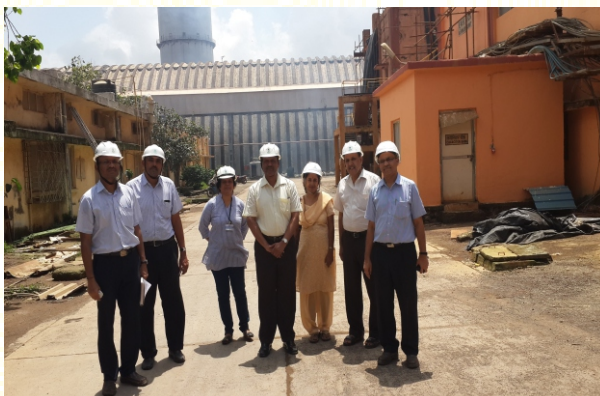
CIRCOT scientists at RCF, Mumbai