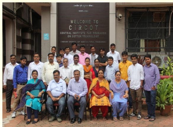
Trainees with CIRCOT Staff