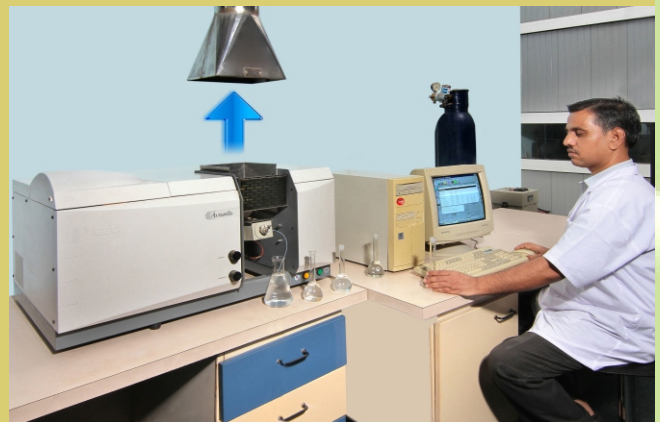
Atomic absorption spectrophotometer